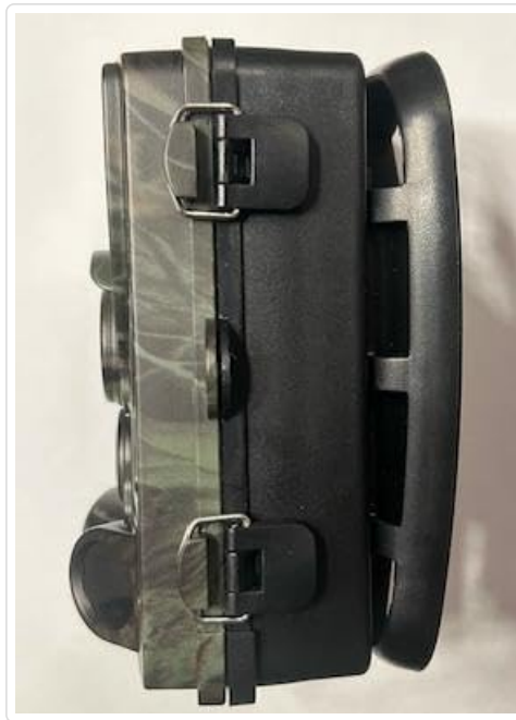
Image: Side view of the HC-801LTE camera, illustrating the robust latches that secure the device.