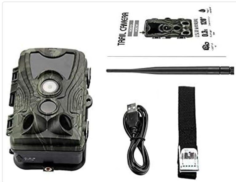
Image: The HC-801LTE camera shown with its standard accessories, including the 4G antenna, USB cable, and a black mounting strap.

Note: SIM card, SD card, and AA batteries are not included and must be purchased separately.