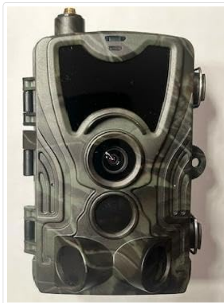
Image: Front view of the HC-801LTE camera, highlighting the lens, PIR sensors, and the integrated display.