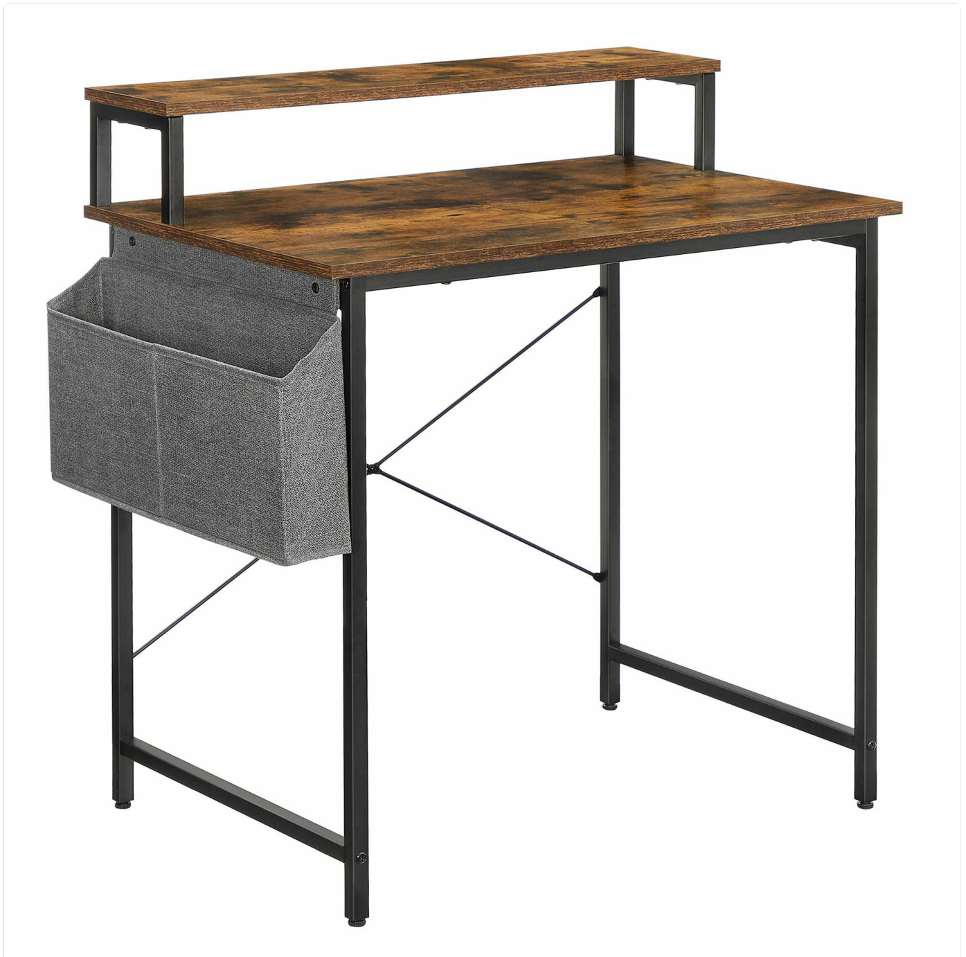
Image: The VASAGLE LWD080B01 Computer Desk in a home office setting.