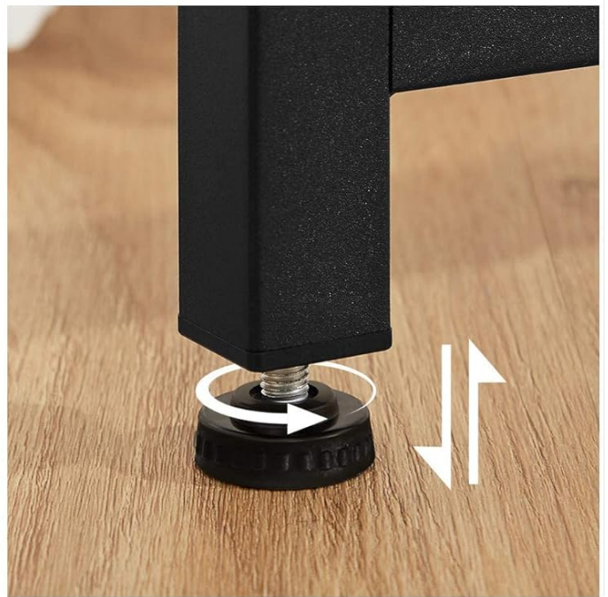
Image: Detailed views of desk features, including the desktop, monitor stand, adjustable feet, and storage bag.