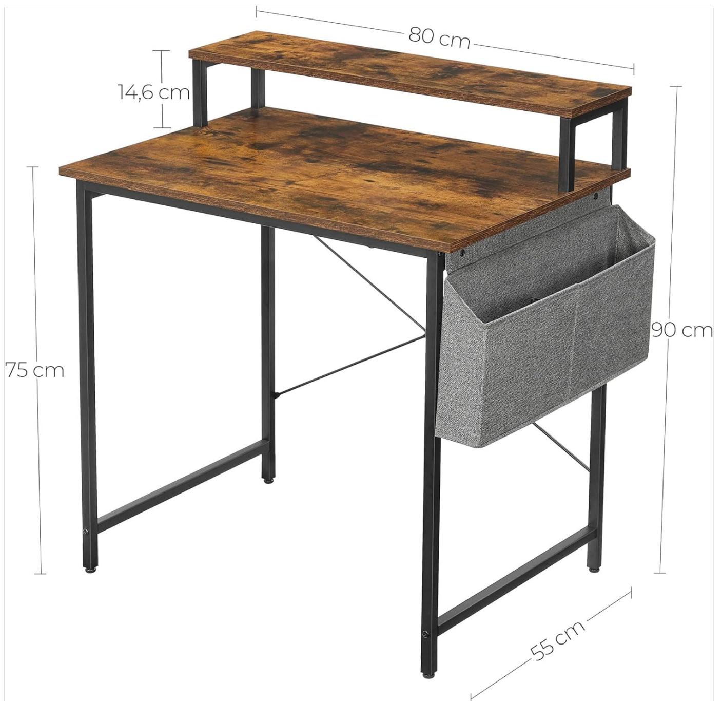
Image: Desk dimensions and components overview. The desk measures 80 cm wide, 55 cm deep, and 75 cm high to the main desktop. The monitor stand is 14.6 cm high.