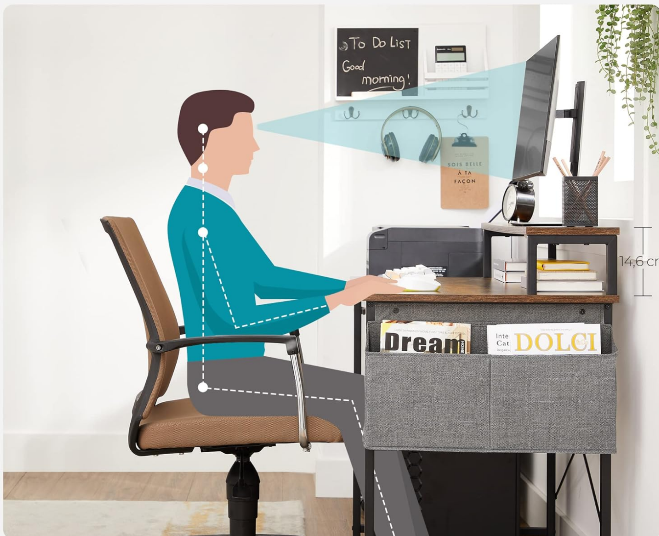
Image: Ergonomic benefits of the monitor stand, showing correct user posture.

Raises the screen for comfortable viewing.