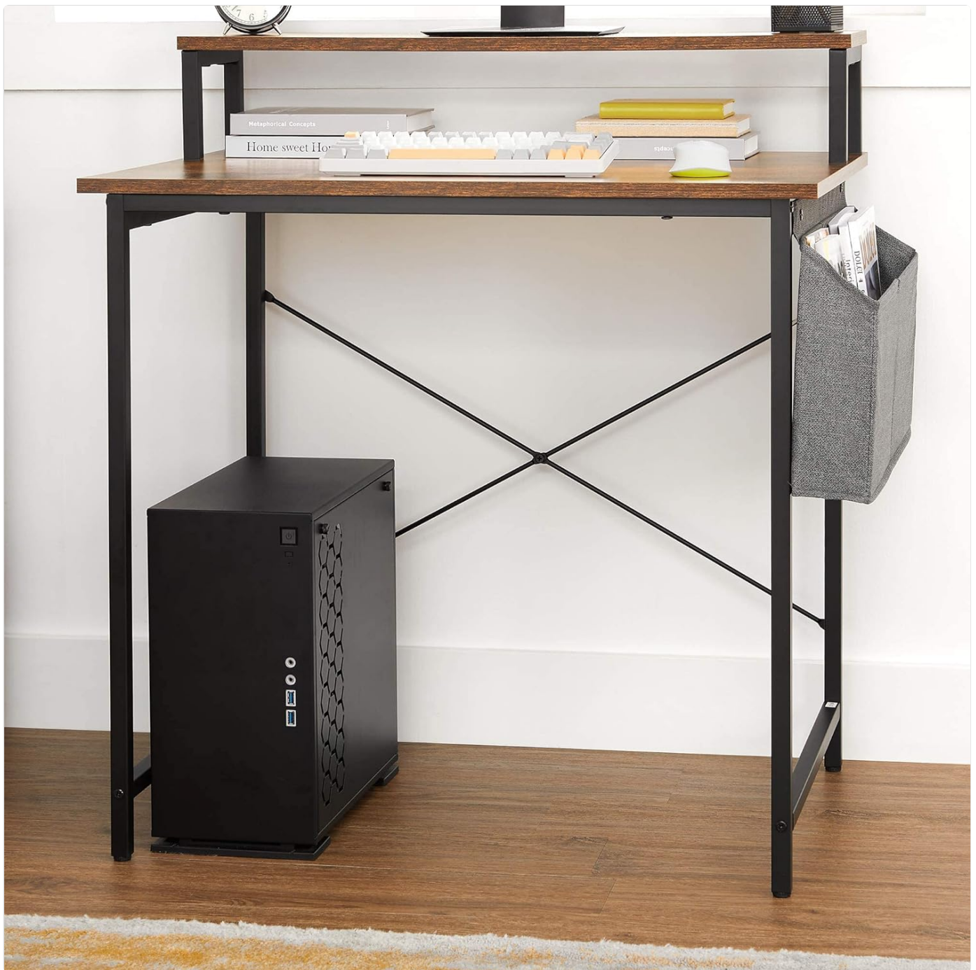
Image: Front view of the desk, highlighting the X-bars and space for a computer tower.