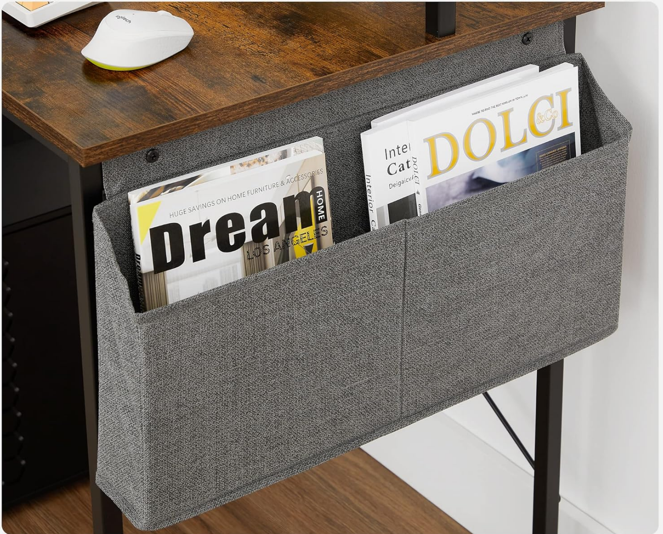
Image: Close-up of the fabric storage bag, demonstrating its capacity for office items.

For convenient storage of your office supplies.