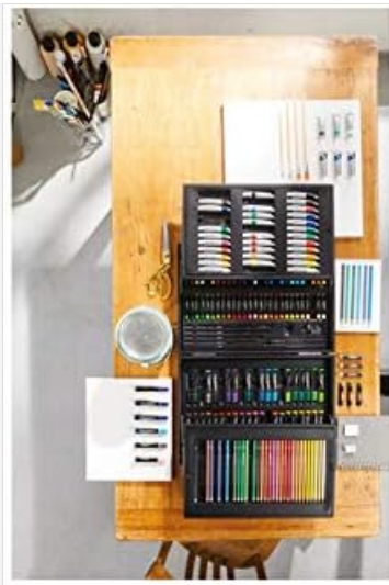
Image: An overhead perspective of the open Crelando Artist Gift Set, positioned on a wooden table alongside additional art tools and materials, illustrating a complete creative workspace.