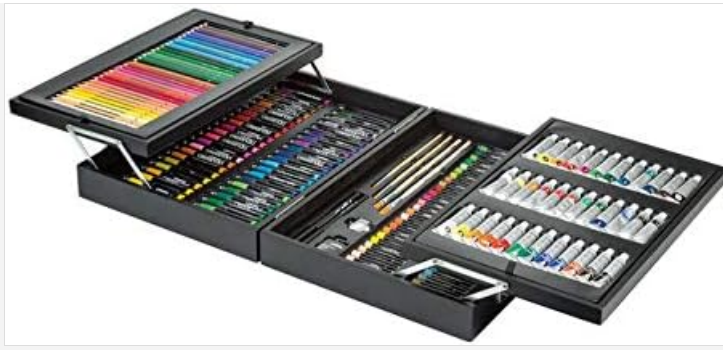
Image: The Crelando Artist Gift Set fully opened, displaying the organized arrangement of pencils, markers, paints, and brushes within its wooden case.