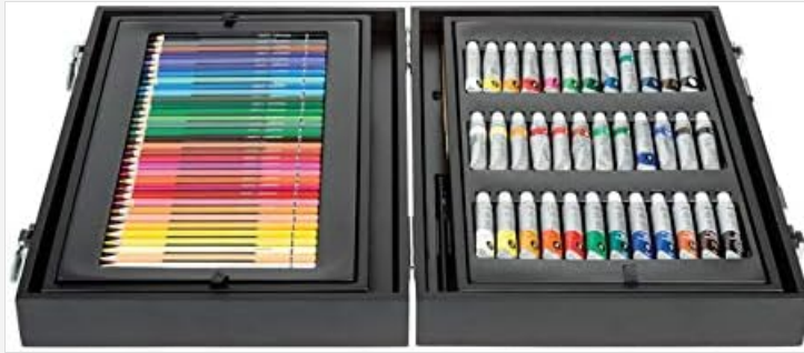
Image: A detailed view of the open art set, focusing on the vibrant array of colored pencils and tubes of paint, neatly arranged in their trays.