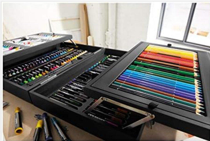
Image: The Crelando Artist Gift Set open on a wooden surface, with some art supplies partially removed, suggesting active use and accessibility.