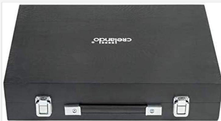
Image: The Crelando Artist Gift Set in its closed, compact wooden case, showcasing its portable design and sturdy latches.