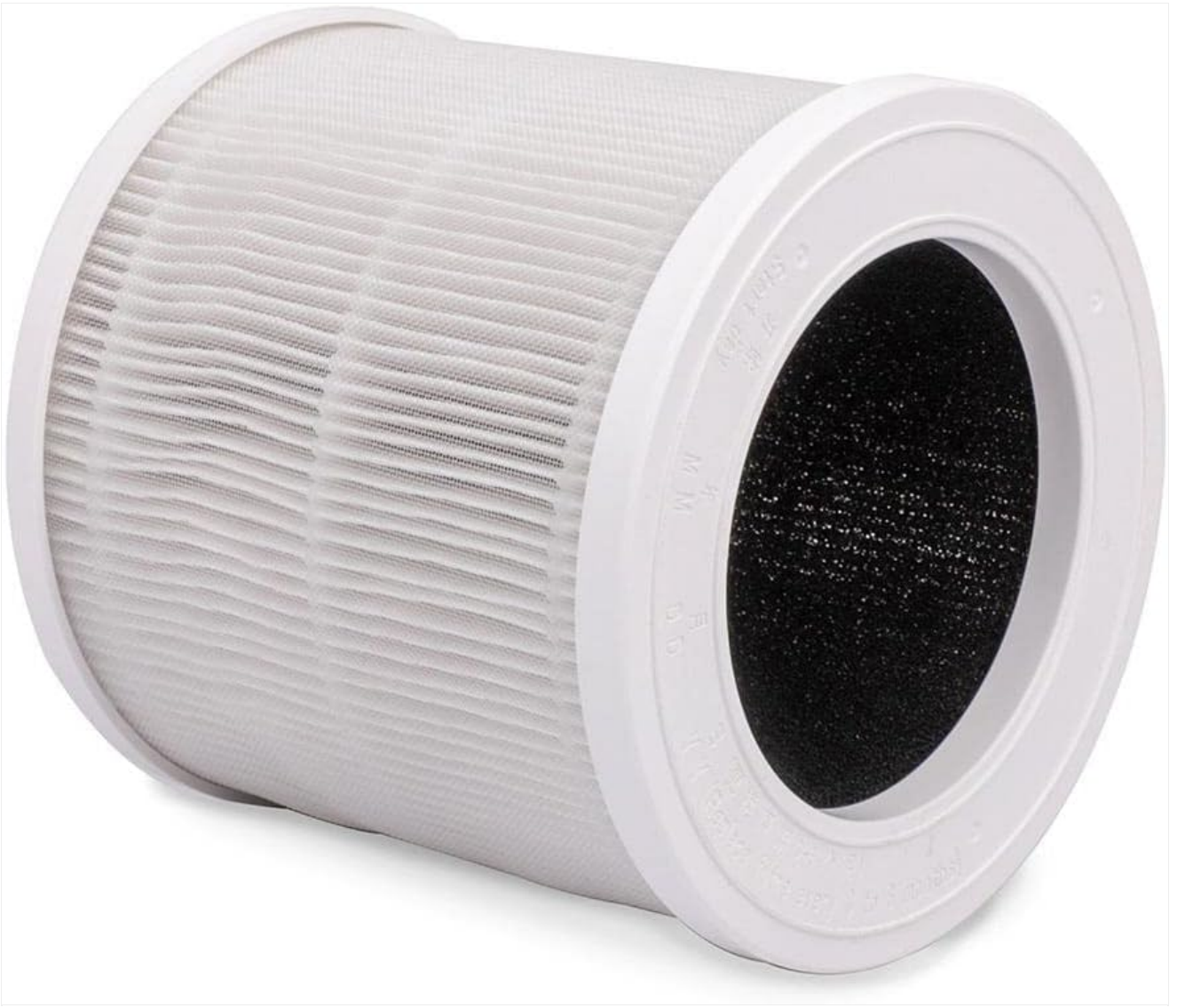
Image: The Proton Pure Portable HEPA Replacement Filter, a cylindrical white filter with a black inner core, designed for efficient air purification.