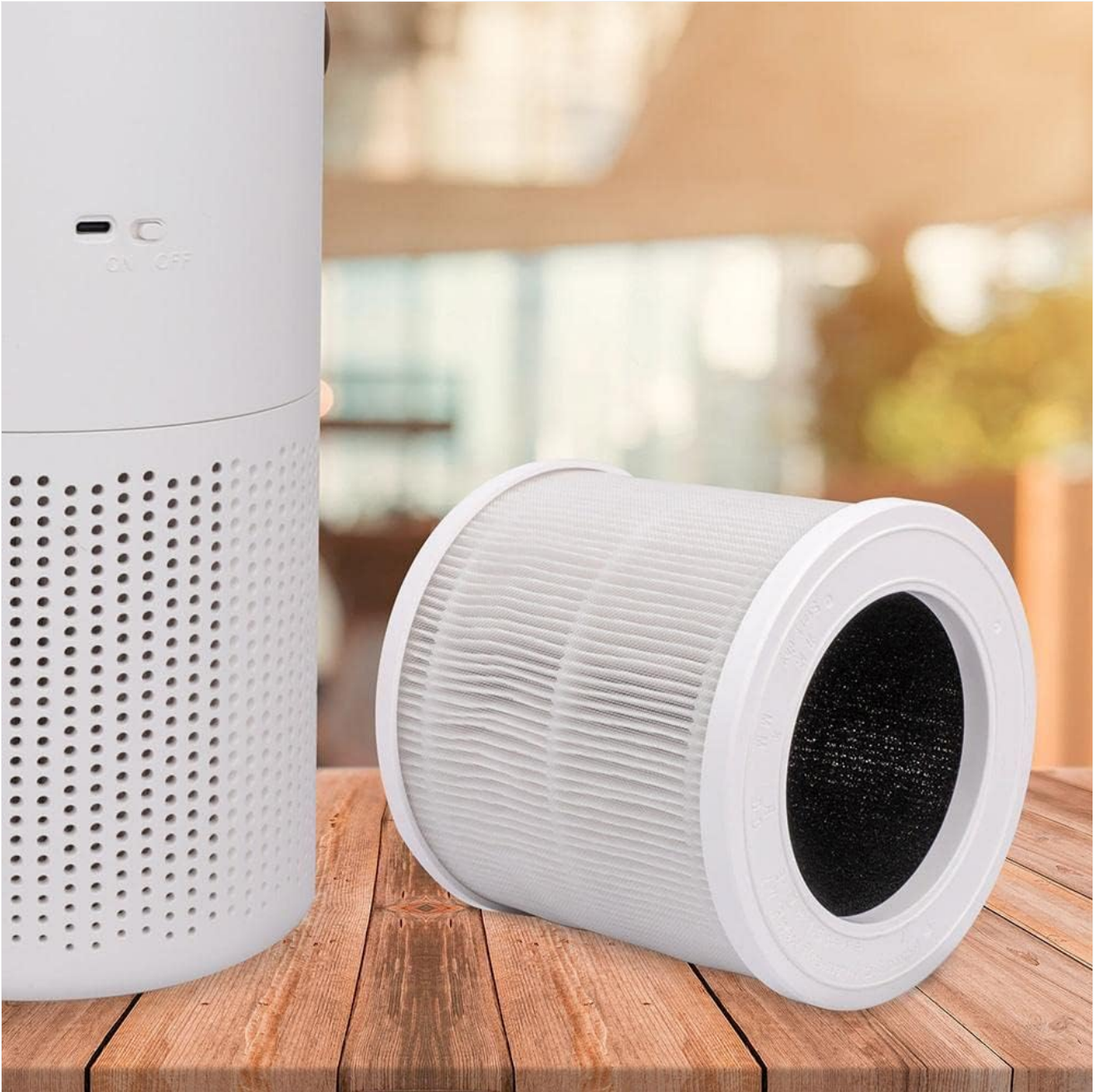
Image: A visual representation of the filter replacement process, showing the filter being removed or inserted.

The lifespan of your filter depends on usage frequency and air quality. Your Proton Pure Air Purifier features a small display that will indicate when it is time to change the filter. It is recommended to replace the filter promptly when indicated to ensure continuous high-quality air purification.