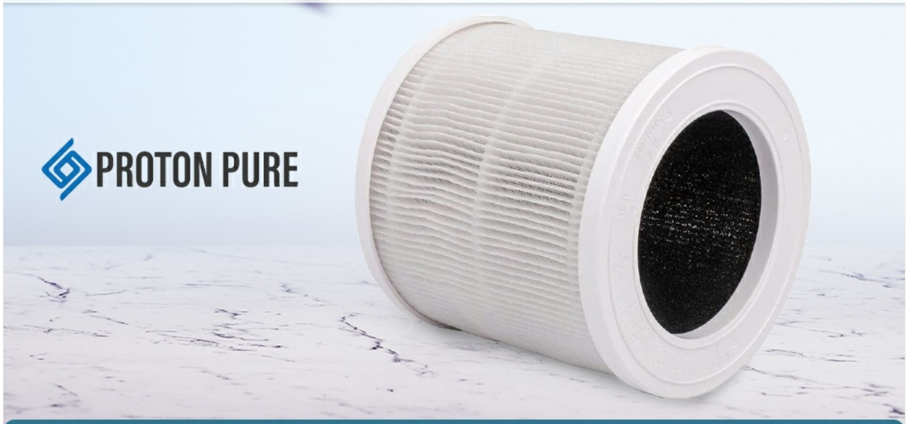
Image: An overview of the Proton Pure Portable HEPA Filter, highlighting its compatibility with Proton Pure air purifiers.

WITH TRUE HEPA AIR FILTRATION TECHNOLOGY, PROTON PURE AIR PURIFIERS FOR HOME