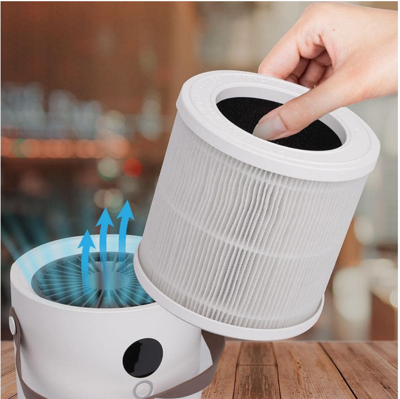
Image: A close-up view of a hand carefully inserting the new Proton Pure HEPA Replacement Filter into the air purifier unit.