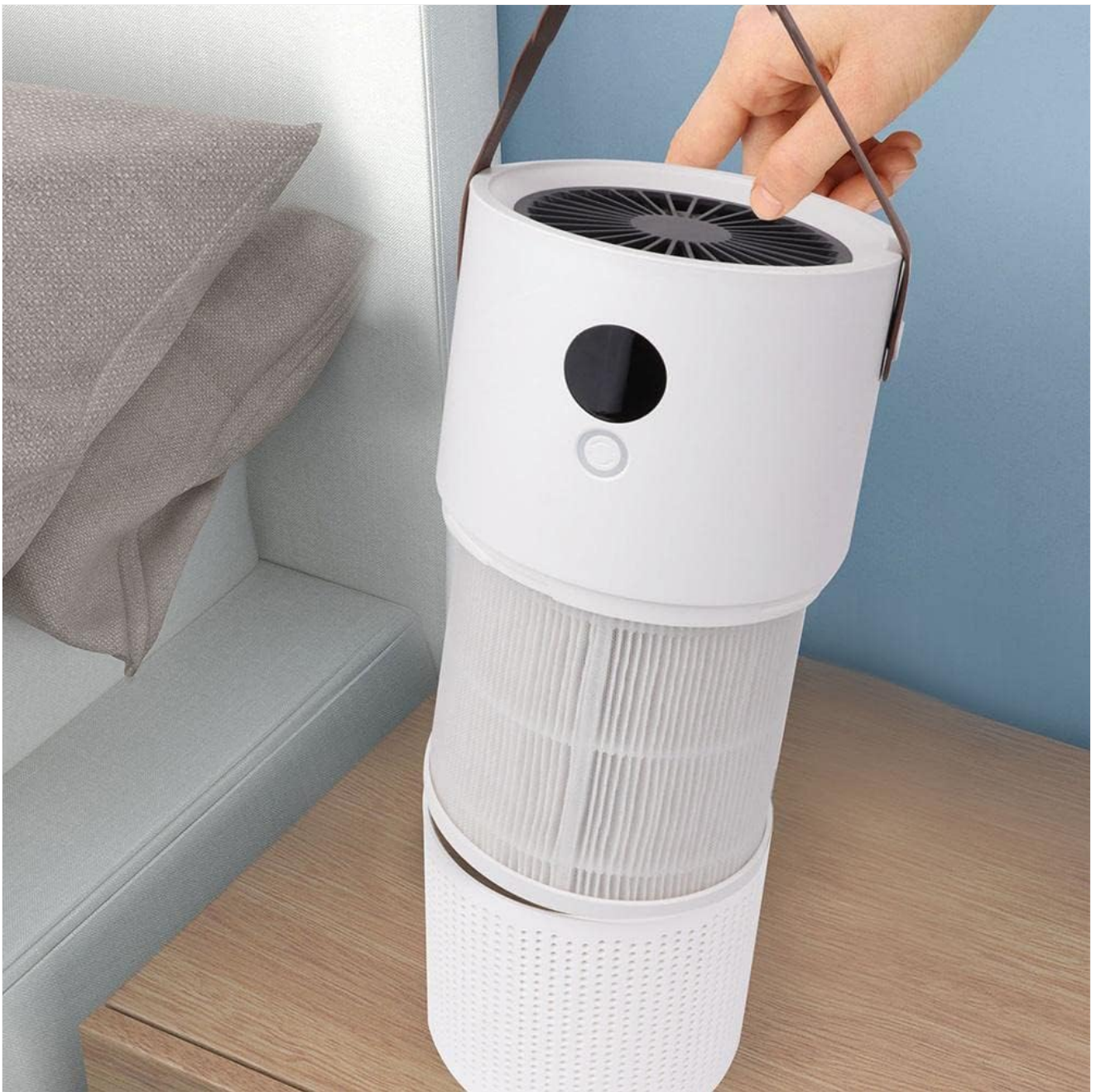
Image: A hand demonstrating how to open the Proton Pure air purifier to access the filter compartment for replacement.