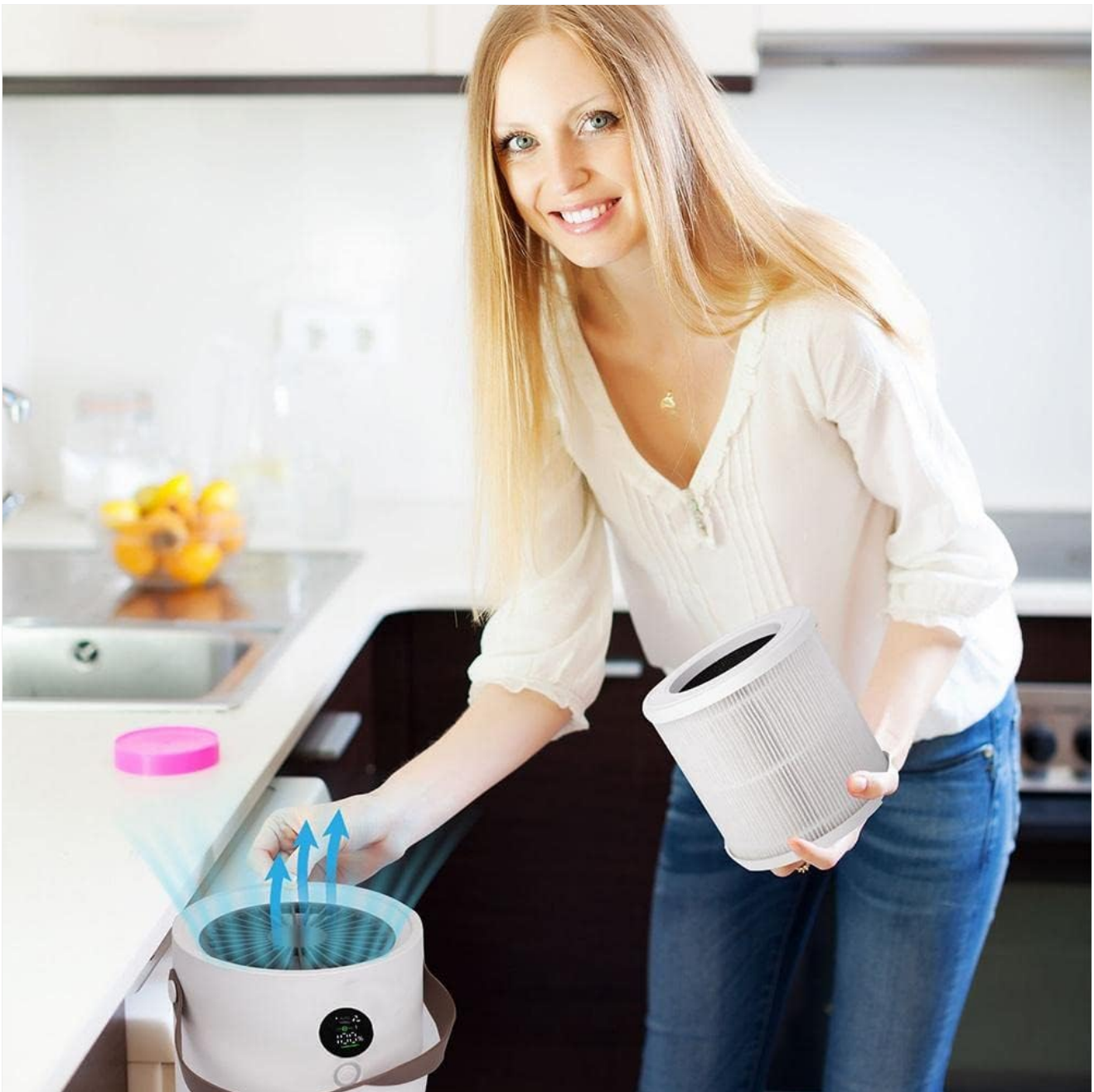
Image: A woman demonstrating the ease of replacing the Proton Pure filter in a home kitchen setting.