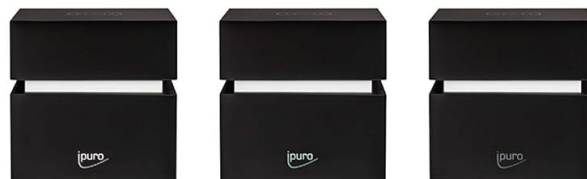
A) weißes Licht

Berühren Sie das MODUS-LOGO (C) dreimal, um das Gerät in den Standby-Modus zu versetzen.