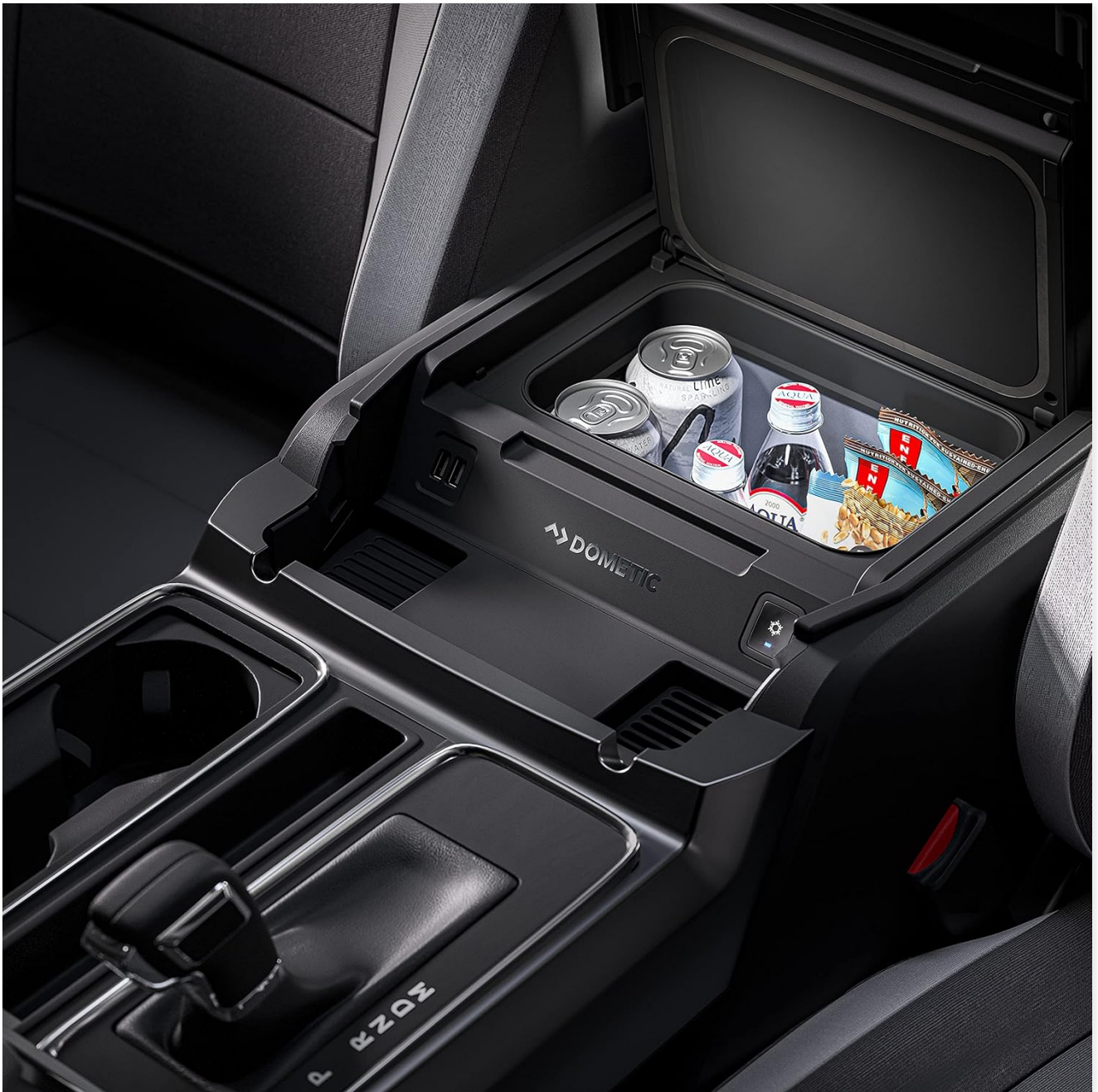
Figure 3.2: Interior view of the Dometic CCF-T, demonstrating its capacity to hold multiple beverages and small items.