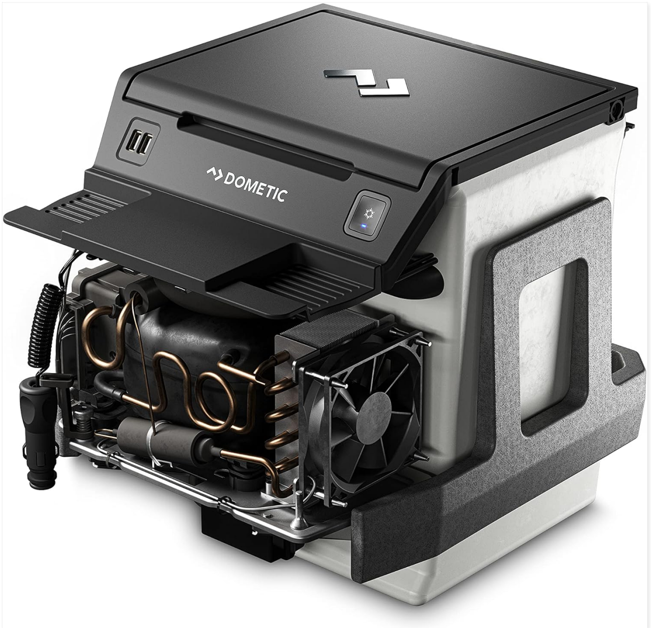
Figure 3.1: Dometic CCF-T unit with exposed internal components, showing the compressor and cooling fan.