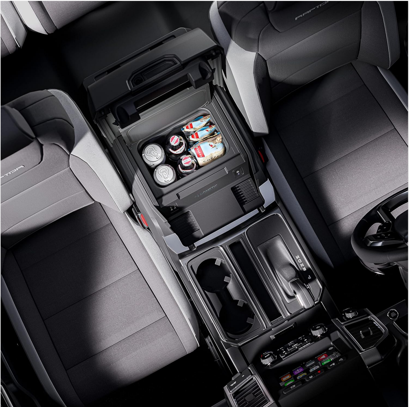
Figure 4.1: The Dometic CCF-T seamlessly integrated into a Ford F-150 center console, viewed from above.