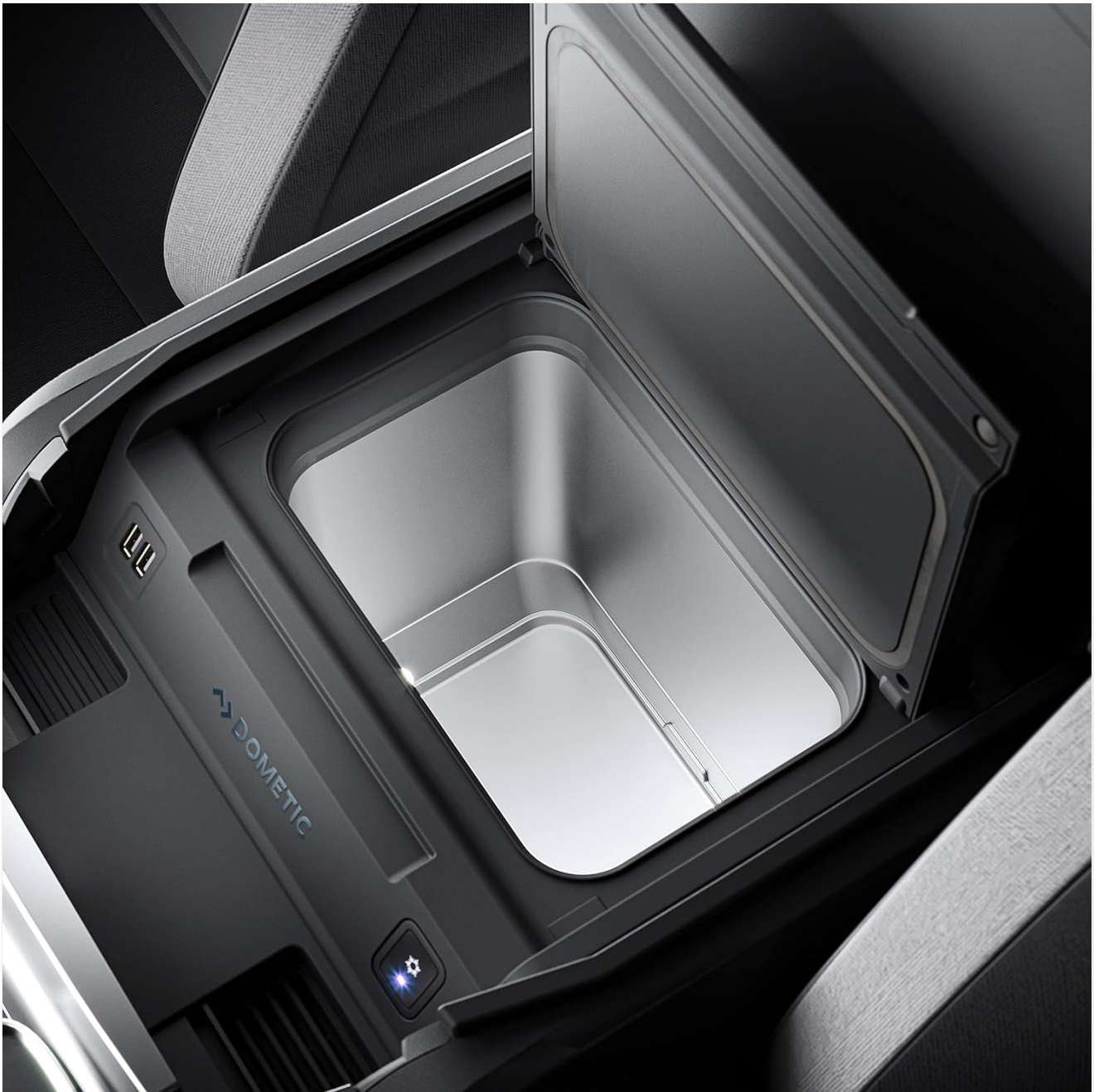
Figure 4.2: A close-up view of the Dometic CCF-T installed in the vehicle's center console, showing its flush fit.