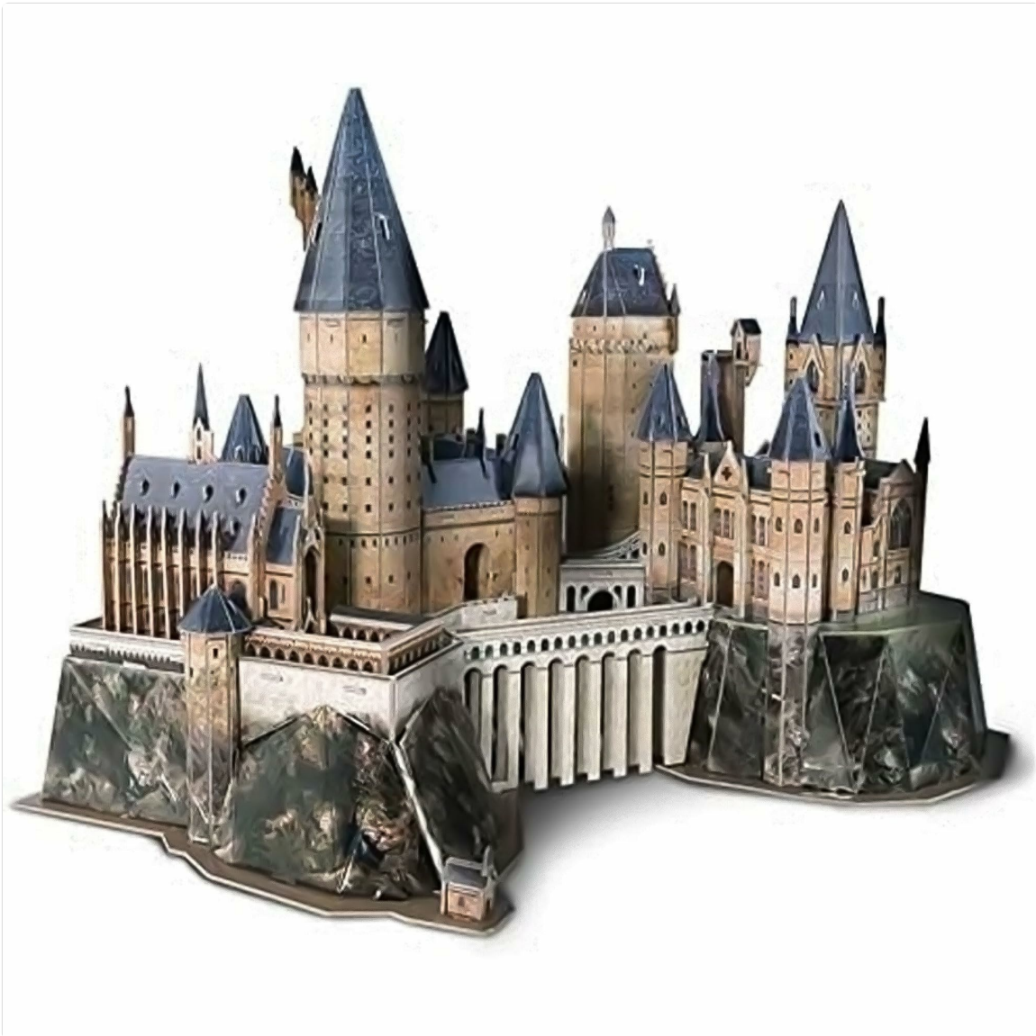
Figure 3: The fully assembled CubicFun Harry Potter Hogwarts Castle 3D Puzzle, showcasing its intricate details and architectural design. This image represents the final product ready for display.