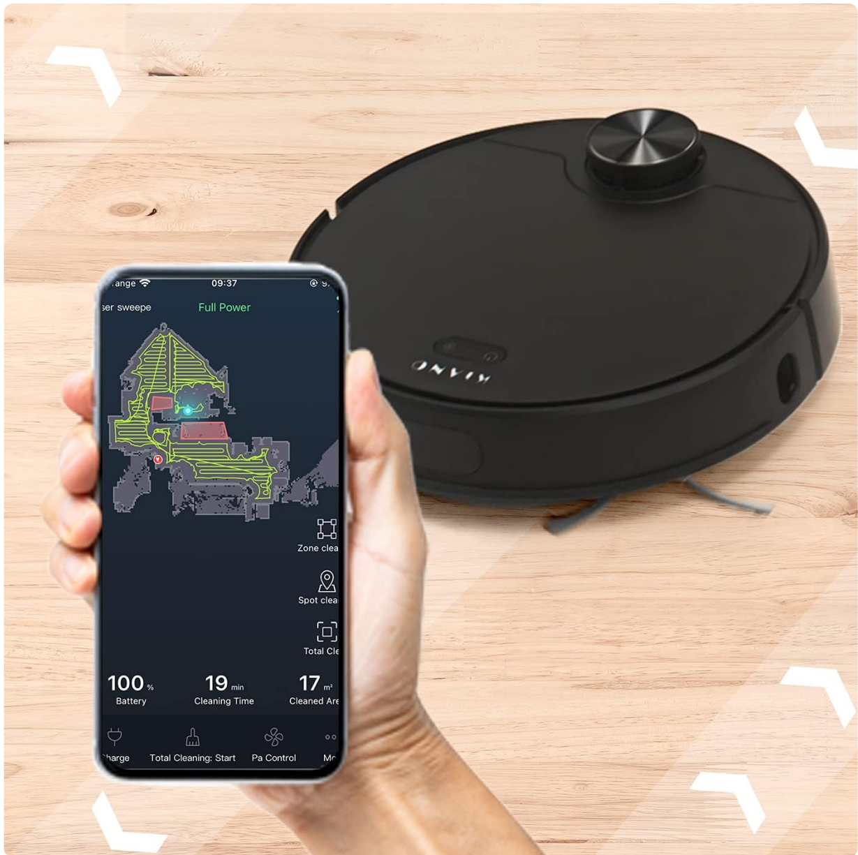
Image 6.2: The mobile app interface showing the robot's mapping and cleaning status.