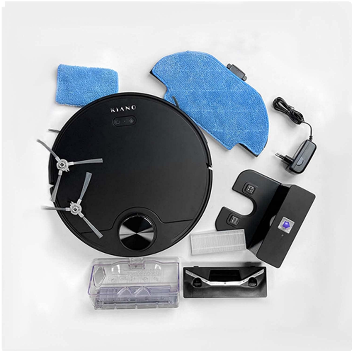
Image 3.1: Overview of the Kiano Elegance Robot Vacuum Cleaner and its accessories.