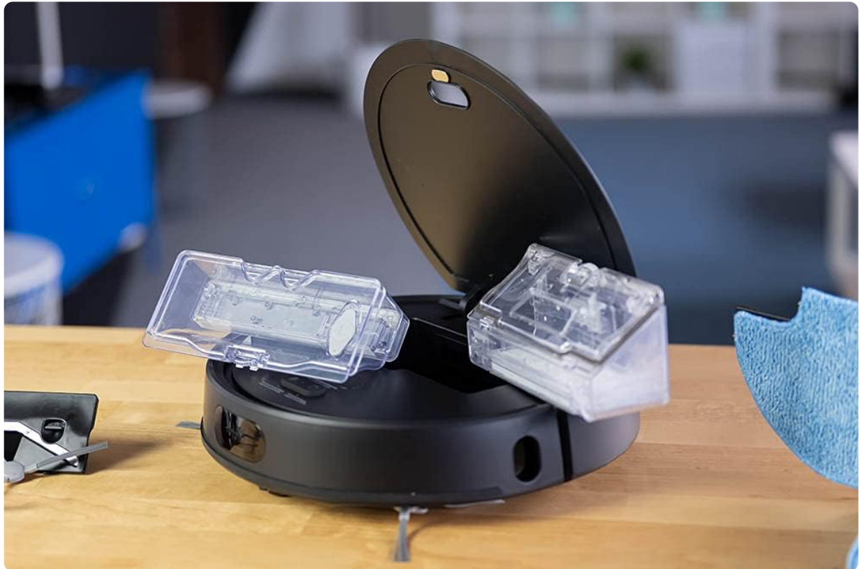
Image 7.1: The robot with its dustbin and water tank compartments open.

After each cleaning cycle, or when indicated by the app, remove and empty the dustbin. If using the mopping function, empty and clean the water tank as well.