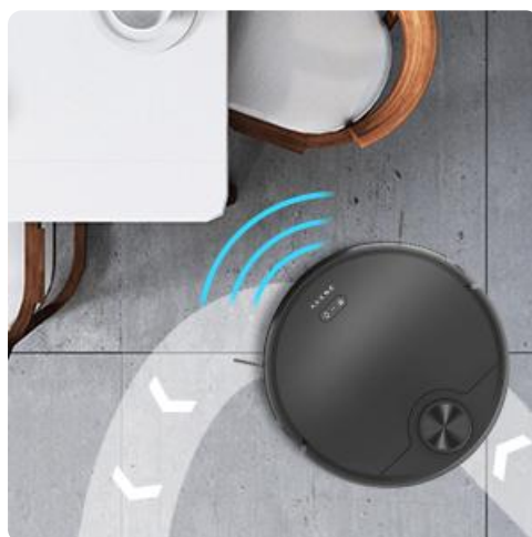
Image 6.3: Visual representation of the robot's laser navigation and route planning capabilities.