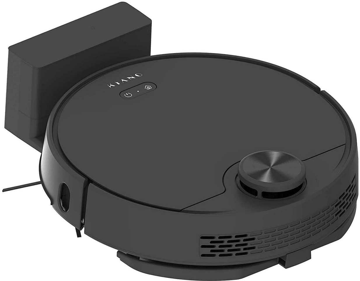
Image 5.1: The robot vacuum automatically returning to its charging station.

Connect the power adapter to the charging dock and plug it into a wall outlet. Place the robot onto the charging dock. The robot will automatically begin charging. For first-time use, charge the robot for at least 6 hours or until the battery indicator shows a full charge.