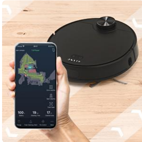
Image 6.7: The mobile app for remote control and advanced settings.