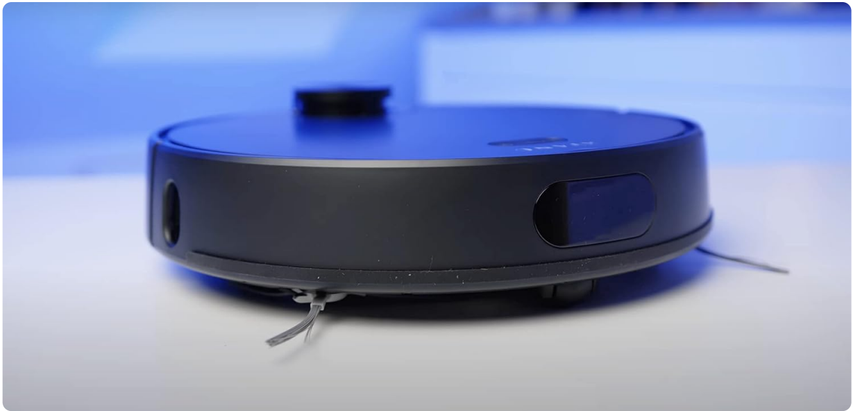
Image 4.1: Side profile of the Kiano Elegance Robot, highlighting its compact design.