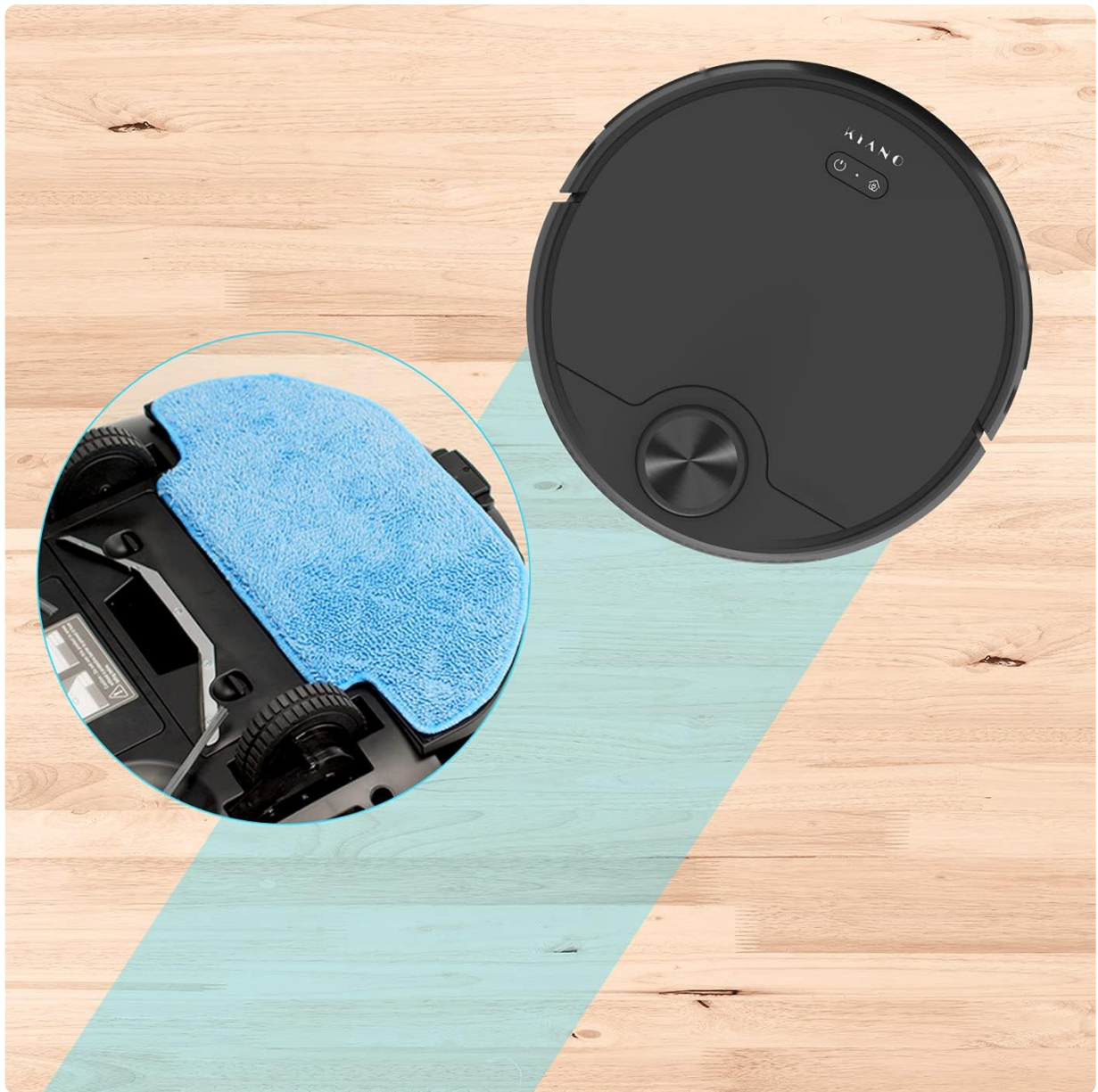
Image 6.4: The robot with the mopping attachment for wet cleaning.