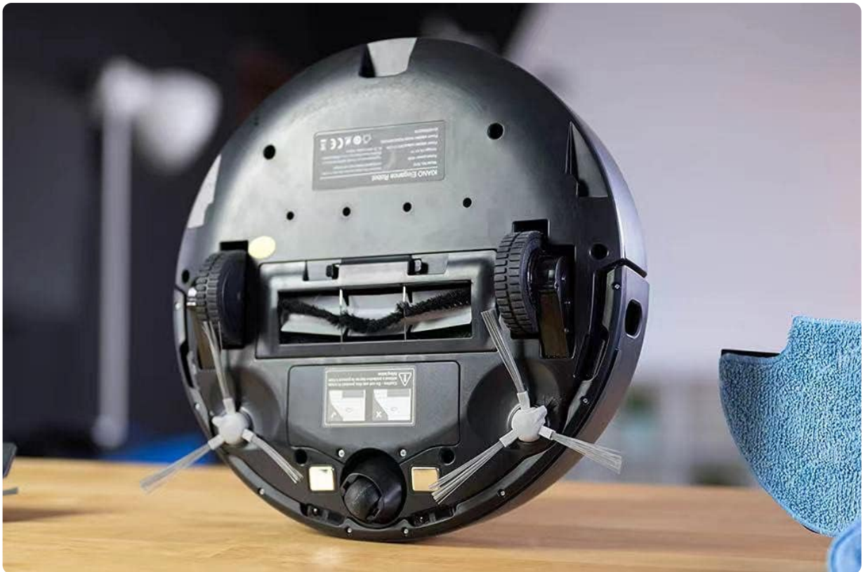
Image 4.2: The bottom of the robot, displaying the main brush, side brushes, and wheels.

The underside includes the main brush, side brushes, driving wheels, and cliff sensors.