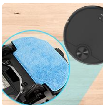
Image 6.5: Detail of the mopping cloth and its attachment mechanism.