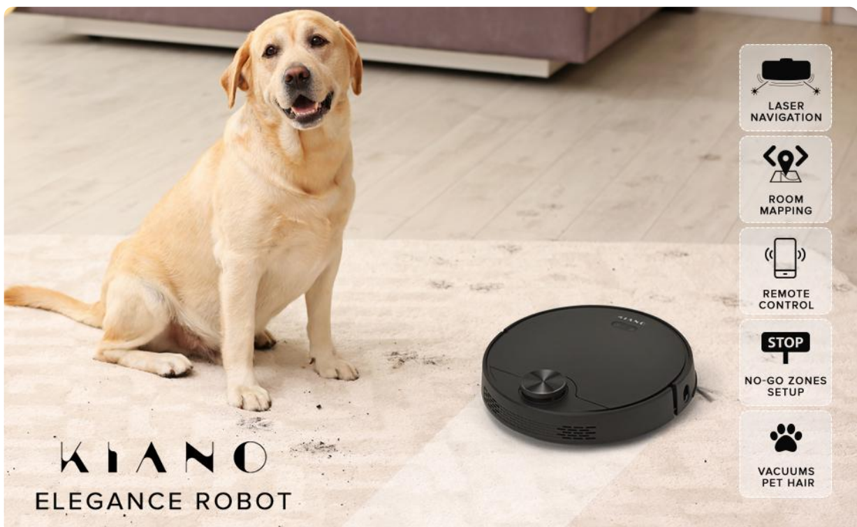
Image 1.1: The Kiano Elegance Robot Vacuum Cleaner in a home environment.

Thank you for choosing the Kiano Elegance Robot Vacuum Cleaner. This manual provides essential information for the safe operation, maintenance, and troubleshooting of your device. Please read it thoroughly before use and retain it for future reference.