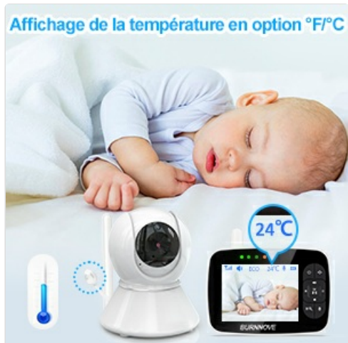
Image: The monitor displays the room temperature, allowing you to ensure a comfortable environment for your baby.