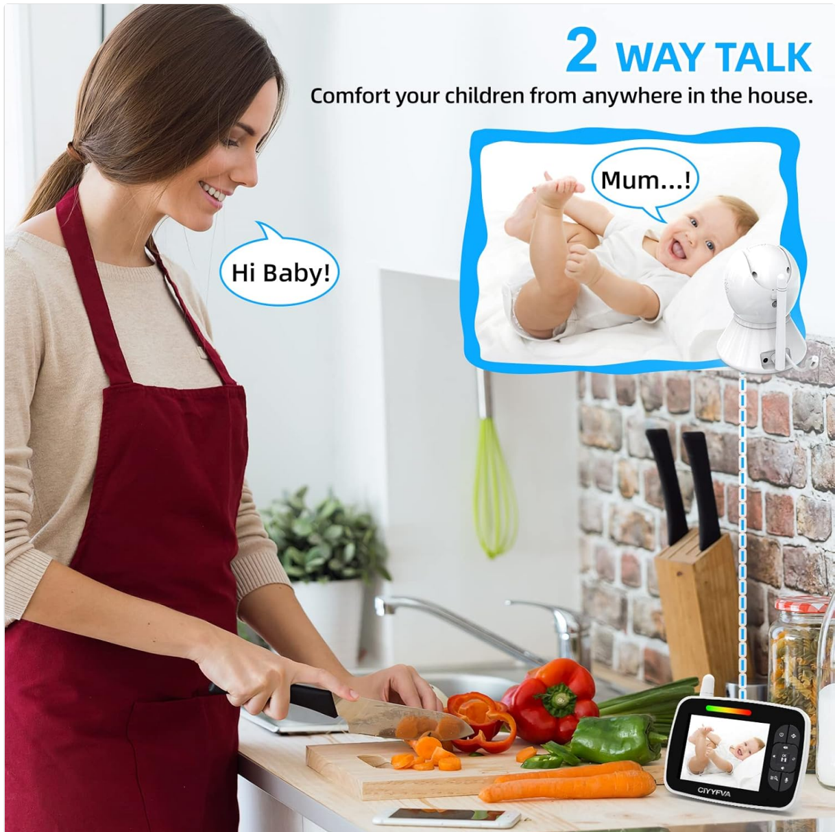
Image: The two-way talk feature allows parents to communicate with their baby from anywhere in the house.