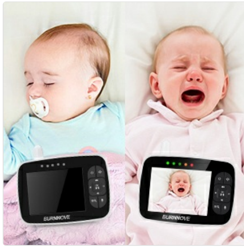
Image: ECO mode intelligently conserves power by turning off the screen and audio when the room is quiet, and reactivating upon detecting sound.