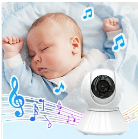
Image: The baby monitor includes built-in lullabies to help soothe your baby to sleep.