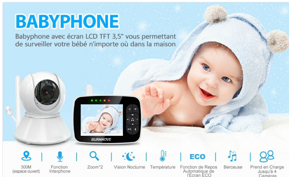
Image: The BURNNOVE SM35PTZ baby monitor system, showcasing its key features such as 300m range, two-way

Please read this manual thoroughly before using the product and keep it for future reference.