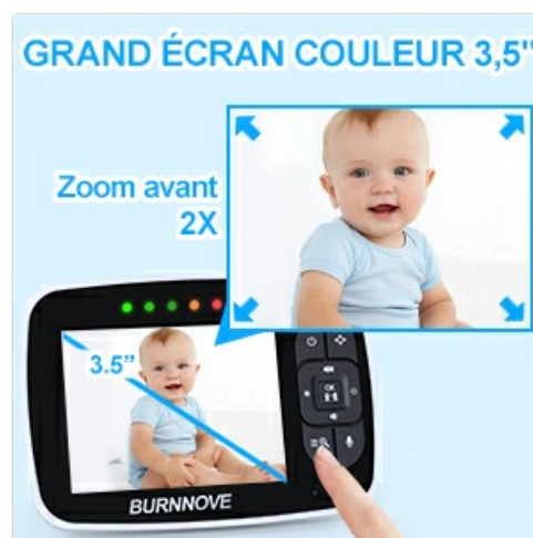
Image: The 3.5-inch color screen provides a clear view, with a 2x digital zoom function to see your baby more closely.

Image: The baby unit camera offers 355° horizontal pan and 120° vertical tilt, controllable from the parent unit. The system supports up to four cameras.