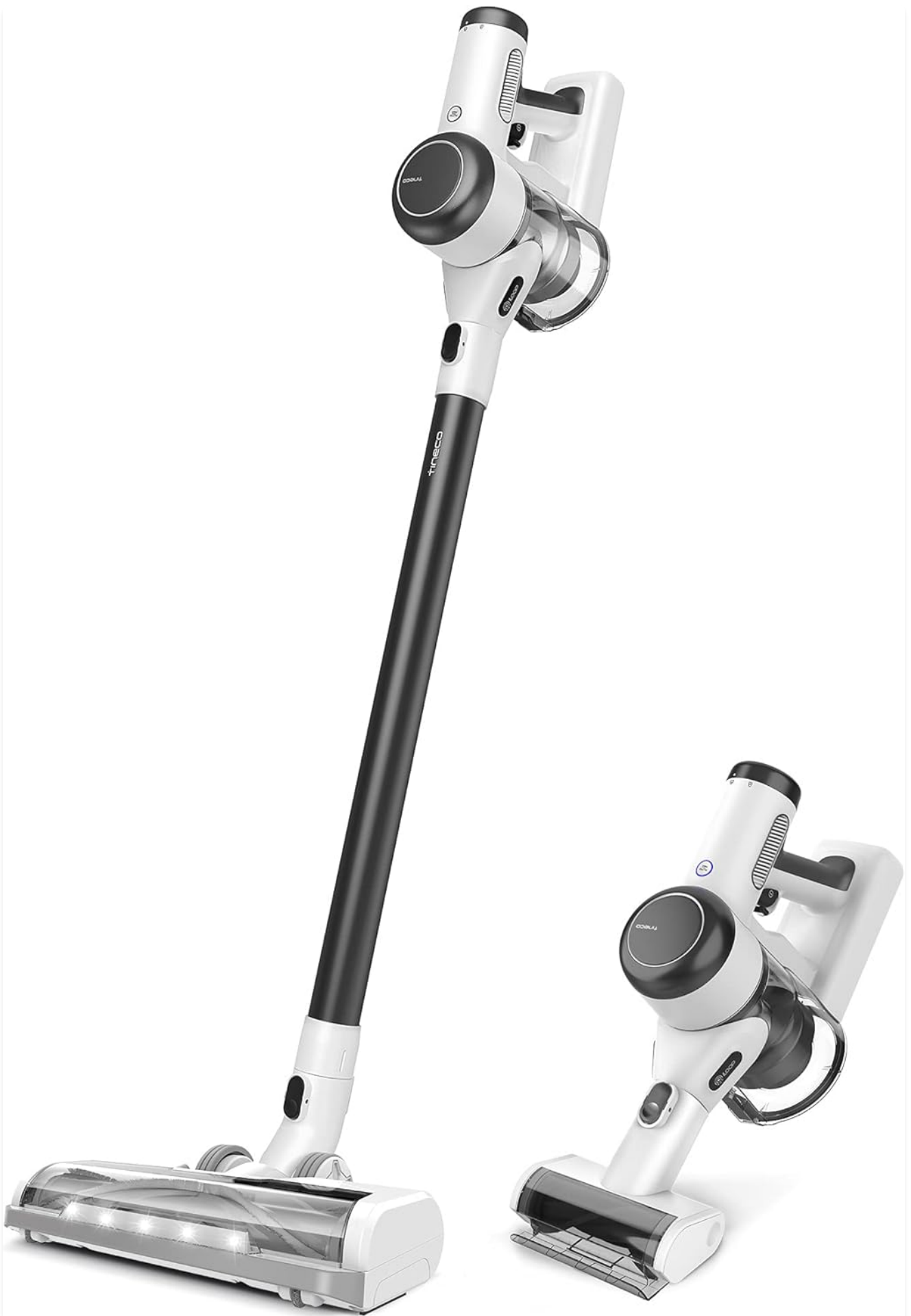
Image: The Tineco Pure ONE X Cordless Vacuum Cleaner shown in both its full stick vacuum configuration and as a compact handheld unit.