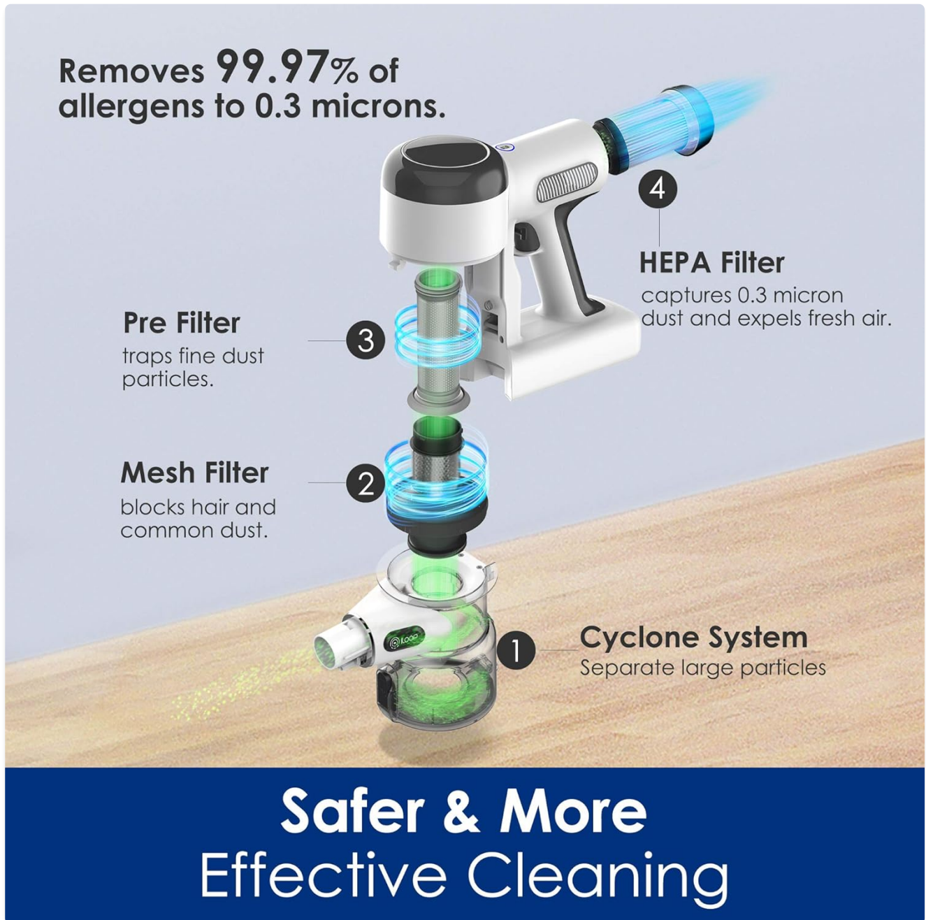
Image: A diagram illustrating the four stages of filtration in the Tineco Pure ONE X, including the cyclone system, mesh filter, pre-filter, and HEPA filter.

The Tineco Pure ONE X features a multi-stage filtration system, including a washable pre-filter and a HEPA filter, which captures 99.97% of allergens down to 0.3 microns. It is recommended to wash the pre-filter monthly and replace the HEPA filter every six months to ensure consistent performance.