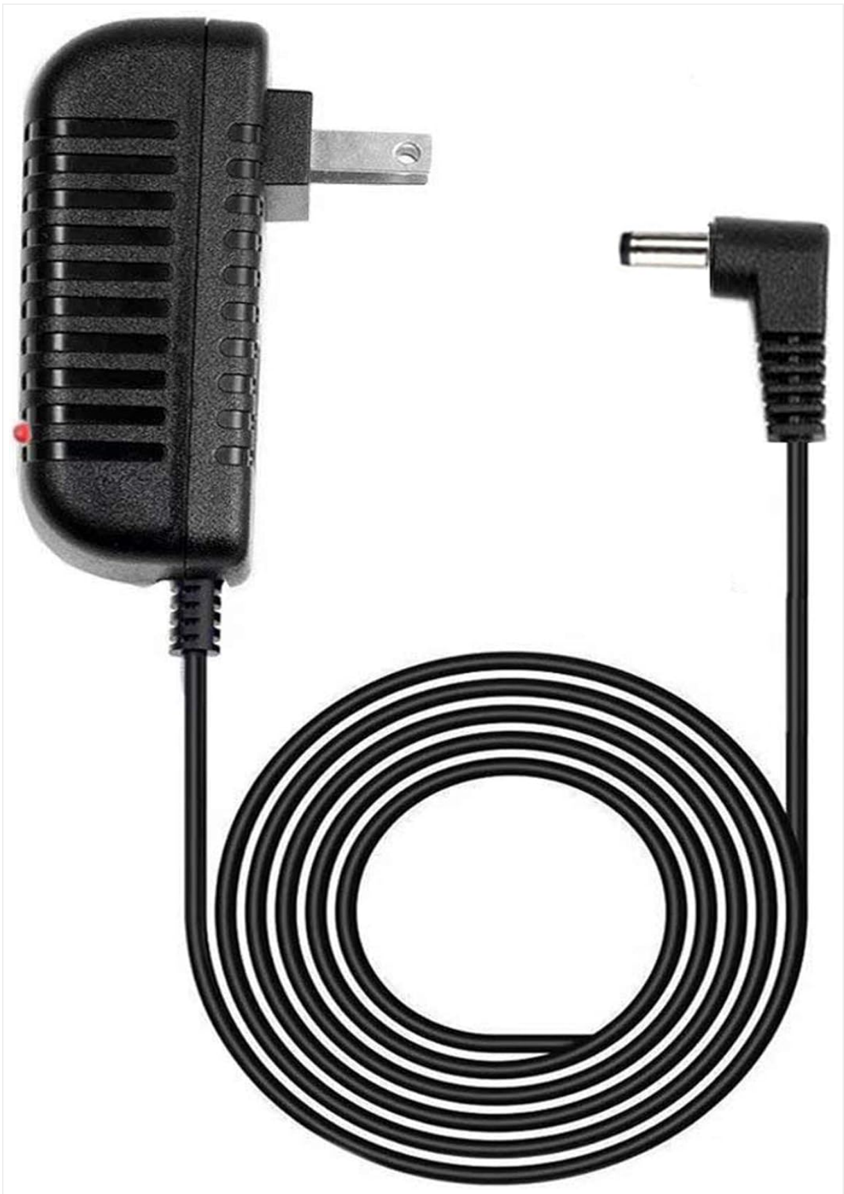
Figure 1: GUY-TECH AC Adapter. This image shows the power adapter unit with a standard US plug, connected to a coiled 5-foot cable ending in a barrel connector. A small red LED indicator is visible on the adapter unit.