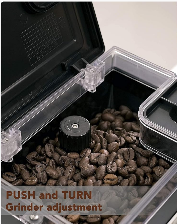
PUSH and TURN Grinder adjustment

Open the lid of the bean container located on top of the machine. Pour fresh coffee beans into the container. The integrated burr grinder allows for adjustable grind settings by pushing and turning the knob inside the bean container.