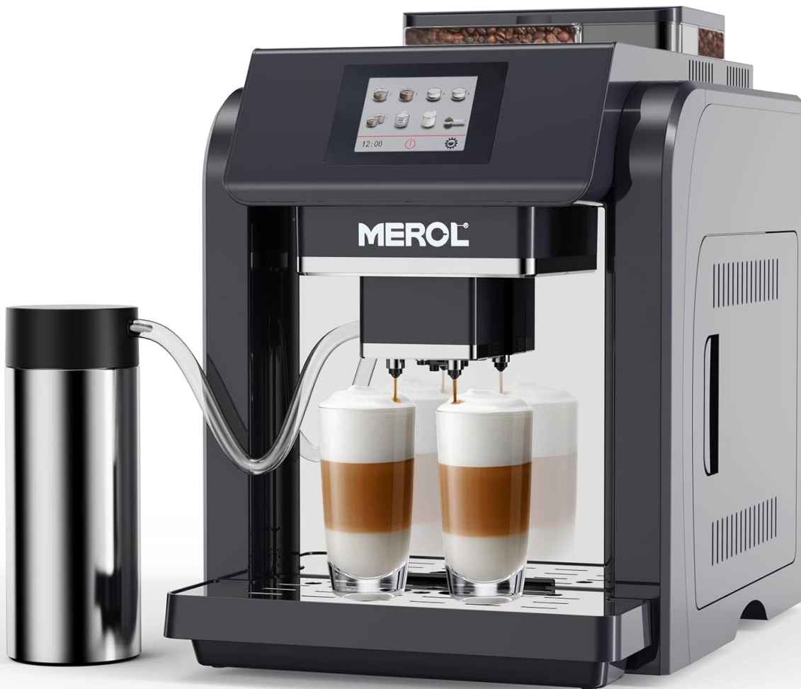
Image: The MEROL ME-712 machine in operation, dispensing two lattes into glasses, showcasing its sleek design and dual spout.