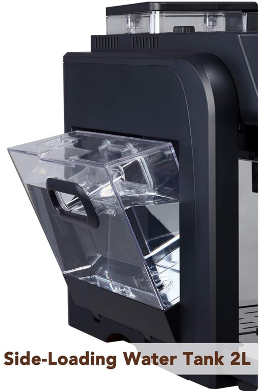
Side-Loading Water Tank 2L

Image: A clear view of the machine's removable brew group on the left and the easily accessible side-loading 2-liter water tank on the right, designed for user convenience.