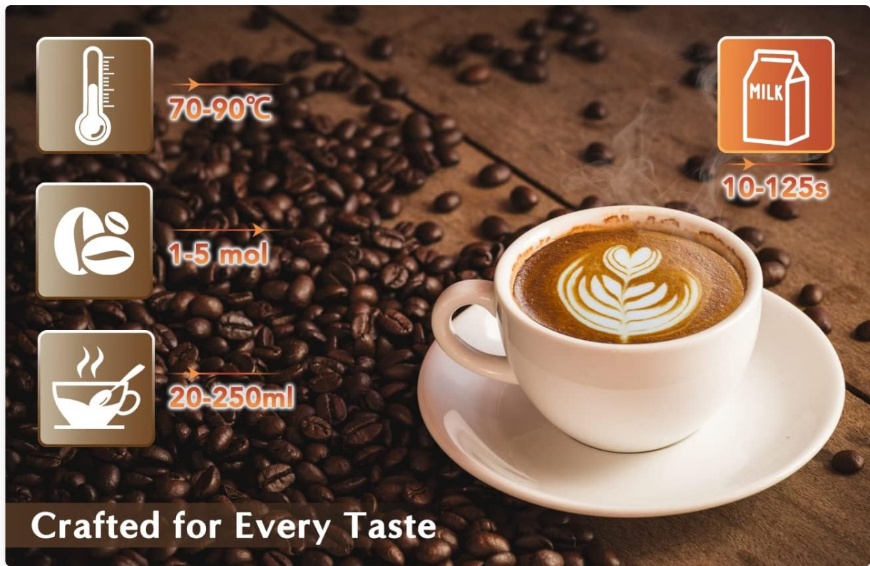
Image: A visual representation of the machine's customization capabilities, highlighting adjustable temperature (70-90°C), bean quantity (1-5 mol), and coffee volume (20-250ml) for a personalized coffee experience.