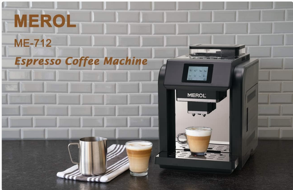
Image: The MEROL ME-712 Espresso Coffee Machine positioned on a kitchen counter, demonstrating its compact size and readiness for use, with a pre-warmed cup and milk frothing pitcher nearby.

For optimal coffee temperature and flavor, place your cups on the cup warming tray located on top of the machine before brewing.