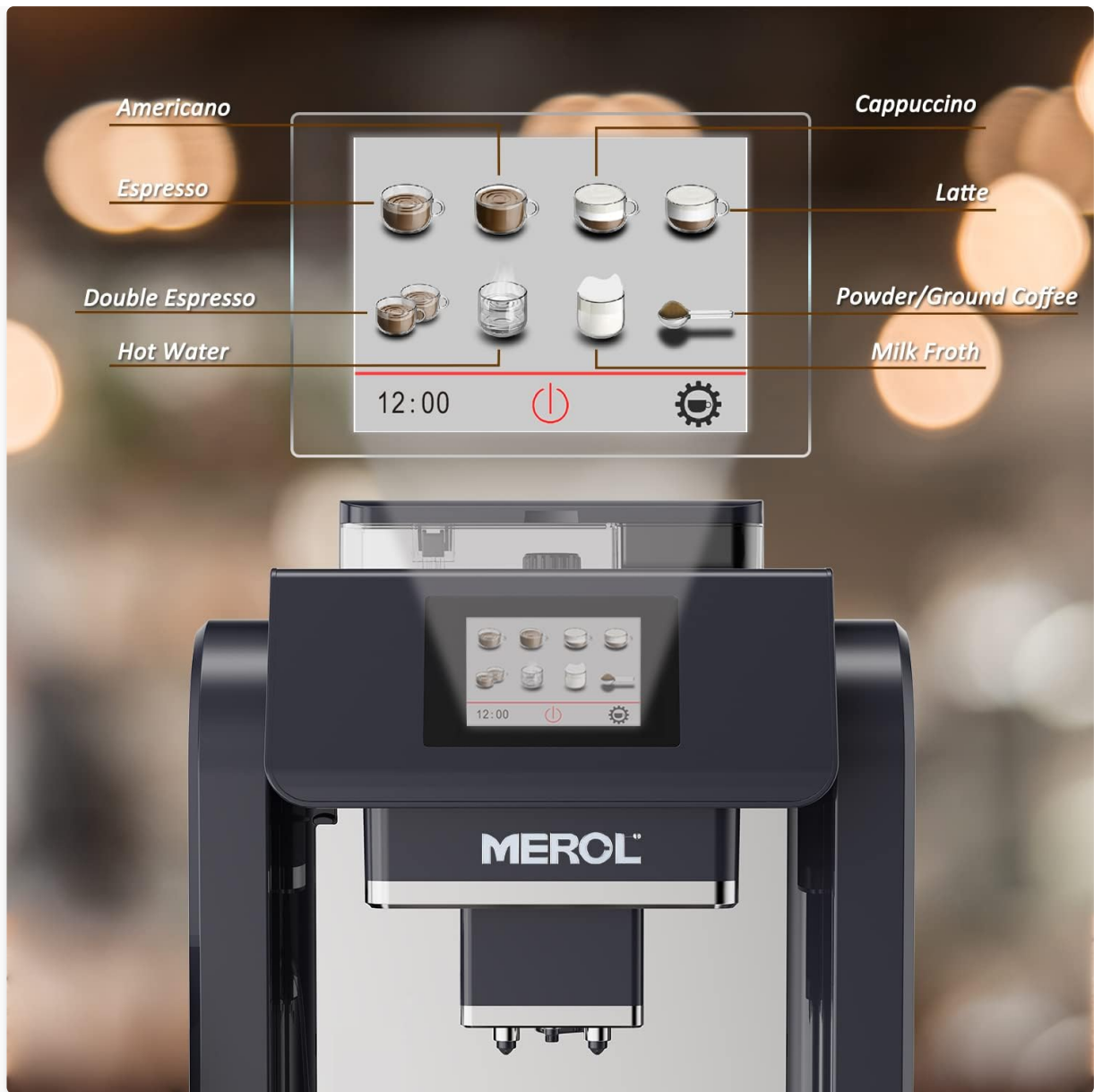
Image: The intuitive LCD control panel displaying various coffee drink selections, including Americano, Espresso, Double Espresso, Hot Water, Cappuccino, Latte, Powder/Ground Coffee, and Milk Froth.