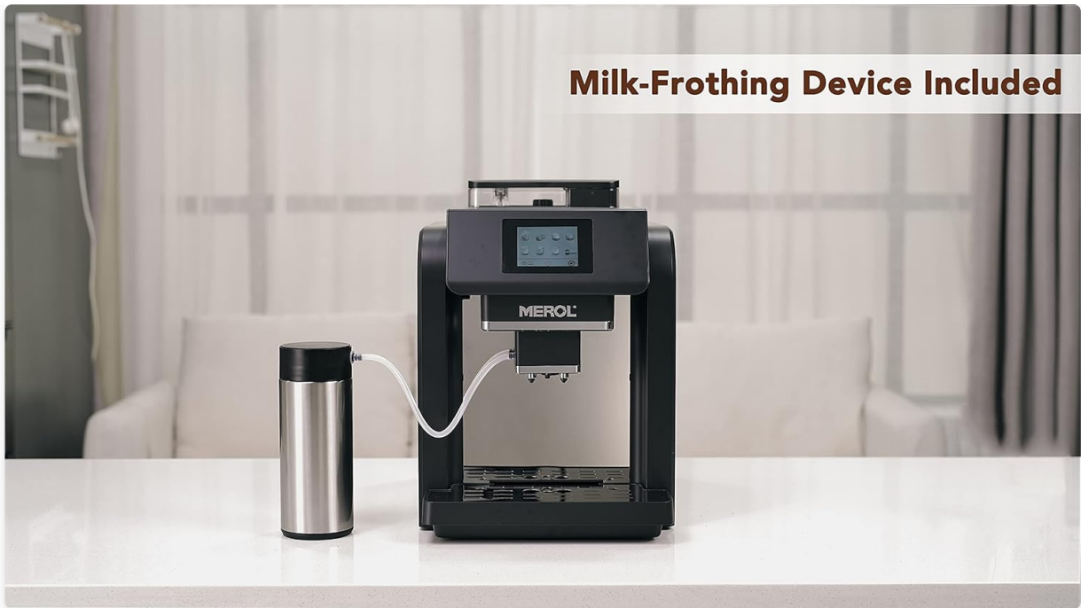
Image: The MEROL coffee machine with its external milk-frothing device connected, ready to create frothed milk for various beverages.