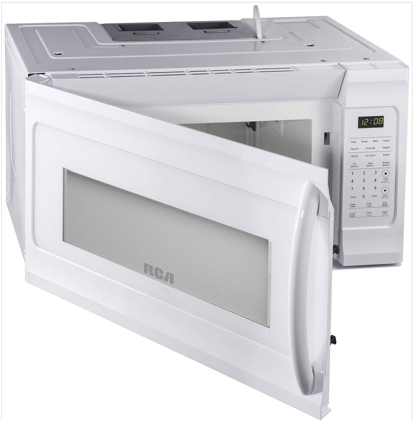
Figure 3: Close-up of the RCA RMW1630 control panel.