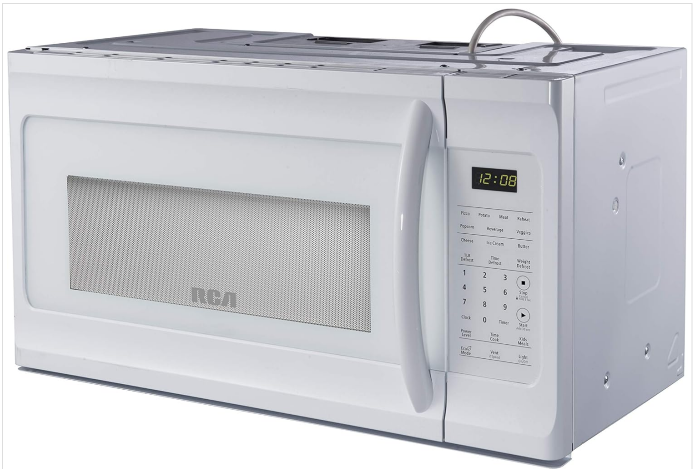
Figure 1: Front view of the RCA RMW1630 Countertop Microwave Oven.

This manual provides detailed instructions for the safe and efficient operation of your RCA RMW1630 Countertop Microwave Oven. This 1.6 cubic foot microwave oven is designed for convenient cooking, reheating, and defrosting. It features a user-friendly control panel and a durable stainless steel interior.