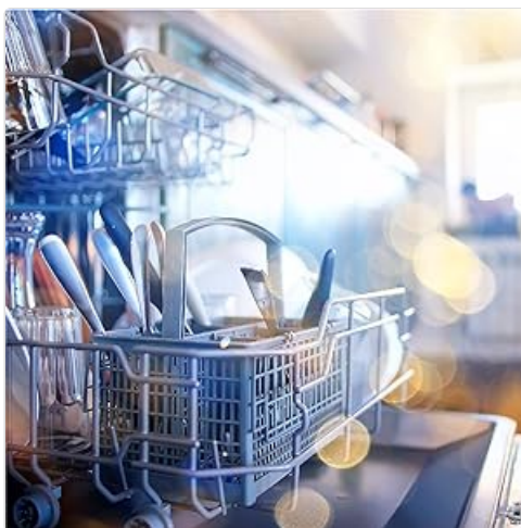
Figure 5.2: Silverware basket.