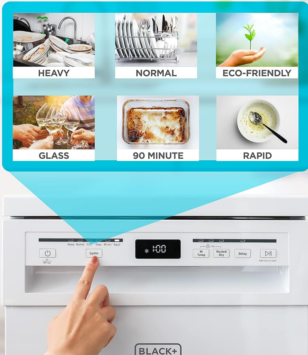
Figure 5.4: LED display and wash cycle selection.

Use the easy-to-read LED display and push buttons to select one of the 6 wash cycles: