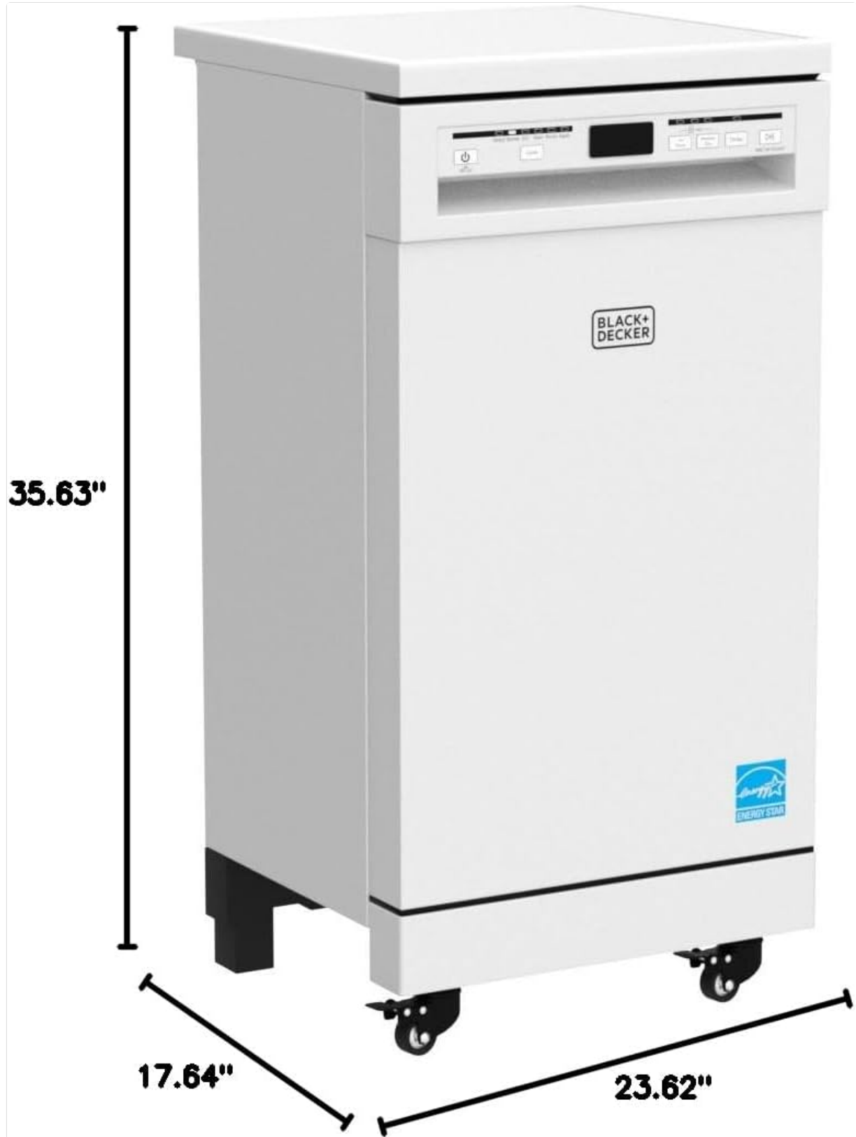
Figure 8.1: Product Dimensions.