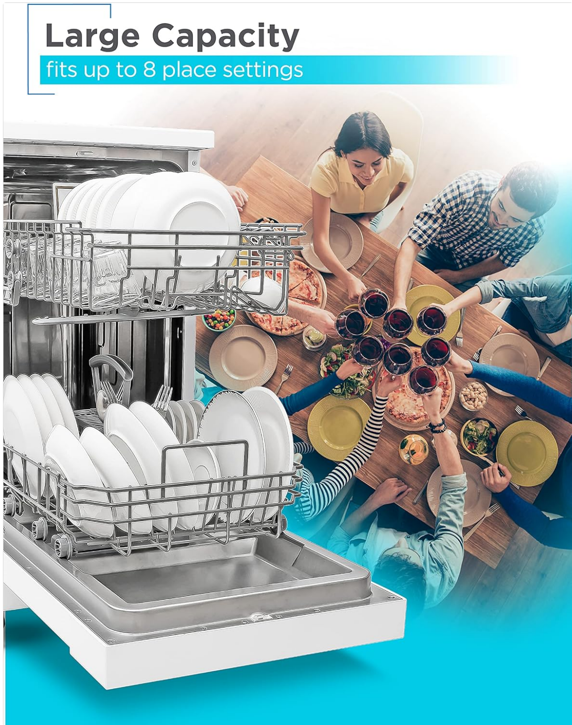
Figure 5.1: Dishwasher interior with loaded racks.

Load up to 8 place settings. Place larger items in the lower rack and smaller items, such as glasses and cups, in the upper rack. The top rack is adjustable to accommodate taller dishes. Utilize the included silverware basket for forks, knives, and spoons.