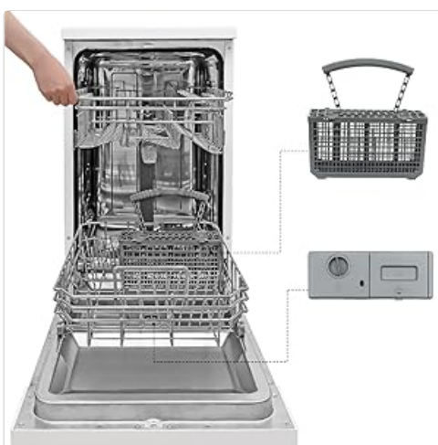
Figure 5.3: Detergent dispenser and rinse aid indicator.

Open the detergent dispenser and add the recommended amount of dishwasher detergent. Fill the rinse aid dispenser if needed; the low rinse aid indicator will alert you when it's low.