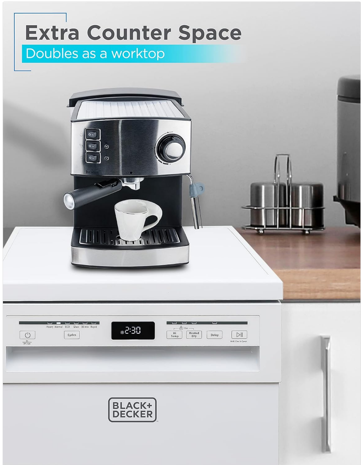
Figure 3.2: Dishwasher doubling as a worktop counter.