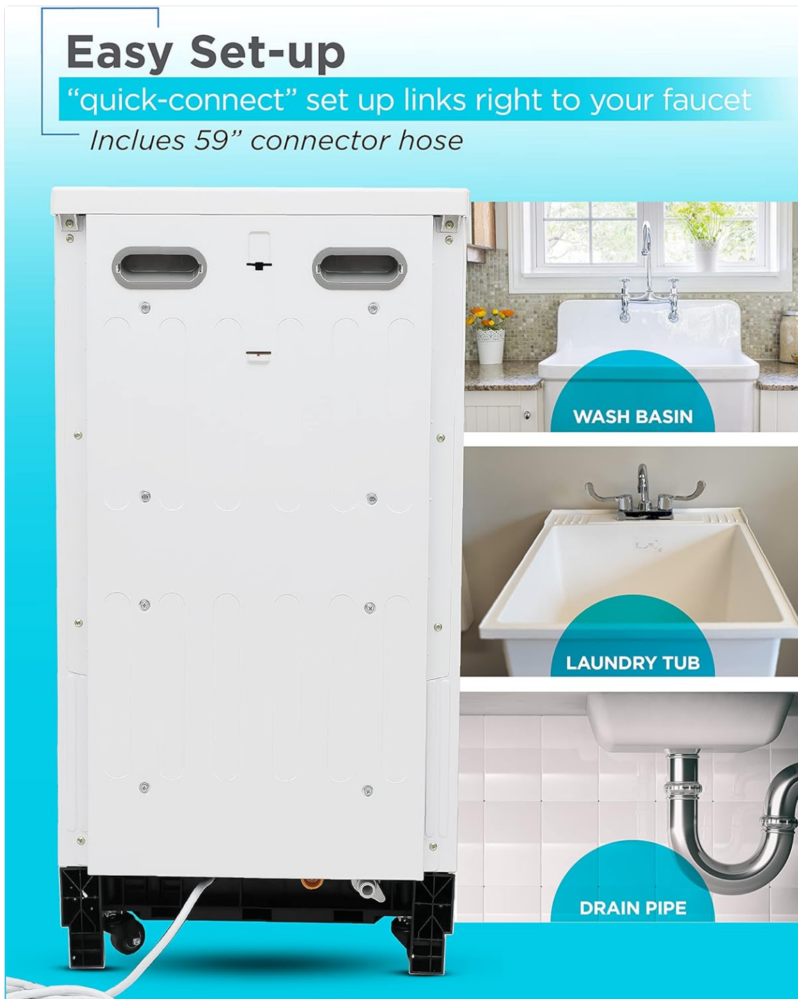
Figure 4.1: Quick-connect setup for faucet attachment.

The dishwasher uses a quick-connect assembly to link directly to your faucet. Attach the 59-inch hose to a compatible faucet. Ensure a secure connection to prevent leaks. No direct plumbing or permanent installation is required.