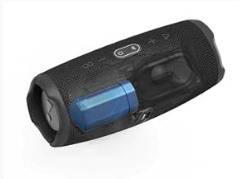
Image: Internal battery and power bank feature of the JBL Xtreme 3.