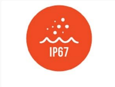
Image: IP67 rating for waterproof and dustproof capabilities.

Video: A user demonstrates the JBL Xtreme 3, highlighting its powerful sound, portability with the strap, and waterproof design.