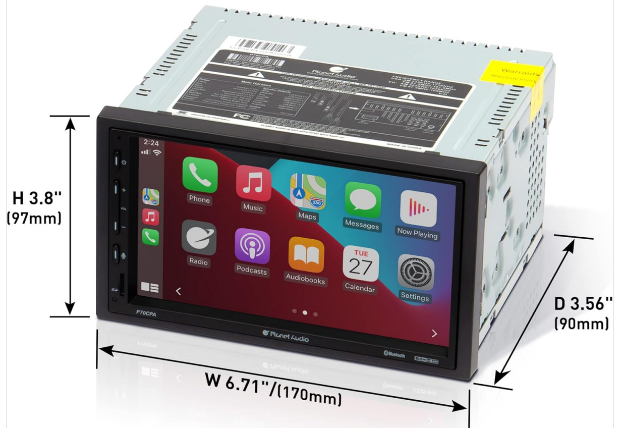
Image: Diagram showing the dimensions of the P70CPA-C head unit: Height 3.8 inches (97mm), Width 6.71 inches (170mm), Depth 3.56 inches (90mm).