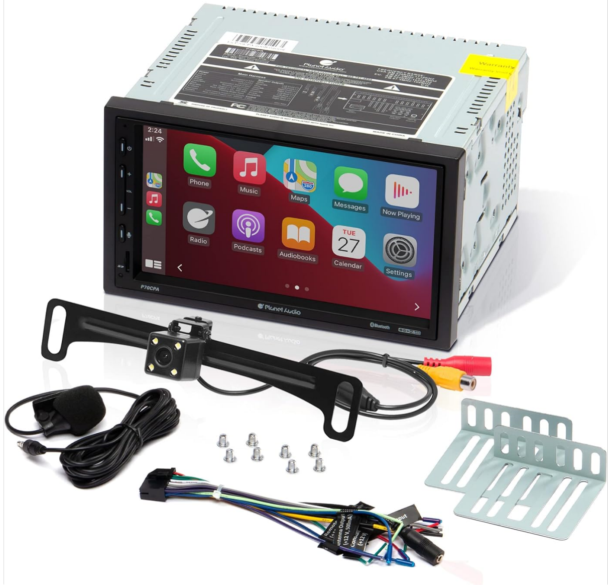
Image: Planet Audio P70CPA-C head unit with all included accessories, such as the backup camera, wiring harness, and mounting brackets.