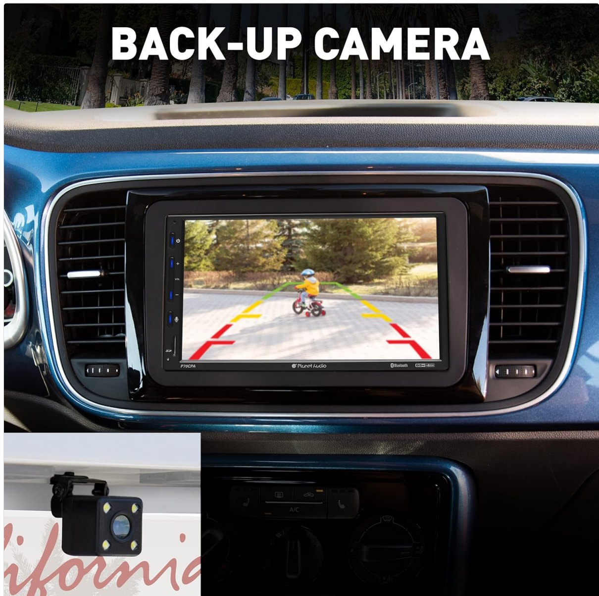
Image: The P70CPA-C display showing the live feed from the backup camera, including parking guidelines, within a vehicle dashboard.

The included backup camera should be mounted at the rear of your vehicle, typically near the license plate. Connect its video output to the unit's rear camera input and its power to the vehicle's reverse light circuit so it activates automatically when reversing.