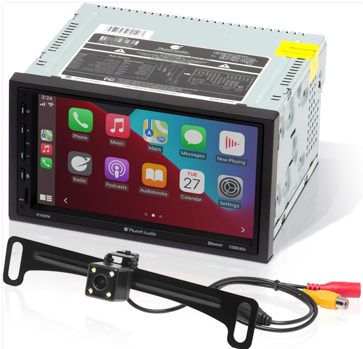
Image: The Planet Audio P70CPA-C head unit displaying the Apple CarPlay interface, accompanied by the included backup camera.