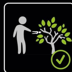
Image: The Fiskars P961 pruners held in a hand, demonstrating the maximum cutting capacity of 26mm for fresh branches.