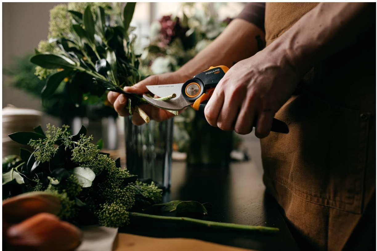
Image: A person uses the Fiskars P961 pruners to carefully trim the stems of flowering plants in a garden.