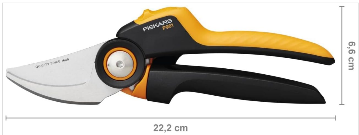
Image: A close-up view of the Fiskars P961 pruners, highlighting the PowerGear mechanism and the non-stick coated blades.