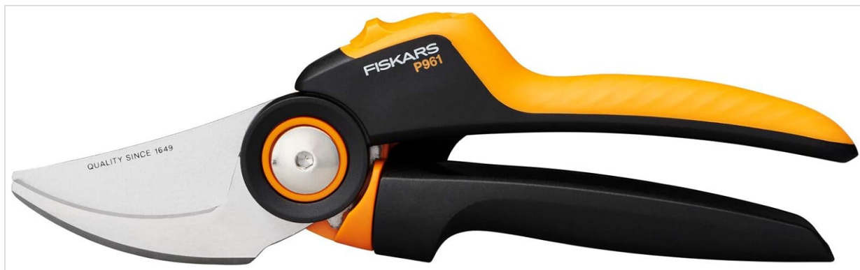
Image: The Fiskars X-Series PowerGear P961 Bypass Garden Pruners, featuring black and orange handles and stainless steel blades.

This manual provides essential information for the safe and effective use, maintenance, and care of your Fiskars X-Series PowerGear P961 Bypass Garden Pruners. Designed for effortless cutting of fresh branches and twigs, these pruners feature advanced PowerGear technology and an ergonomic rolling handle for enhanced comfort and performance. Please read this manual thoroughly before first use and retain it for future reference.