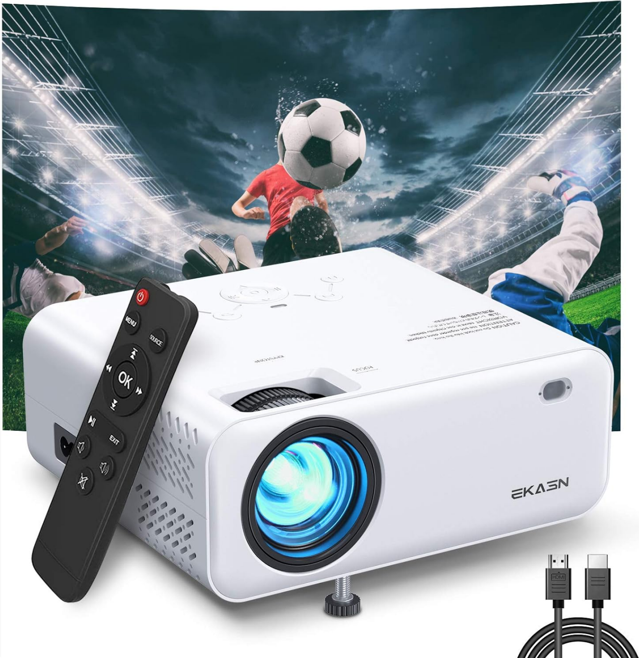
Image: The EKASN Creative E450 Mini Projector, showcasing its compact design, front lens, and included remote control and connection cables.