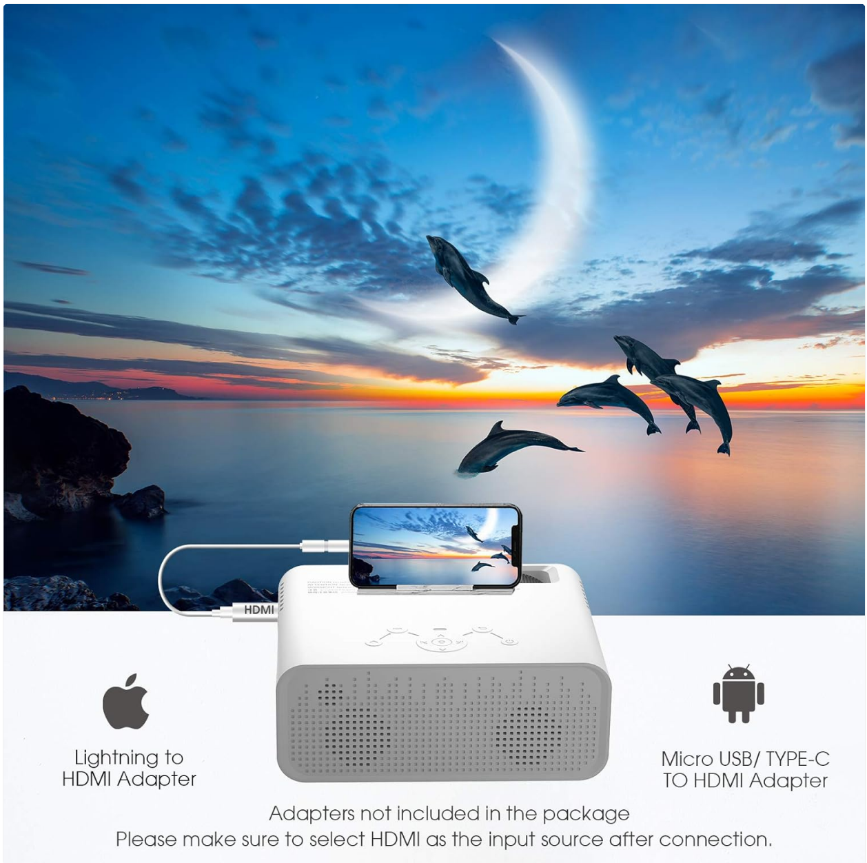
Image: A visual guide demonstrating how to connect an iPhone (via Lightning to HDMI adapter) and an Android phone (via Micro USB/Type C to HDMI adapter) to the EKASN Creative E450 Mini Projector. Adapters are not included.