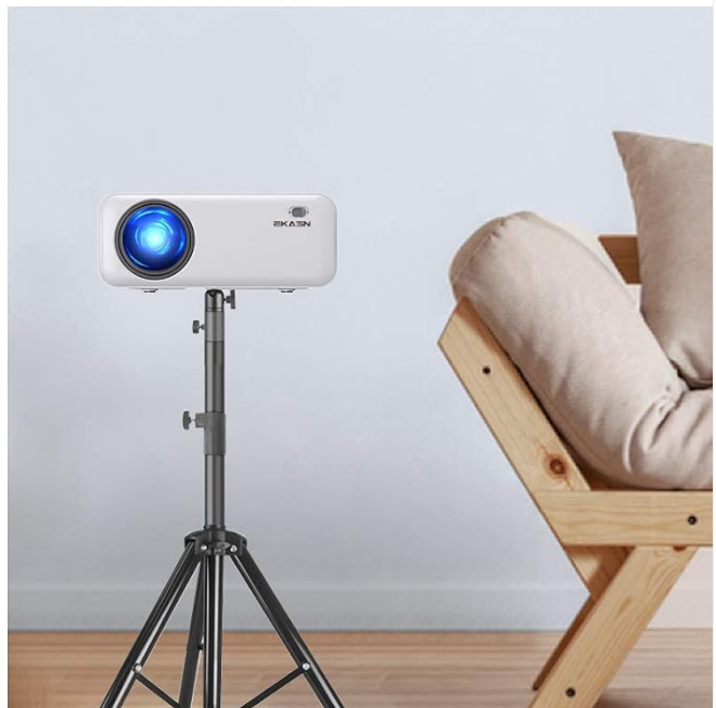
Image: Three examples of installation methods for the EKAEN Creative E450 Mini Projector: tabletop placement, ceiling mount, and tripod mount.