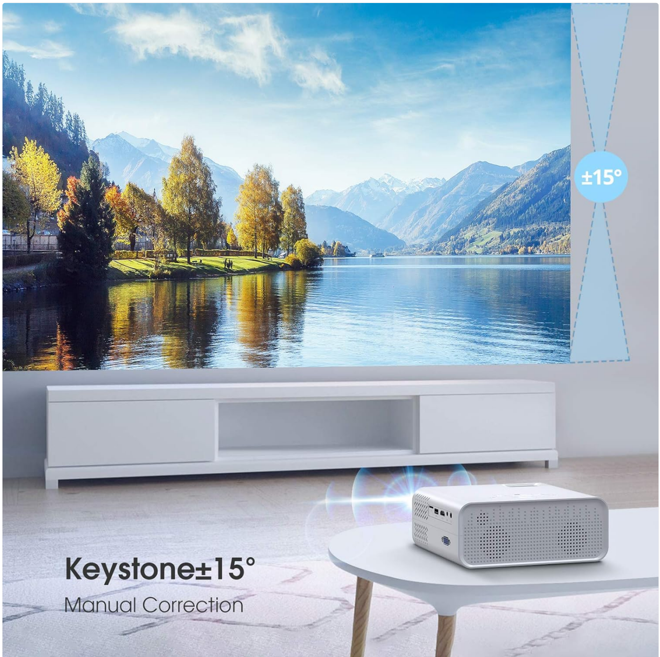
Image: A visual representation of keystone correction, showing how the projected image can be adjusted by \pm 15 degrees to achieve a perfectly rectangular display.