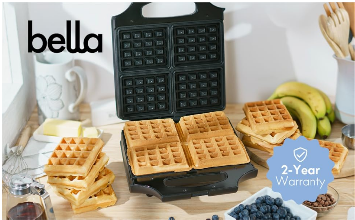
Image 11.1: BELLA Waffle Maker with an indication of a 2-Year Warranty.