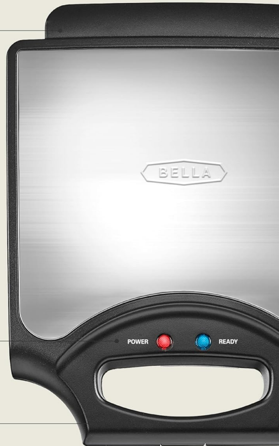
Image 3.1: Top view of the waffle maker, indicating the Power and Ready lights and the anti-scald handle.