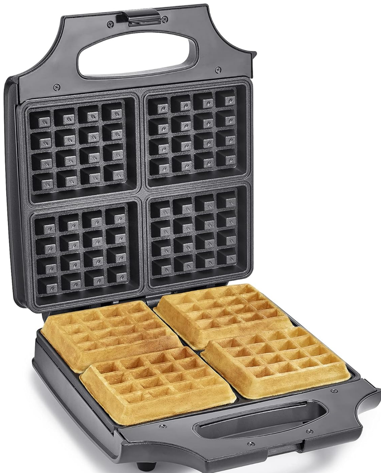
Image 6.2: Four cooked Belgian waffles ready for removal from the waffle maker.