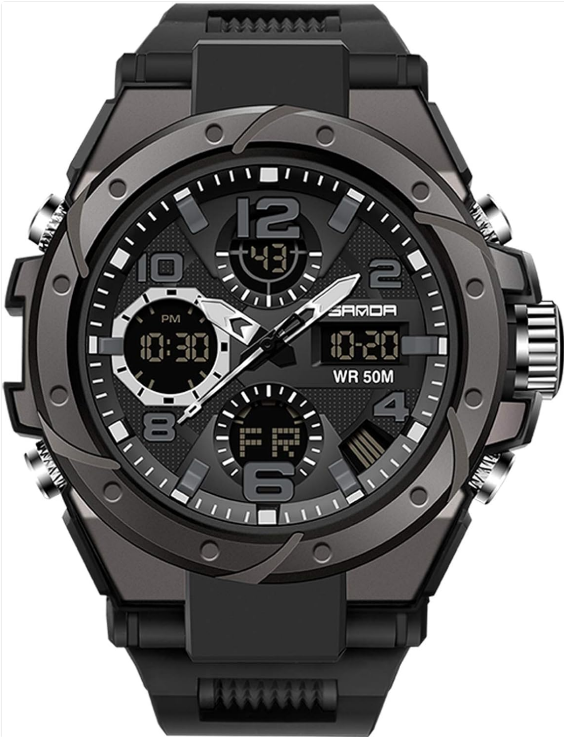
Figure 1: RORIOS AA-MJ006 Military Sport Watch, front view. This image shows the watch's black case, digital and analog displays, and multiple function buttons.