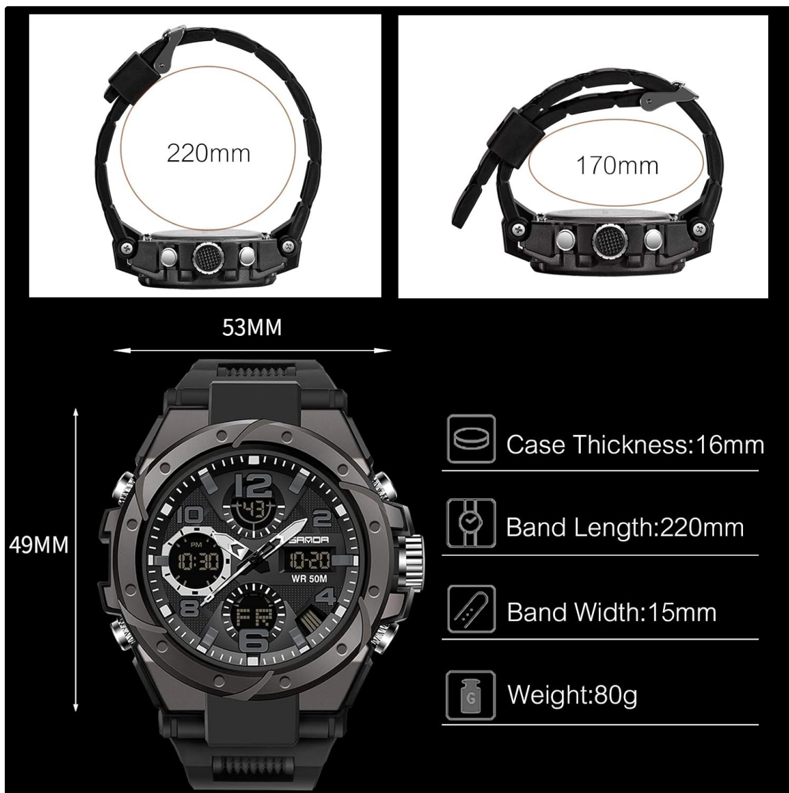
Figure 5: Dimensions of the RORIOS AA-MJ006 Military Sport Watch. This diagram details the case thickness (16mm), band length (220mm), band width (15mm), case diameter (49mm), and overall weight (80g).

The following are the general specifications for the RORIOS AA-MJ006 Military Sport Watch: