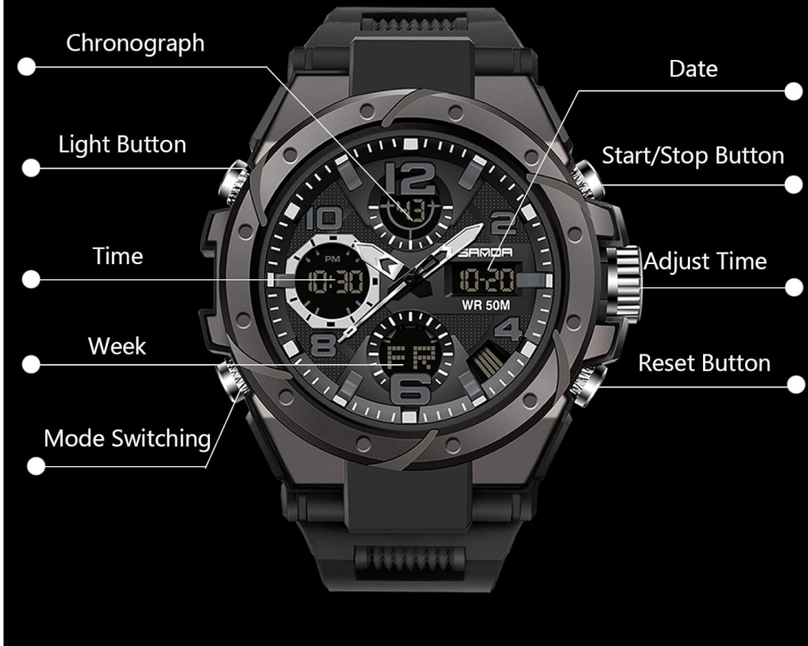
Figure 2: Annotated diagram of RORIOS AA-MJ006 watch functions and buttons. This diagram highlights the locations of the light button, mode switching button, time display, week display, chronograph, date display, start/stop button, adjust time button, and reset button.