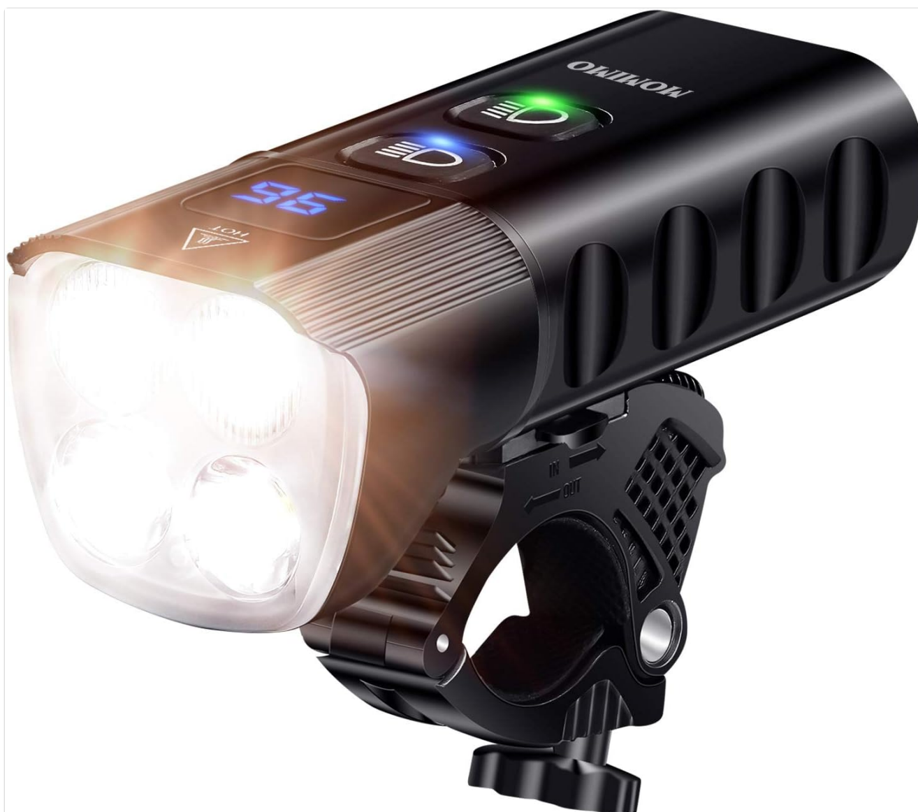
Image: A detailed view of the MOMIMO Bike Light, highlighting the control buttons and the clear digital display that shows the battery charge level.