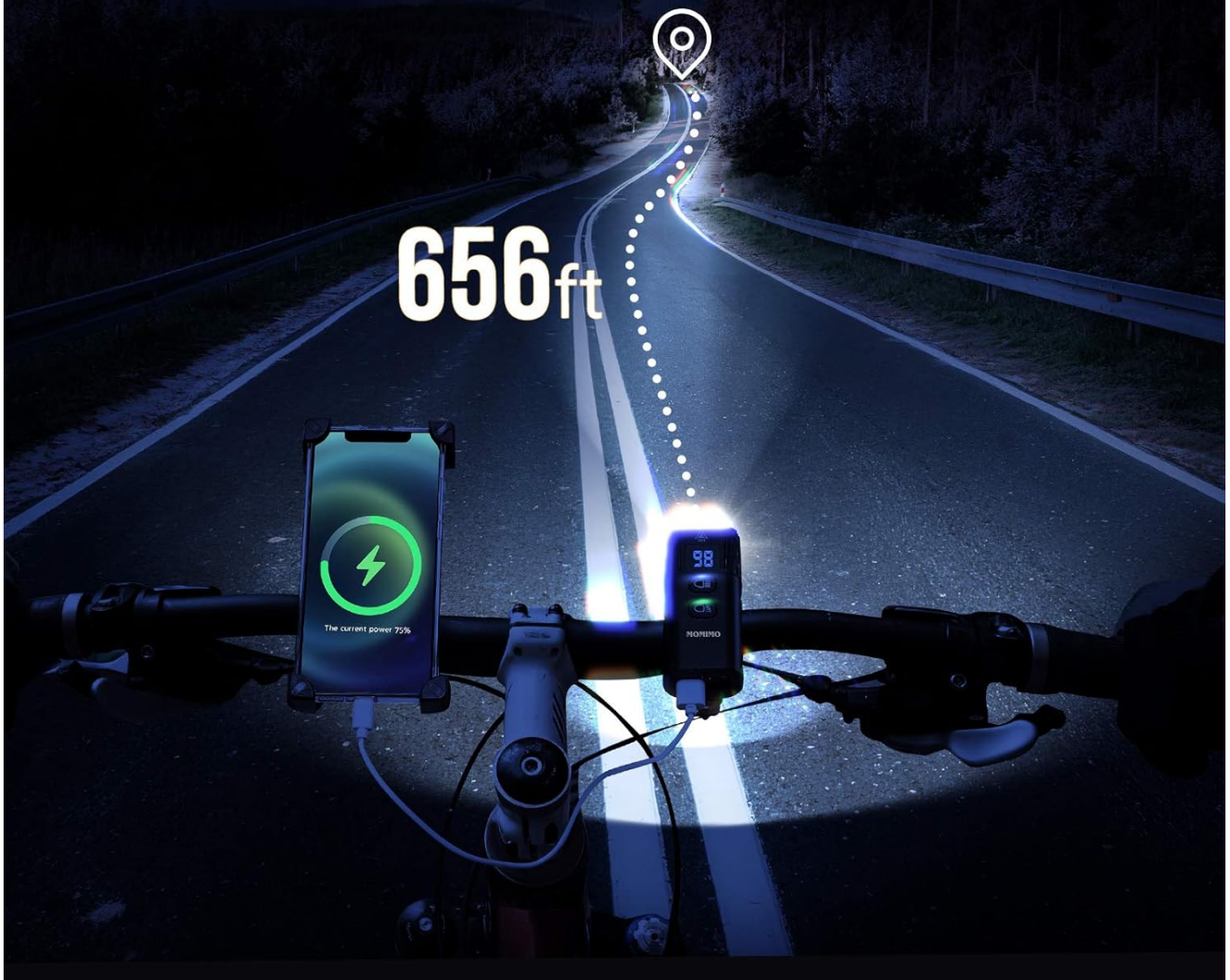
Image: The MOMIMO Bike Light actively charging a smartphone, demonstrating its power bank functionality while mounted on a bicycle.