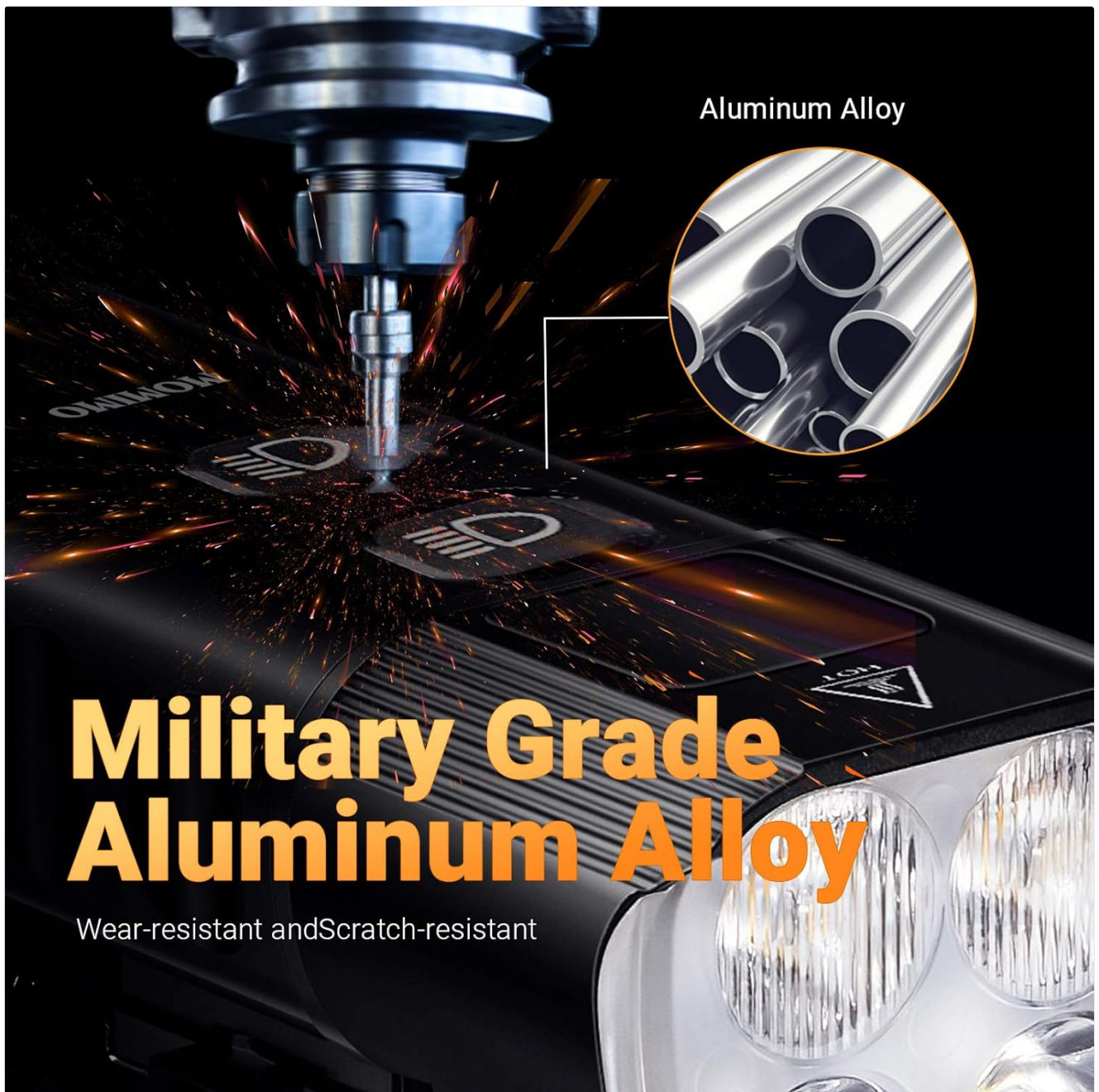
Image: A detailed view emphasizing the robust military-grade aluminum alloy material used in the construction of the MOMIMO Bike Light, ensuring durability.