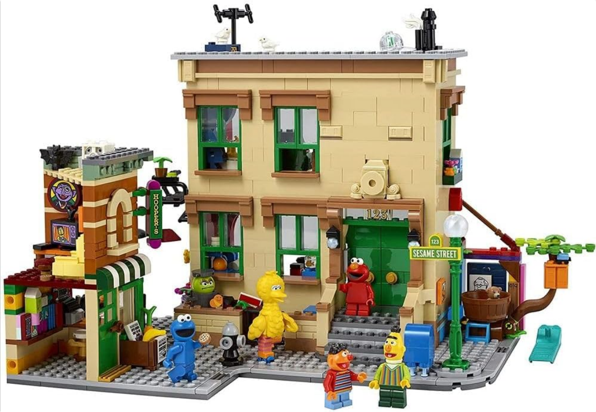
Image: The fully assembled LEGO Ideas 123 Sesame Street set, showcasing the detailed building and street corner with various characters.