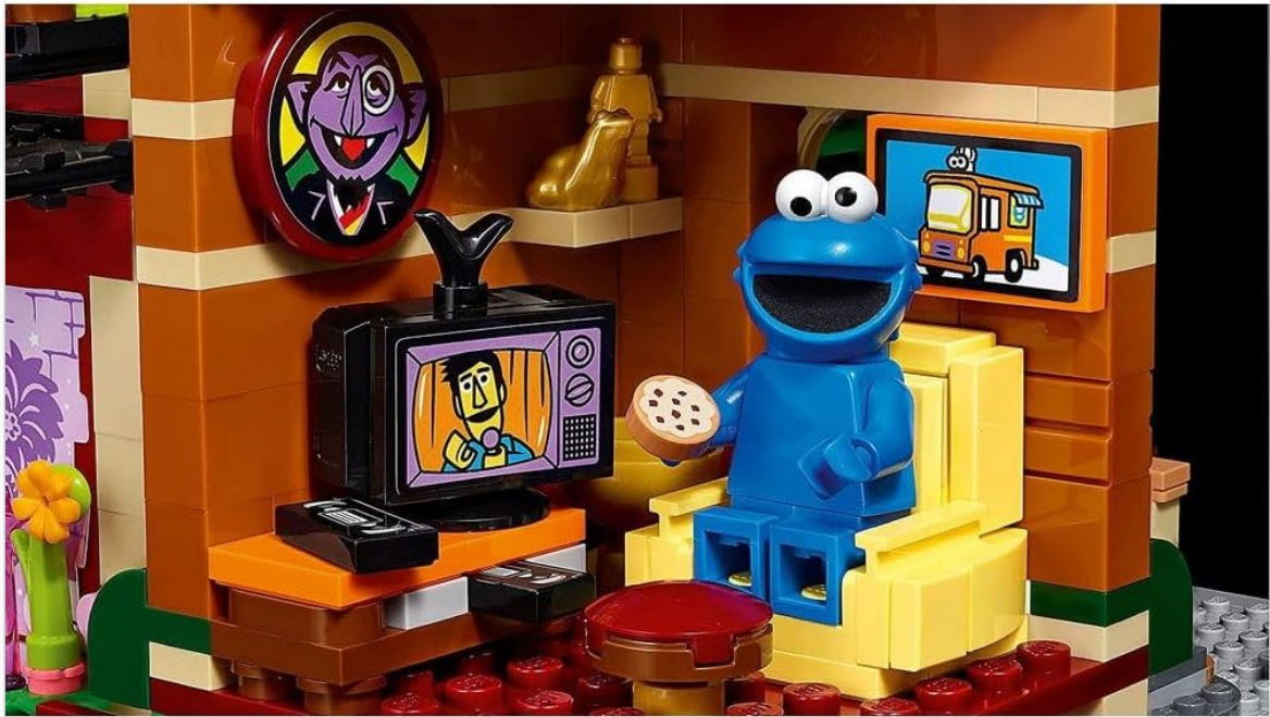
Image: A close-up view of an interior section of the LEGO 123 Sesame Street set, showing Cookie Monster on a couch with a television and a picture of Count von Count.