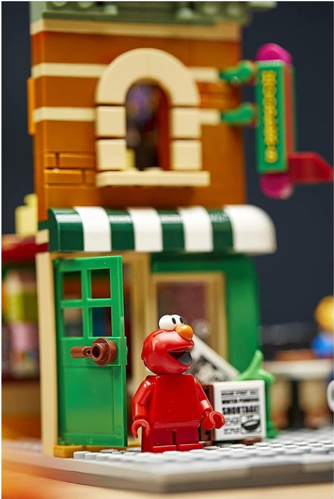
Image: Elmo minifigure standing outside Hooper's Store on the LEGO 123 Sesame Street set, with detailed storefront elements.