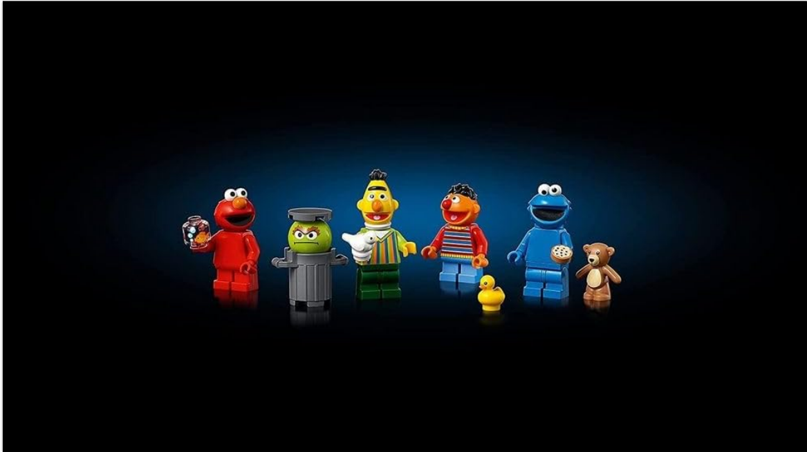
Image: A collection of LEGO minifigures and figures from the 123 Sesame Street set, including Elmo, Cookie Monster, Bert, Ernie, Oscar the Grouch, and Big Bird.