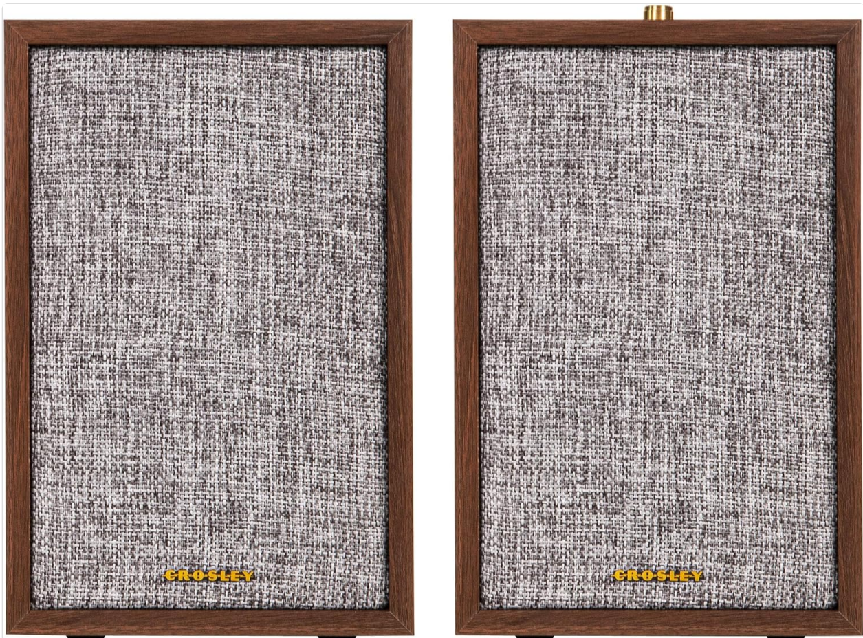
Image 3.1: Front view of the two Crosley S200A-WA speakers. Both speakers feature a 4-inch woofer and a 1-inch soft dome tweeter behind a protective fabric grille.