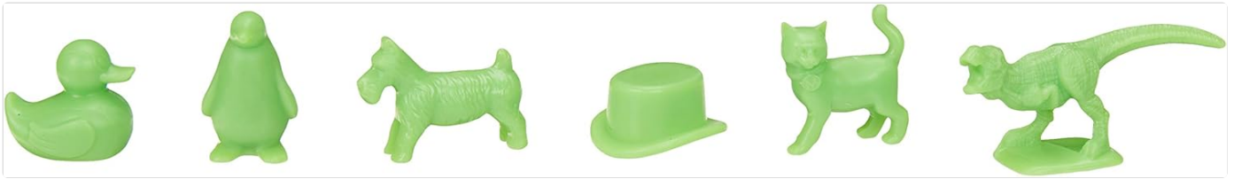
Image: A close-up of the six light green, plant-based plastic tokens used in Monopoly: Go Green Edition. The tokens include a duck, a penguin, a Scottie dog, a top hat, a cat, and a Tyrannosaurus Rex.