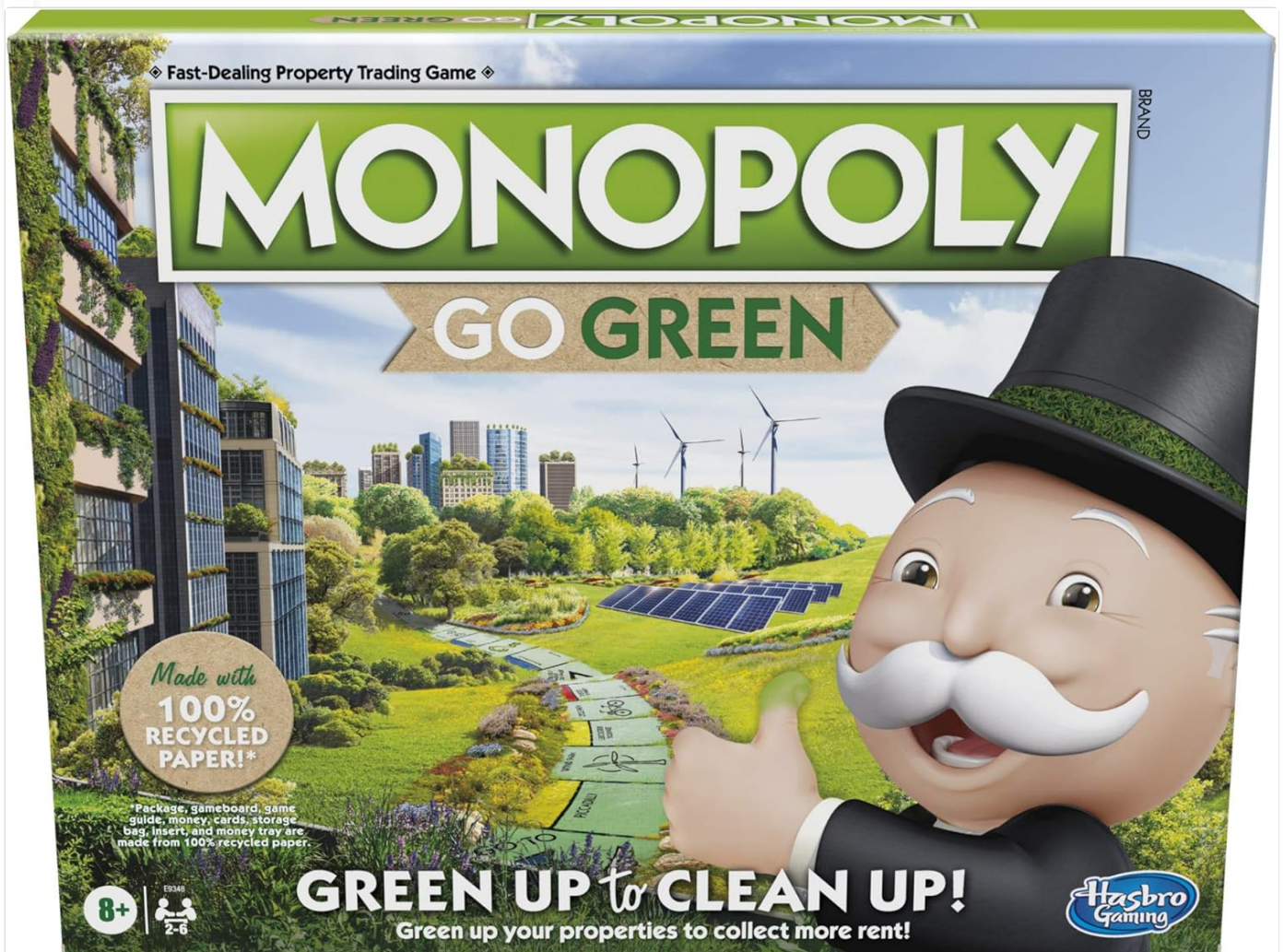
Image: The front of the Monopoly: Go Green Edition board game box, featuring Mr. Monopoly giving a thumbs-up in a green, eco-friendly landscape with solar panels and wind turbines.