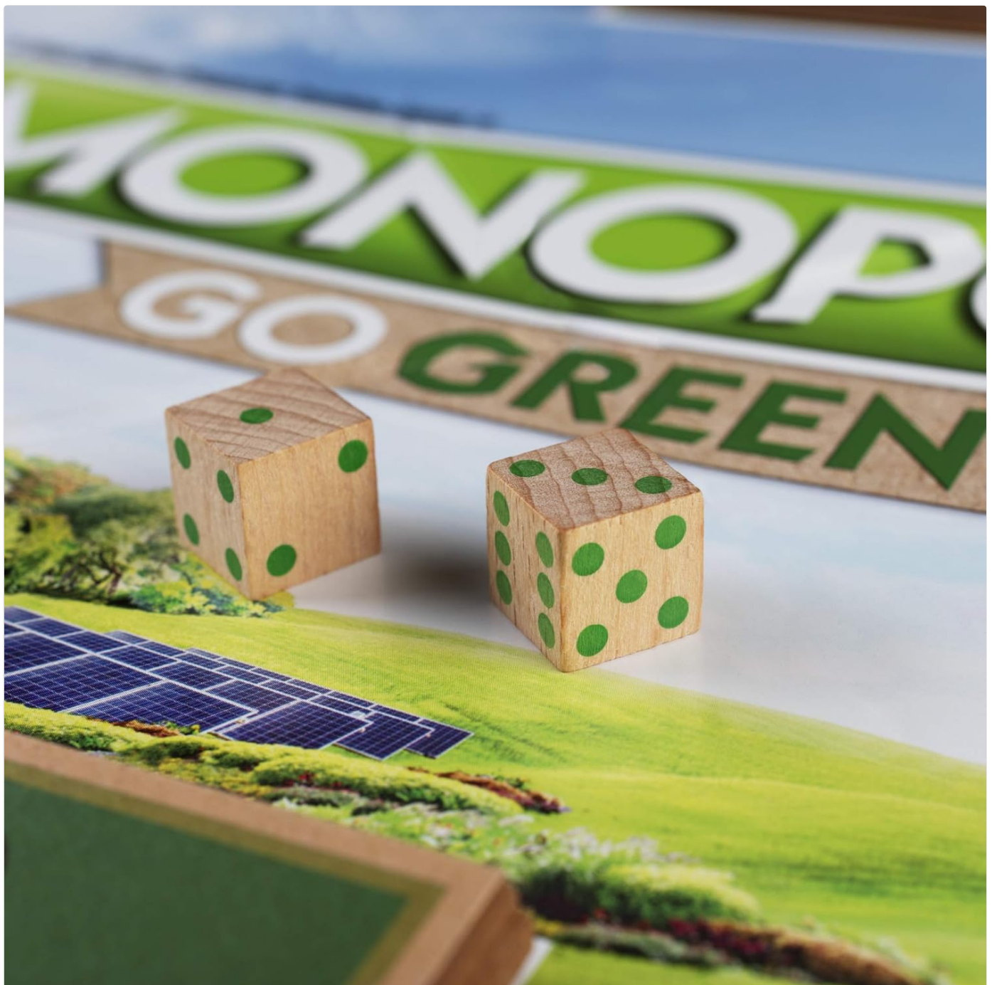
Image: A close-up of two light-colored wooden dice with green pips, used in the Monopoly: Go Green Edition game. The dice are resting on the game board, near a solar panel illustration.