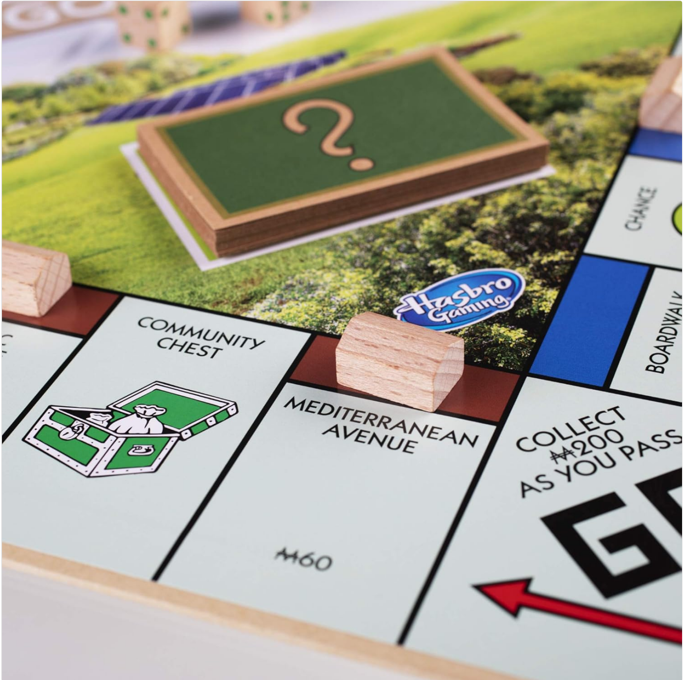
Image: A close-up view of a wooden greenhouse piece placed on the Mediterranean Avenue property space on the Monopoly: Go Green Edition game board. A stack of Community Chest cards is visible in the background.