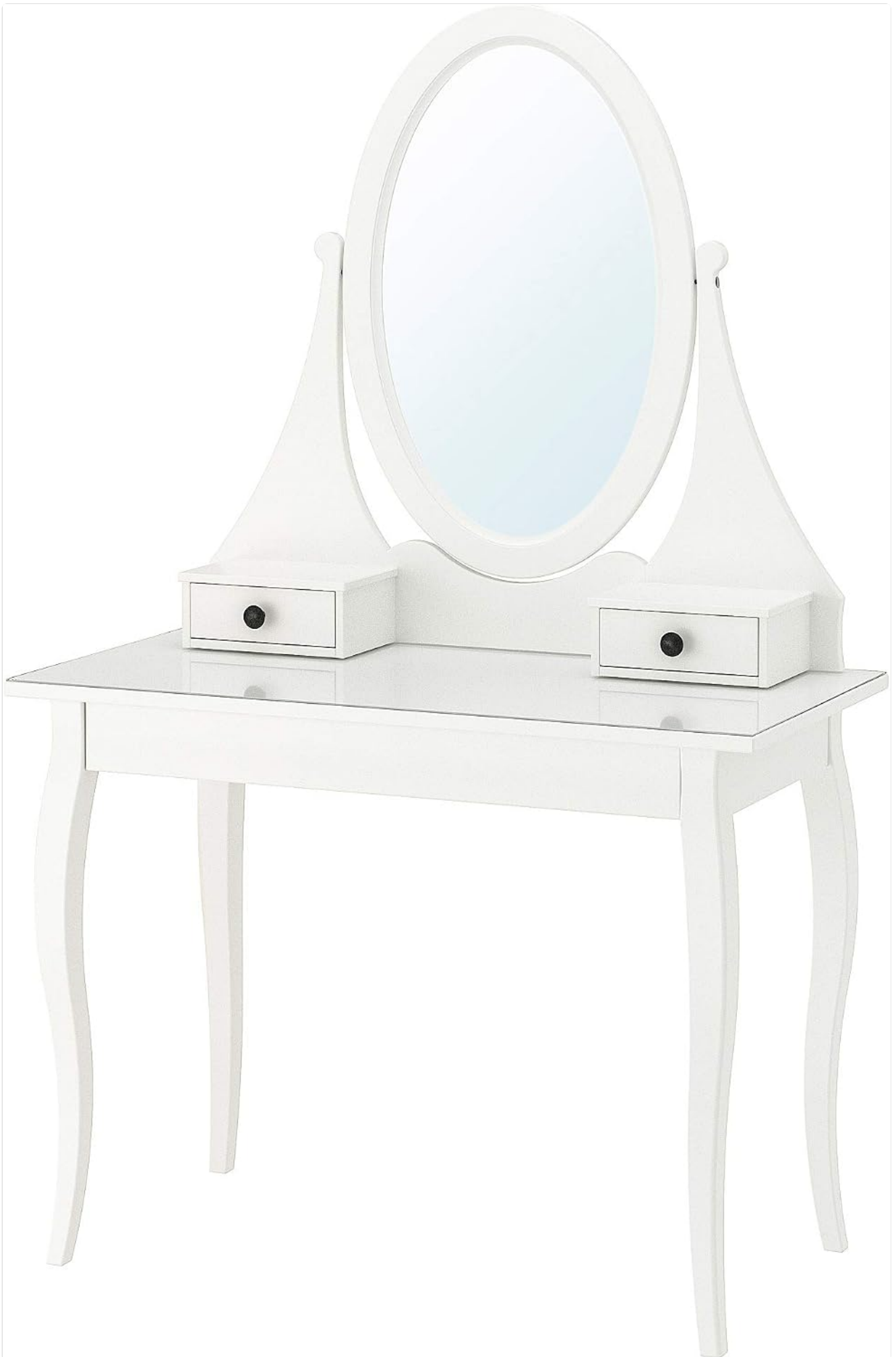
Front view of the HEMNES Dressing Table with Mirror, showcasing its classic white design and oval mirror.