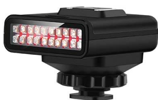
IR Night Light