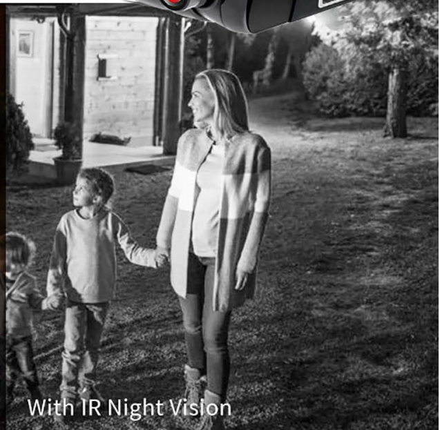
With IR Night Vision

This image demonstrates the effectiveness of the camcorder's IR Night Vision feature, comparing a dark scene without infrared illumination to the same scene clearly visible in black and white with IR Night Vision activated.