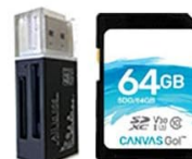
64GB SD Card

An overview of all items included in the product package: the ORDRO HDR-AC3 camcorder, an external IR Night Light, Lens Hood, Remote Control, Handheld Holder, USB to MIC adapter, HDMI Cable, USB Cable, Lens Cap, Camera Bag, Battery Charger, two Lithium Polymer Batteries, and a 64GB SD Card.