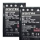
Battery x 2