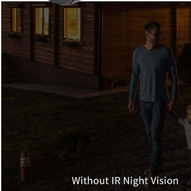
Without IR Night Vision