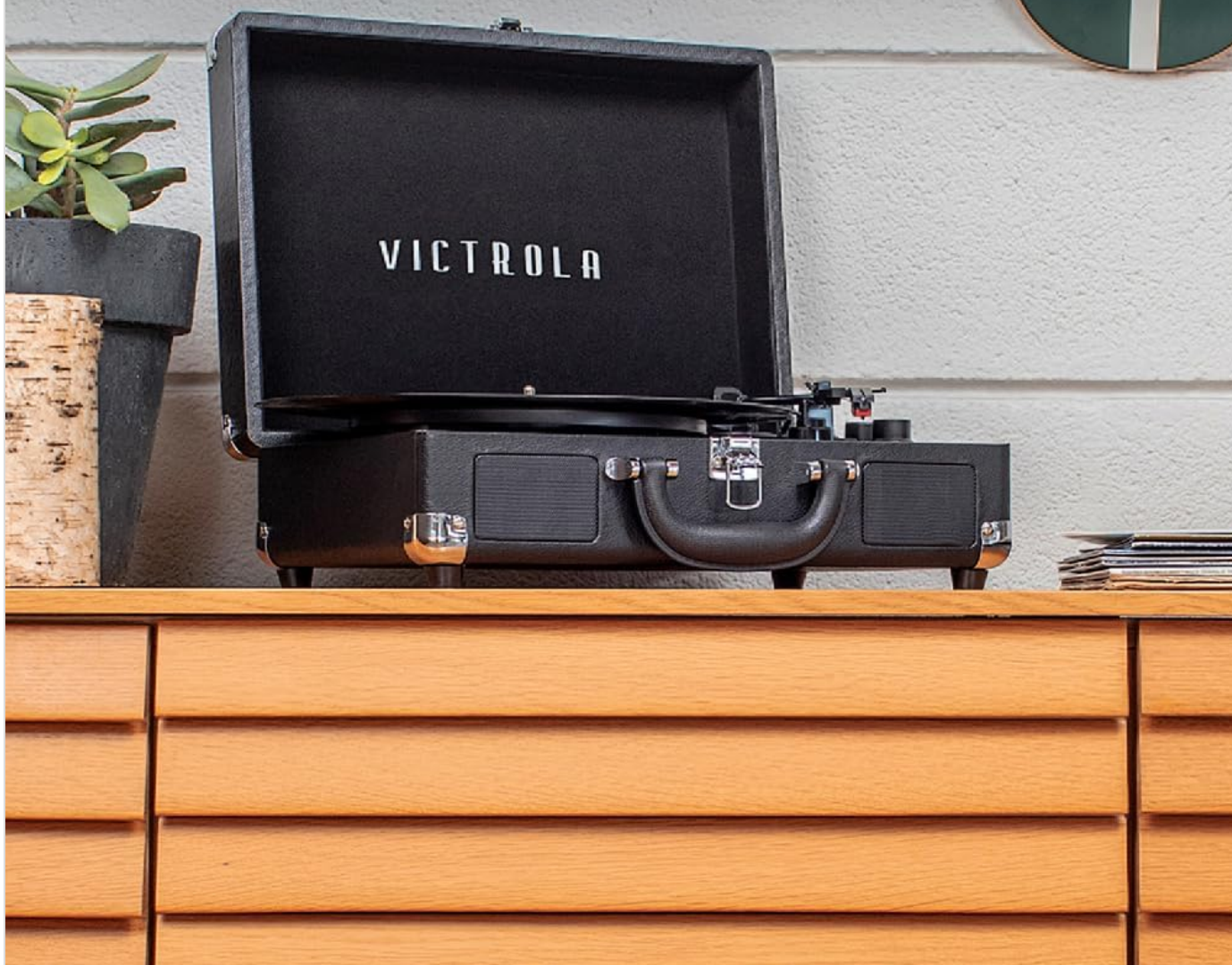
Image: Bluetooth connectivity for wireless music streaming.

ENJOY WIRELESS MUSIC FROM UP TO 33 FEET AWAY. WITH CRISP, CLEAR SOUND.