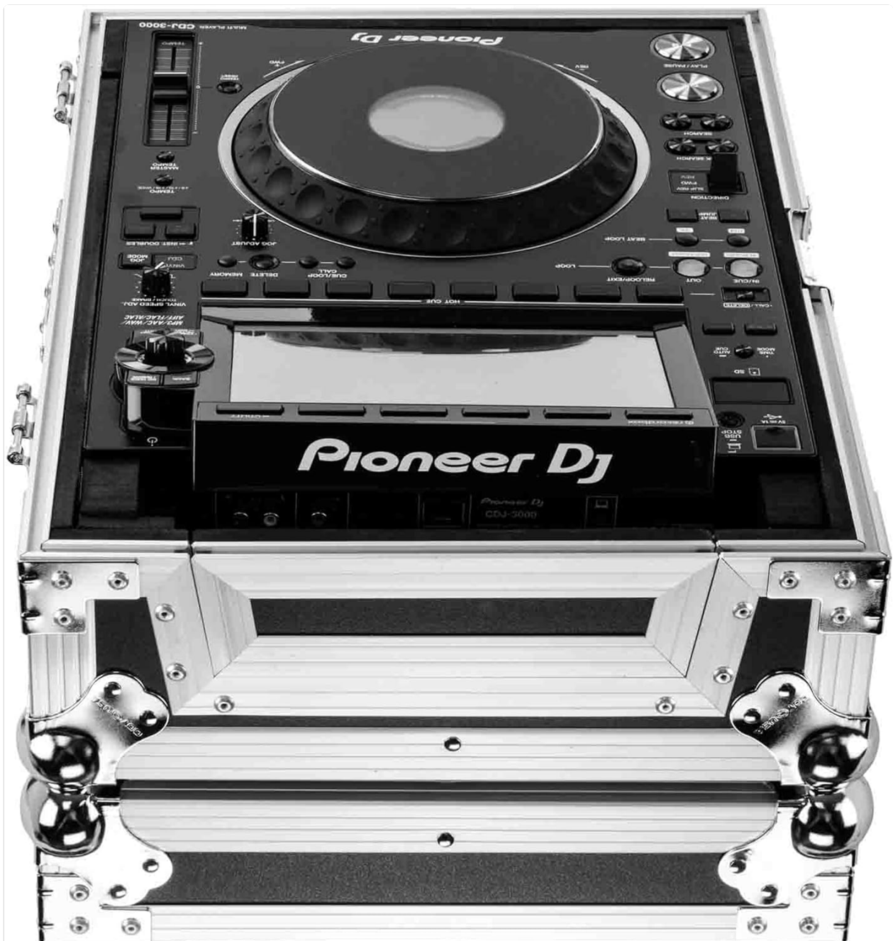
Image 3.1: Front view of the Odyssey FZ3000 flight case with a Pioneer DJ CDJ-3000 inside, showing the removable V-cut panel in place. This image highlights the accessibility features of the case.