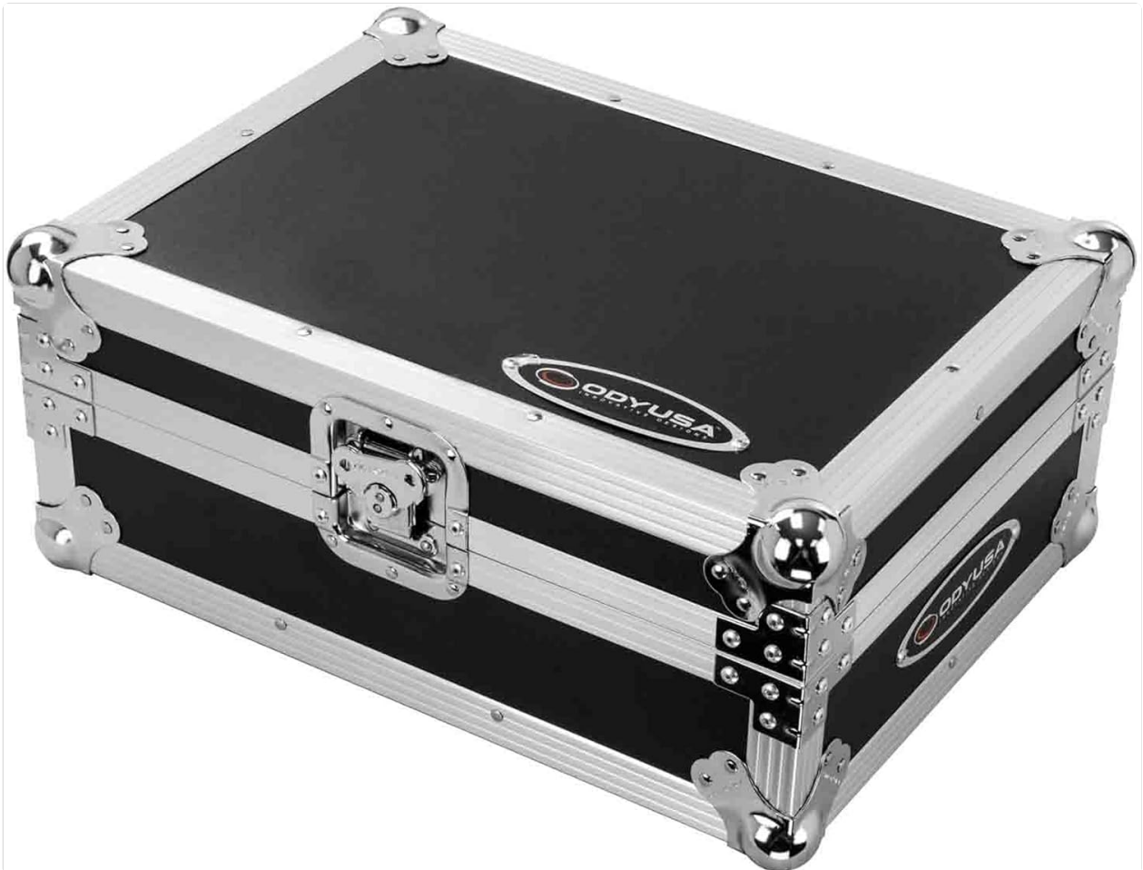
Image 4.1: Closed Odyssey FZ3000 flight case, angled view, ready for transport. This image demonstrates the compact and secure nature of the case when fully closed.