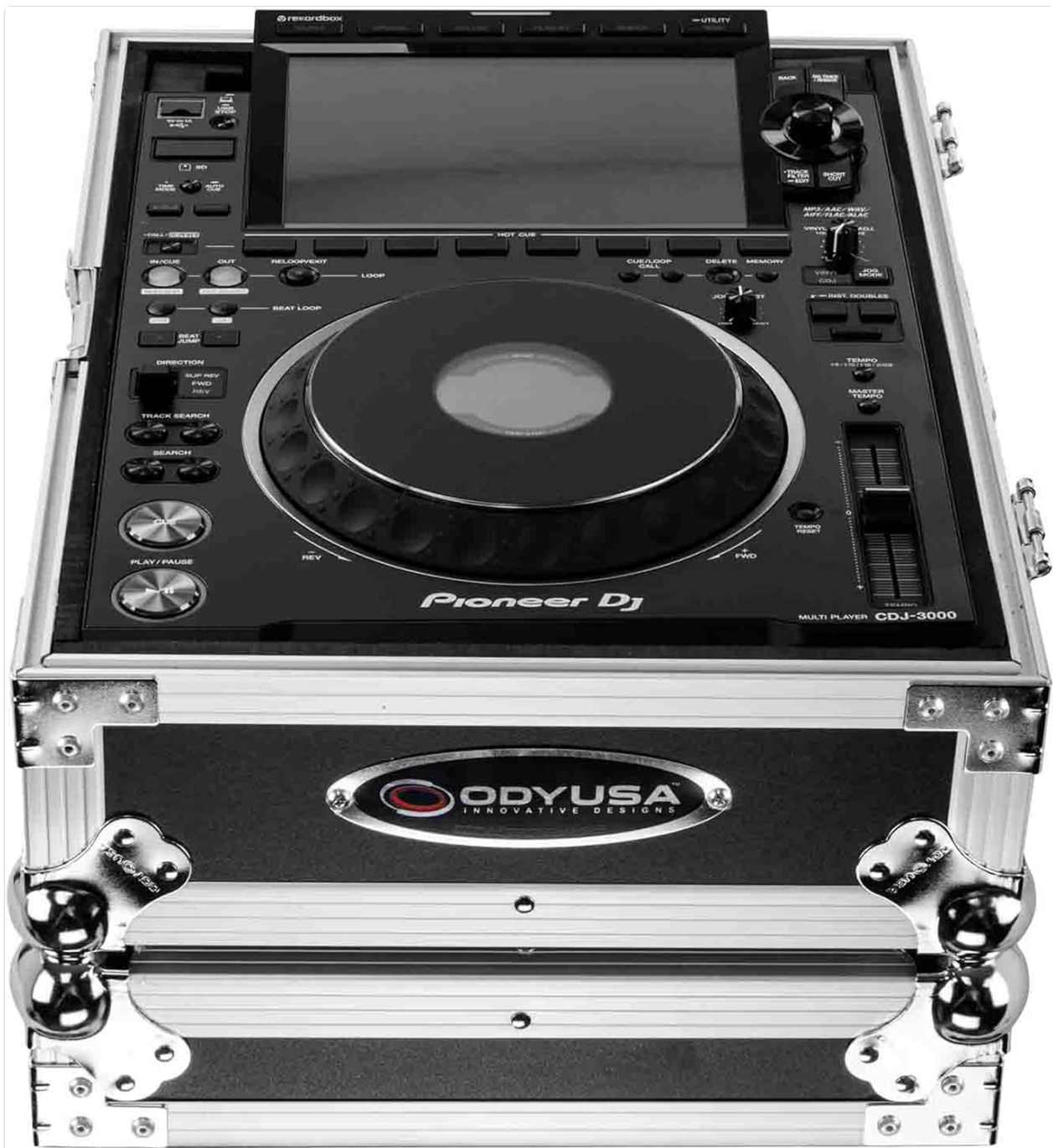
Image 1.1: Pioneer DJ CDJ-3000 player securely placed inside the Odyssey FZ3000 flight case, viewed from the top. This image illustrates the precise fit and protective design of the case around the DJ player.