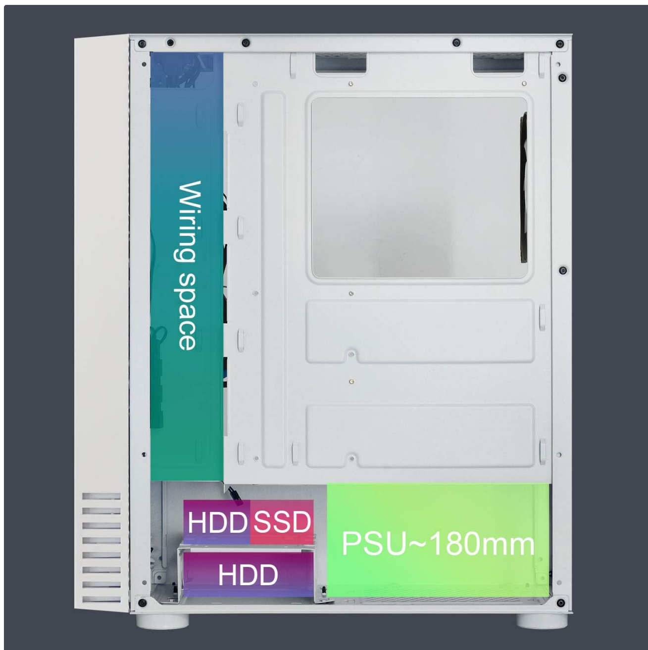
Figure 3.2: Locations for HDD, SSD, and PSU installation, highlighting wiring space.