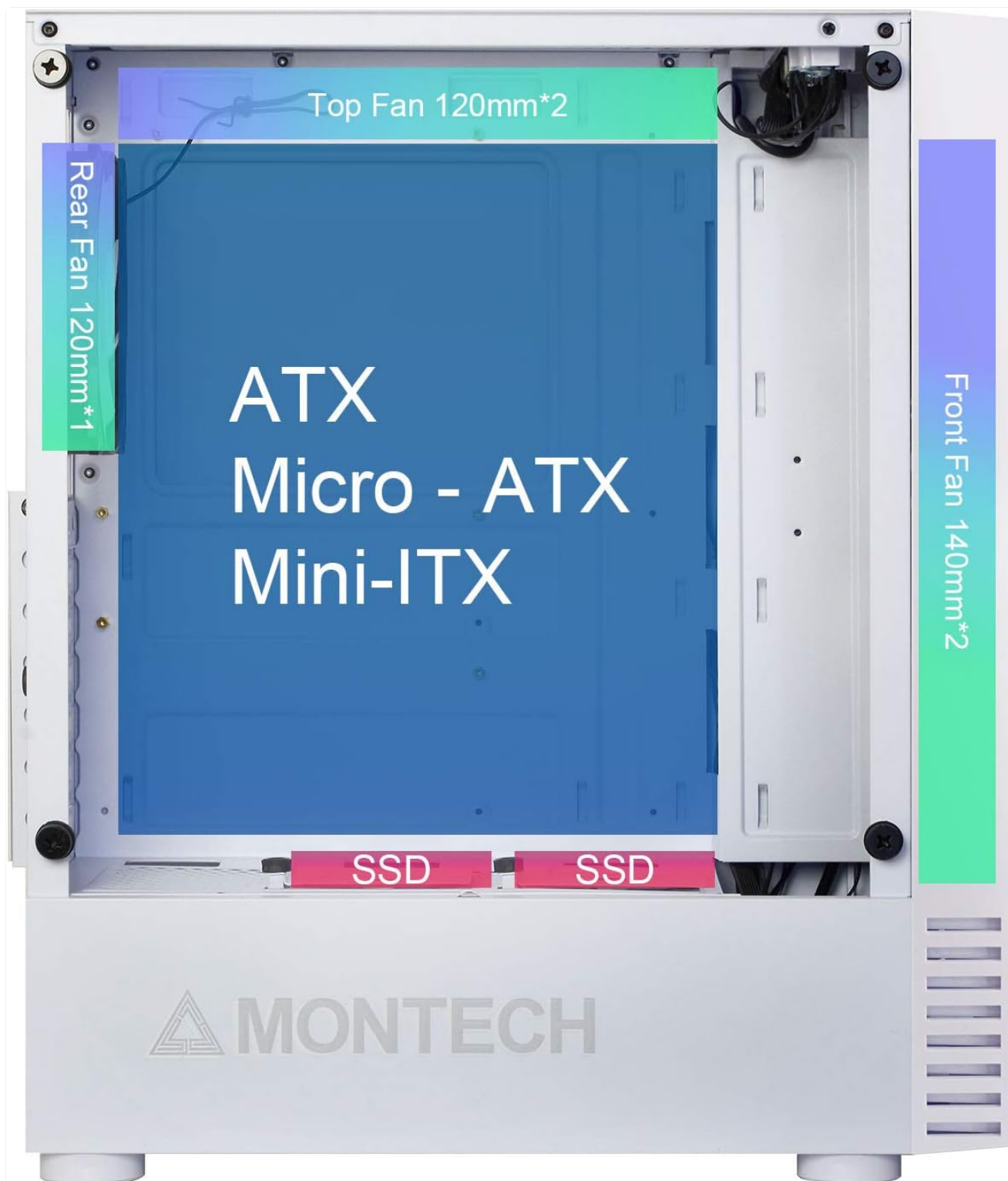
Figure 3.1: Internal layout showing compatibility for ATX, Micro-ATX, and Mini-ITX motherboards, along with fan placements.