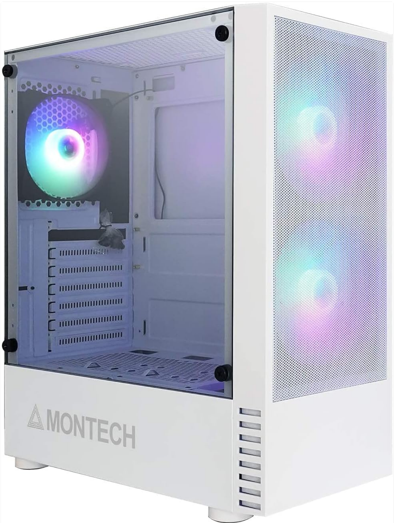
Figure 1.1: Montech X2 MESH White ATX Mid-Tower Case overview.