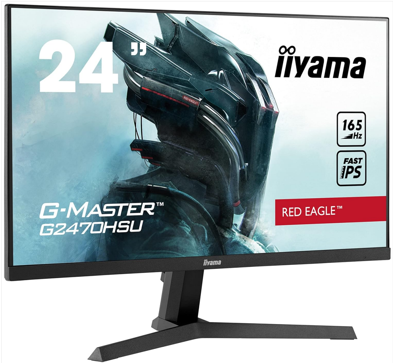
Figure 4.1: Front view of the monitor with stand.