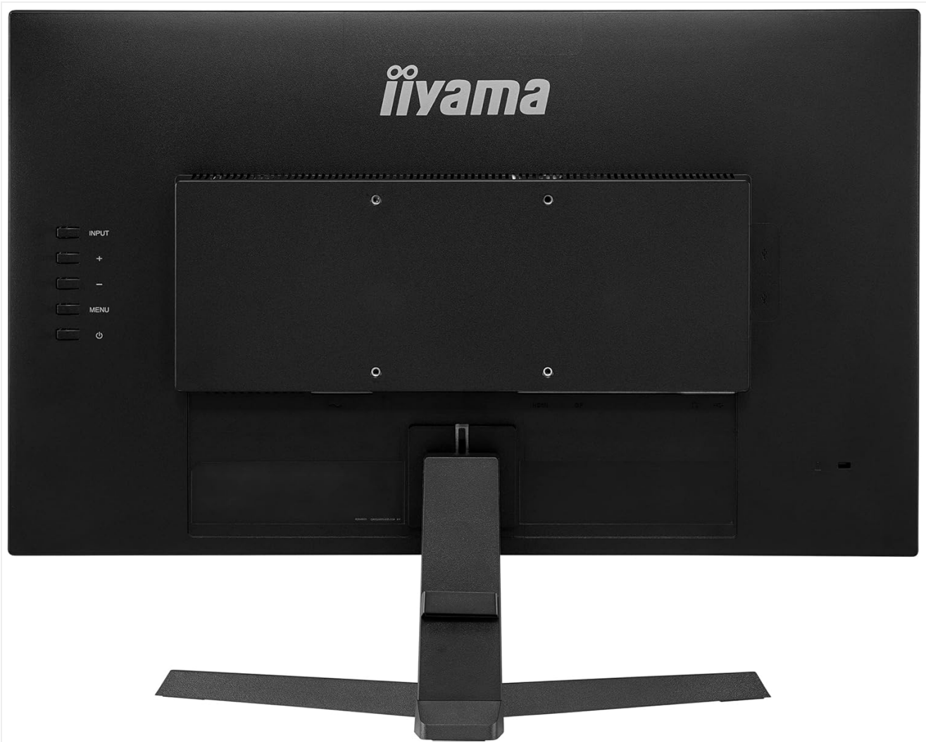
Figure 5.1: Rear view with control buttons.

Press the power button located on the rear of the monitor to turn it on or off. The power indicator light will illuminate when the monitor is on.