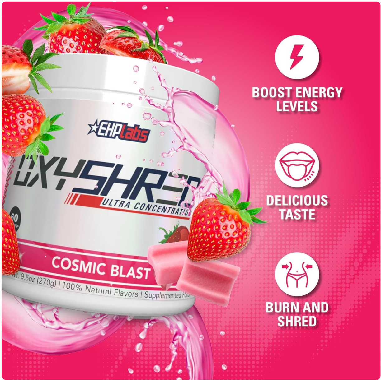
Image: Highlights key benefits of OxyShred: energy boost, delicious taste, and shredding support.