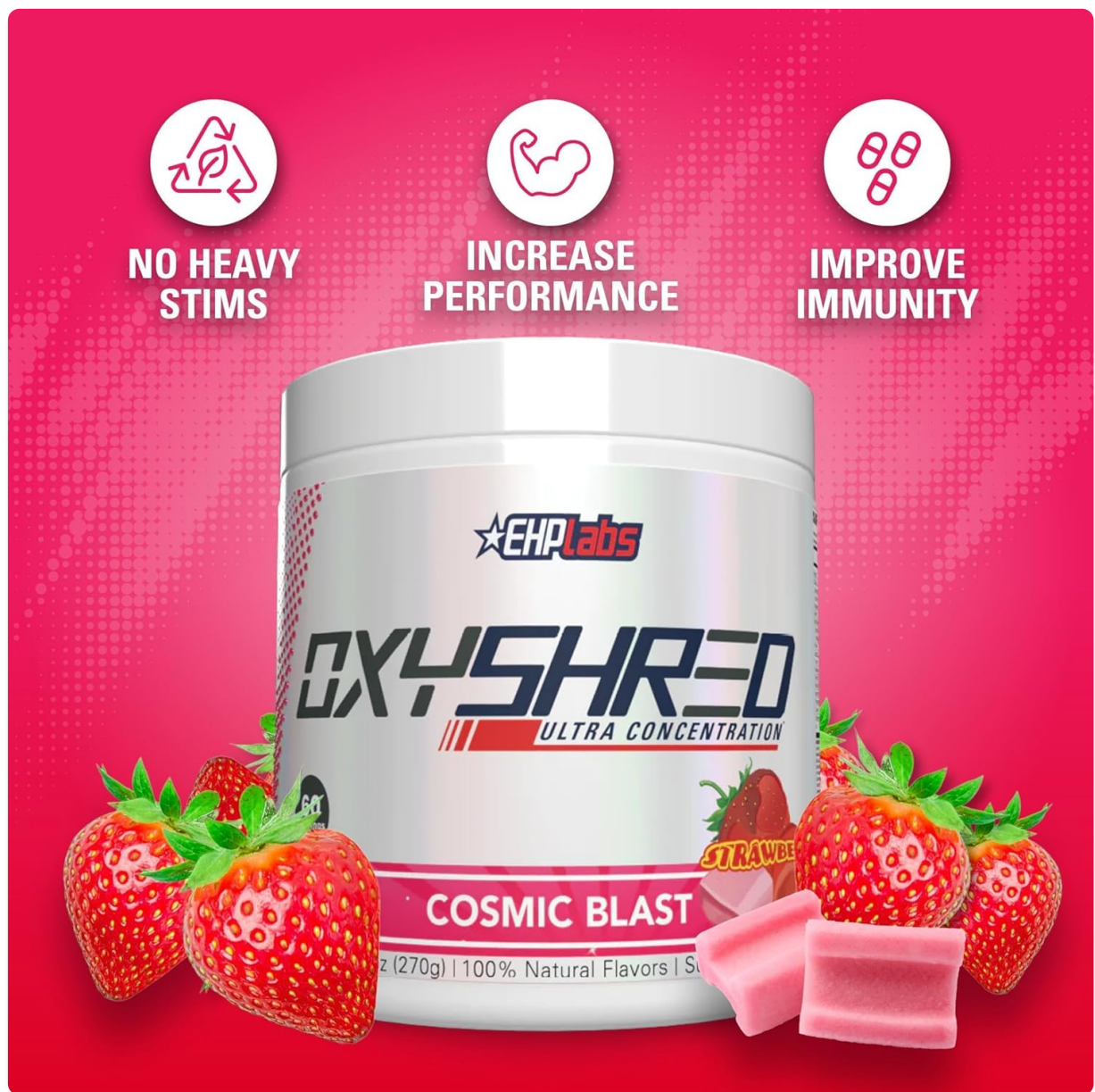
Image: Further benefits of OxyShred: no heavy stimulants, increased performance, and improved immunity.