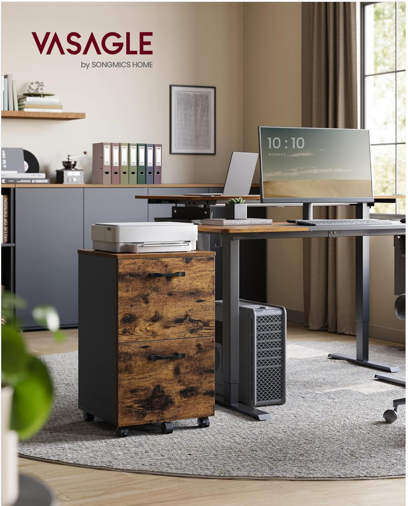
Image: The file cabinet integrated into an office workspace, demonstrating its compact size and aesthetic appeal alongside a desk and computer setup.