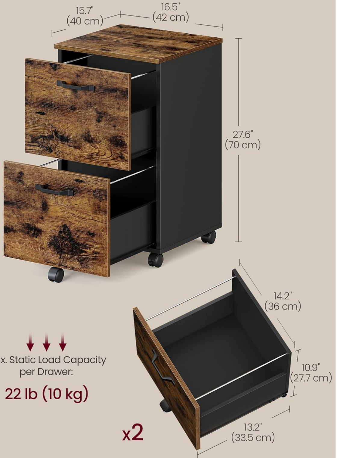
Image: A comprehensive diagram illustrating the external dimensions of the file cabinet and the internal dimensions of its drawers, including maximum static load capacity per drawer.