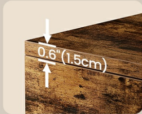
Thick, Durable Panels

Thanks to robust particleboard and solid construction