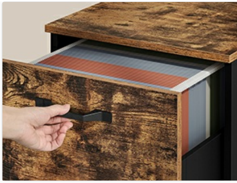
Image: A hand gently pulling open a drawer of the file cabinet, demonstrating the smooth operation of the drawer slides.