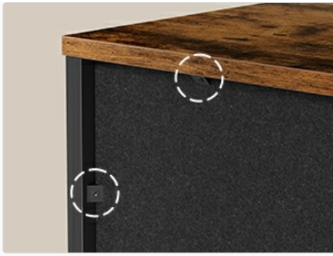
Image: A detailed view of the cabinet's side panel, highlighting the pre-drilled holes for attaching the back panel, ensuring a secure fit.