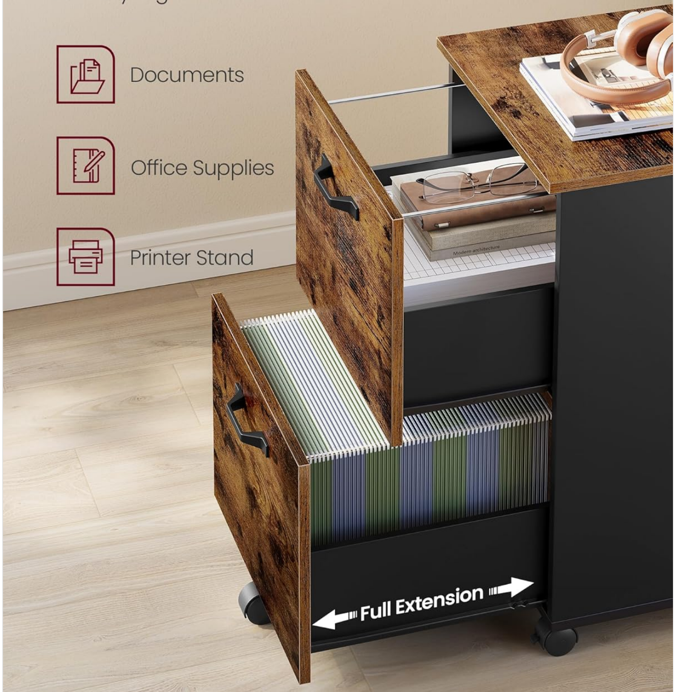
Image: Both drawers of the file cabinet are open, displaying neatly arranged hanging files and other office essentials, illustrating the ample storage capacity.