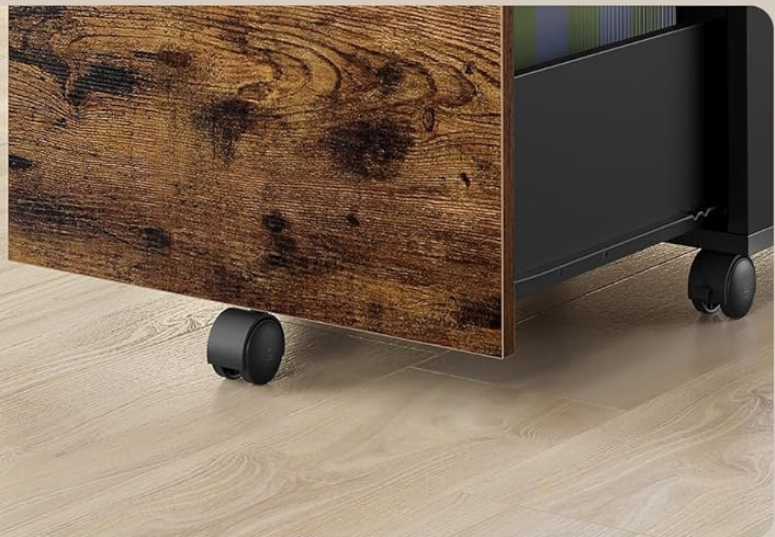
Image: An illustration detailing the cabinet's five casters, highlighting the 360° swivel function, the locking mechanism on the front two casters, and the crucial fifth caster for enhanced stability.