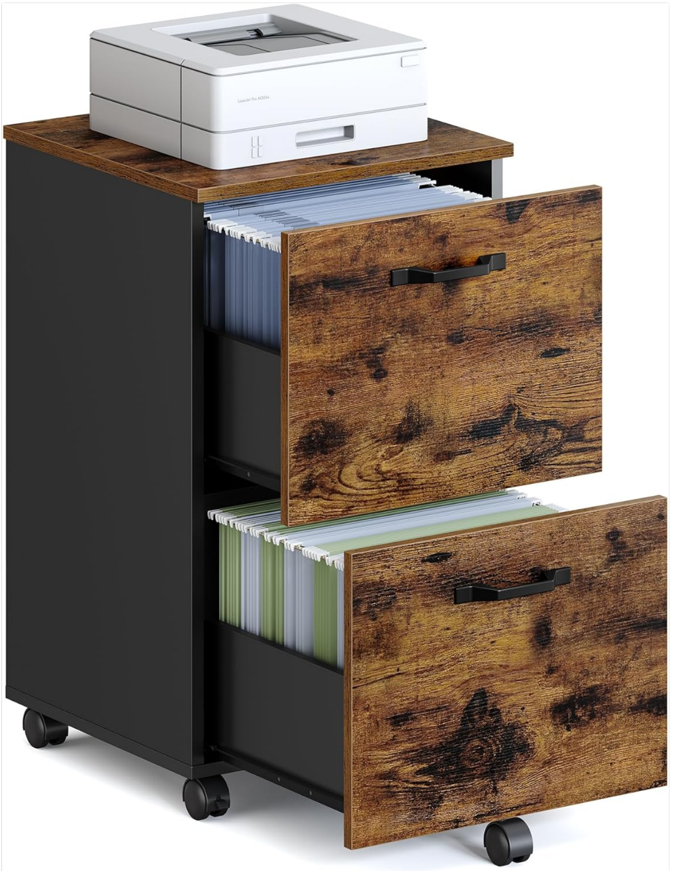
Image: The VASAGLE 2-Drawer File Cabinet in rustic brown and ink black, featuring a printer on its top surface and the upper drawer partially open, revealing organized files.