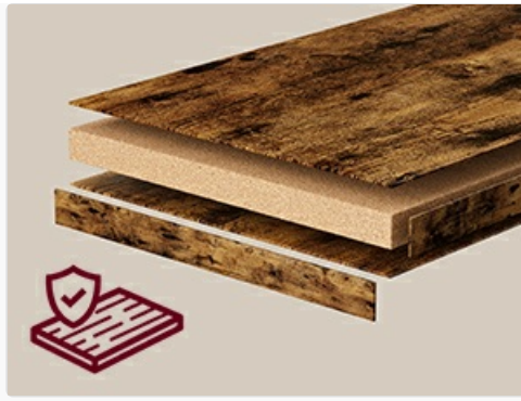
Image: A cross-section view illustrating the layered construction of the cabinet panels, highlighting the use of durable particleboard and protective finishes.