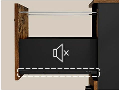
Image: A close-up of an open drawer, featuring a mute symbol, highlighting the quiet and smooth gliding mechanism of the drawer slides.