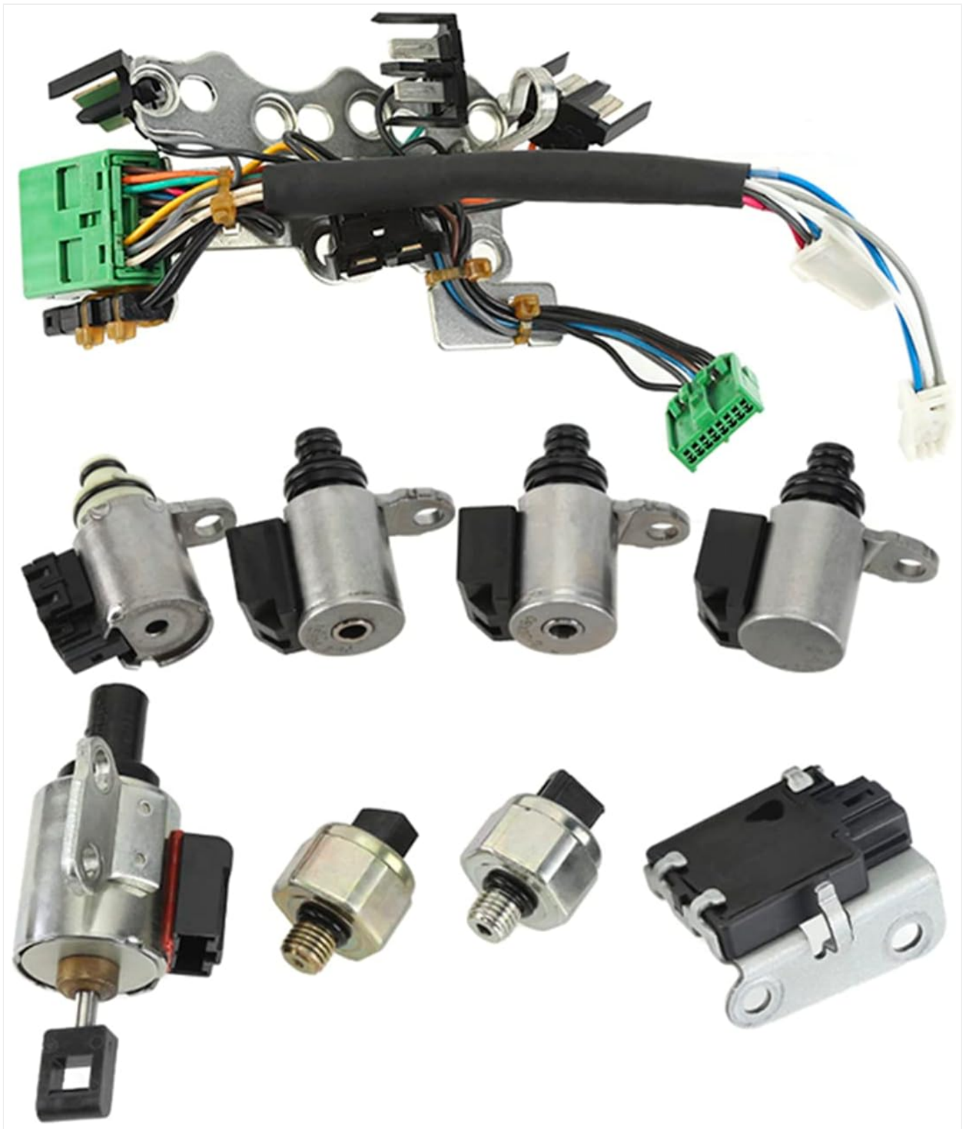
Image 1: Complete coolautocore JF011E CVT Valve Body Solenoids Kit. This image displays all 9 components included in the kit, featuring the wiring harness assembly and the individual solenoids.