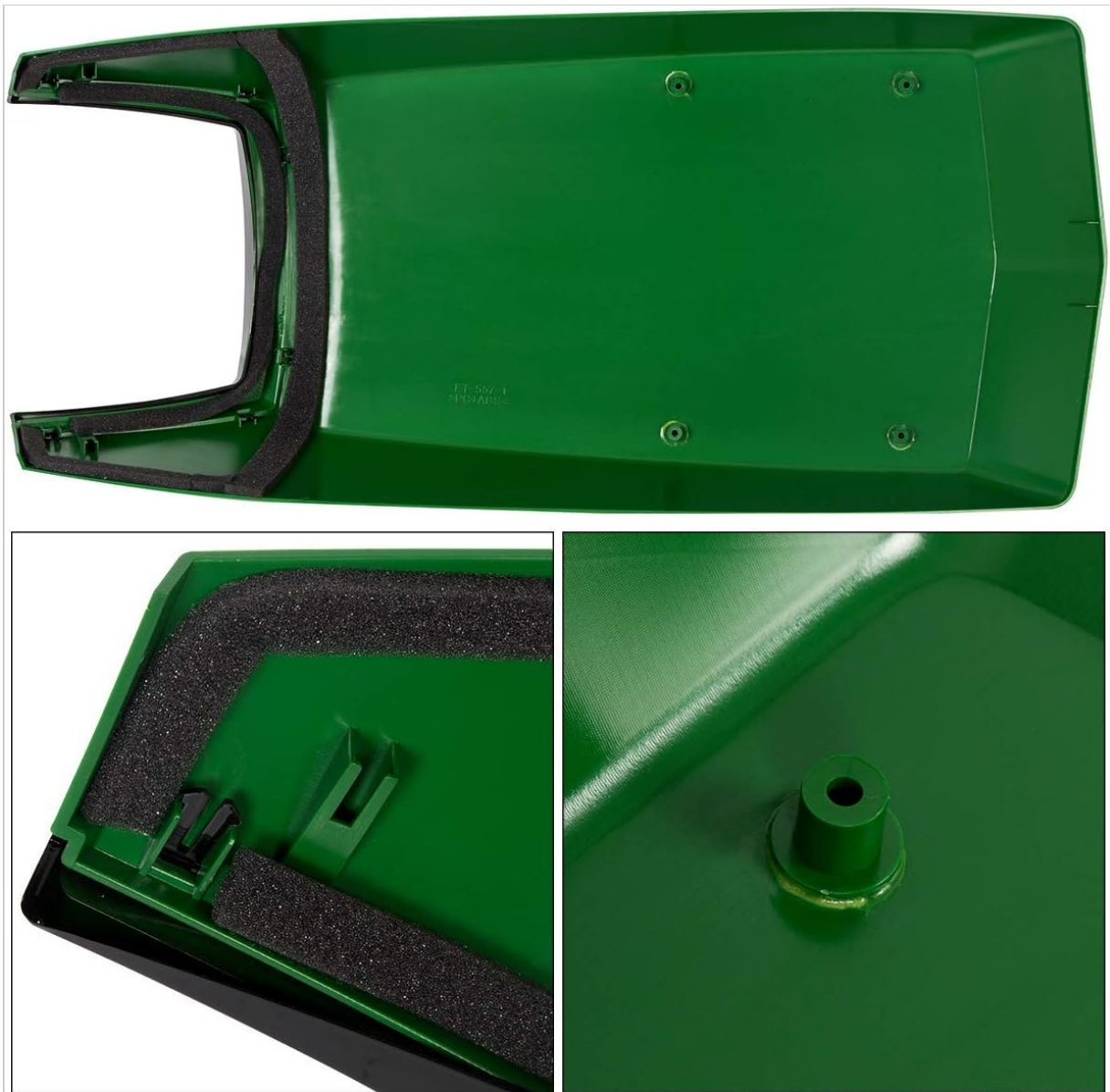
Image 3.2: Detailed view showing the internal clips and screw posts on the ECOTRIC Upper Hood, crucial for secure installation.