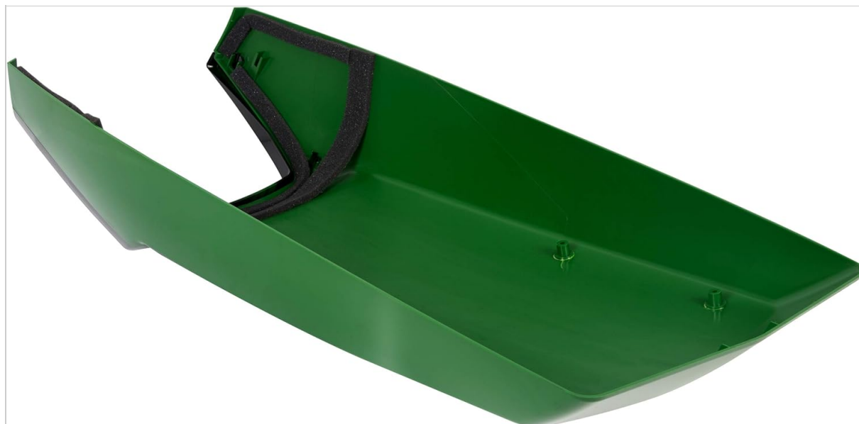
Image 3.1: Underside view of the ECOTRIC Upper Hood, highlighting the molded mounting points for screws.