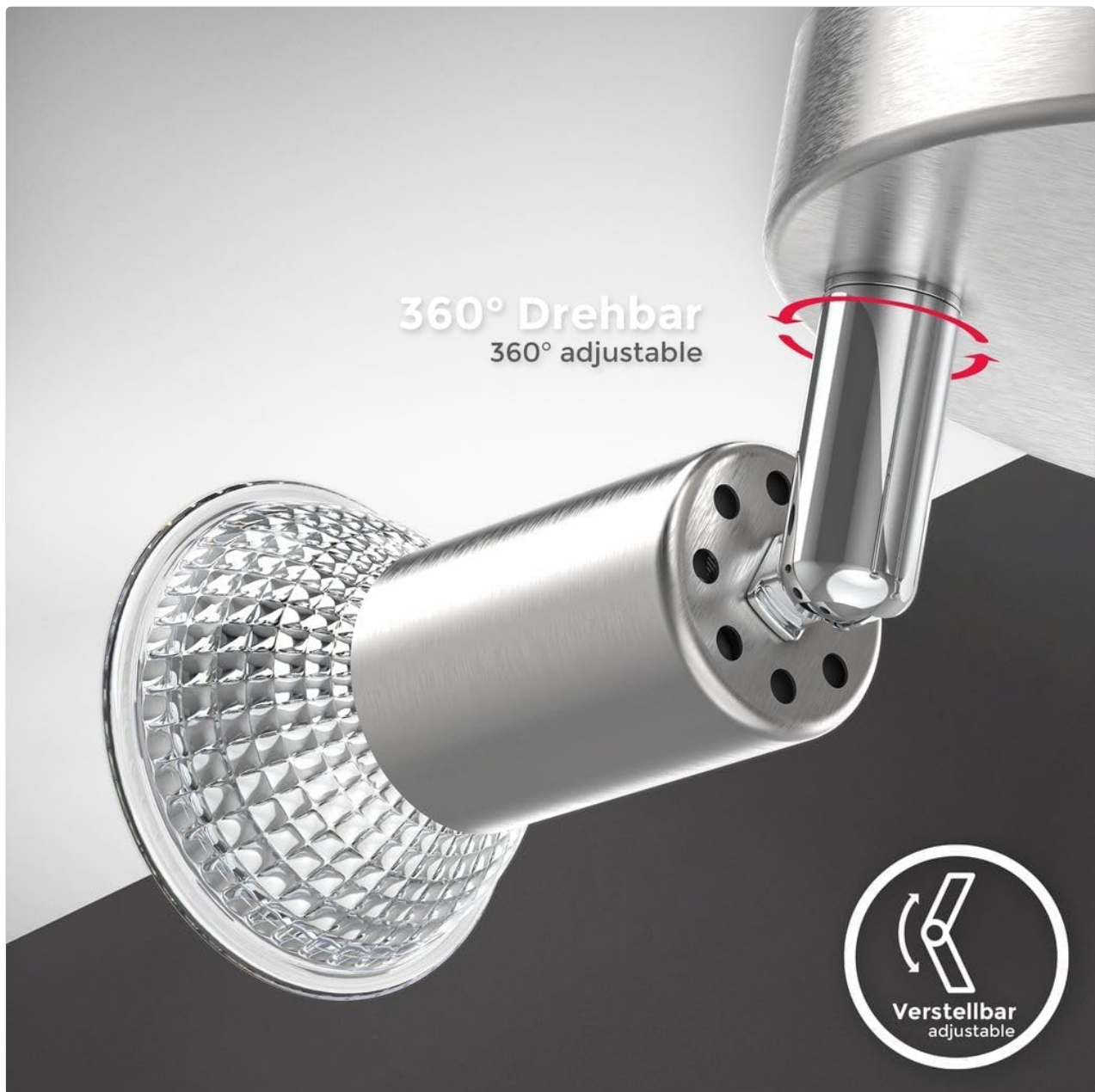
Image 5.1: Illustration of the 360-degree adjustable feature of the spotlights.