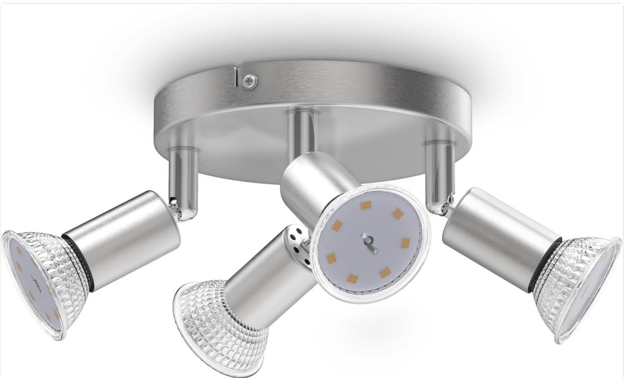
Image 1.1: The B.K.Licht LED Ceiling Light featuring four adjustable spotlights in a matt nickel finish.

The B.K.Licht LED Ceiling Light BKL1337 is a modern lighting fixture featuring four individually adjustable swivel spotlights. It is designed for indoor use, providing warm white illumination suitable for various living spaces such as bedrooms, living rooms, dining rooms, and kitchens. The light comes equipped with energy-efficient GU10 LED bulbs.