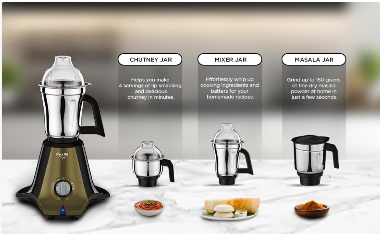
Image: A visual representation of the three jars (Chutney Jar, Mixer Jar, Masala Jar) with their respective capacities and typical uses, such as making chutney, whipping ingredients, and grinding dry masala.