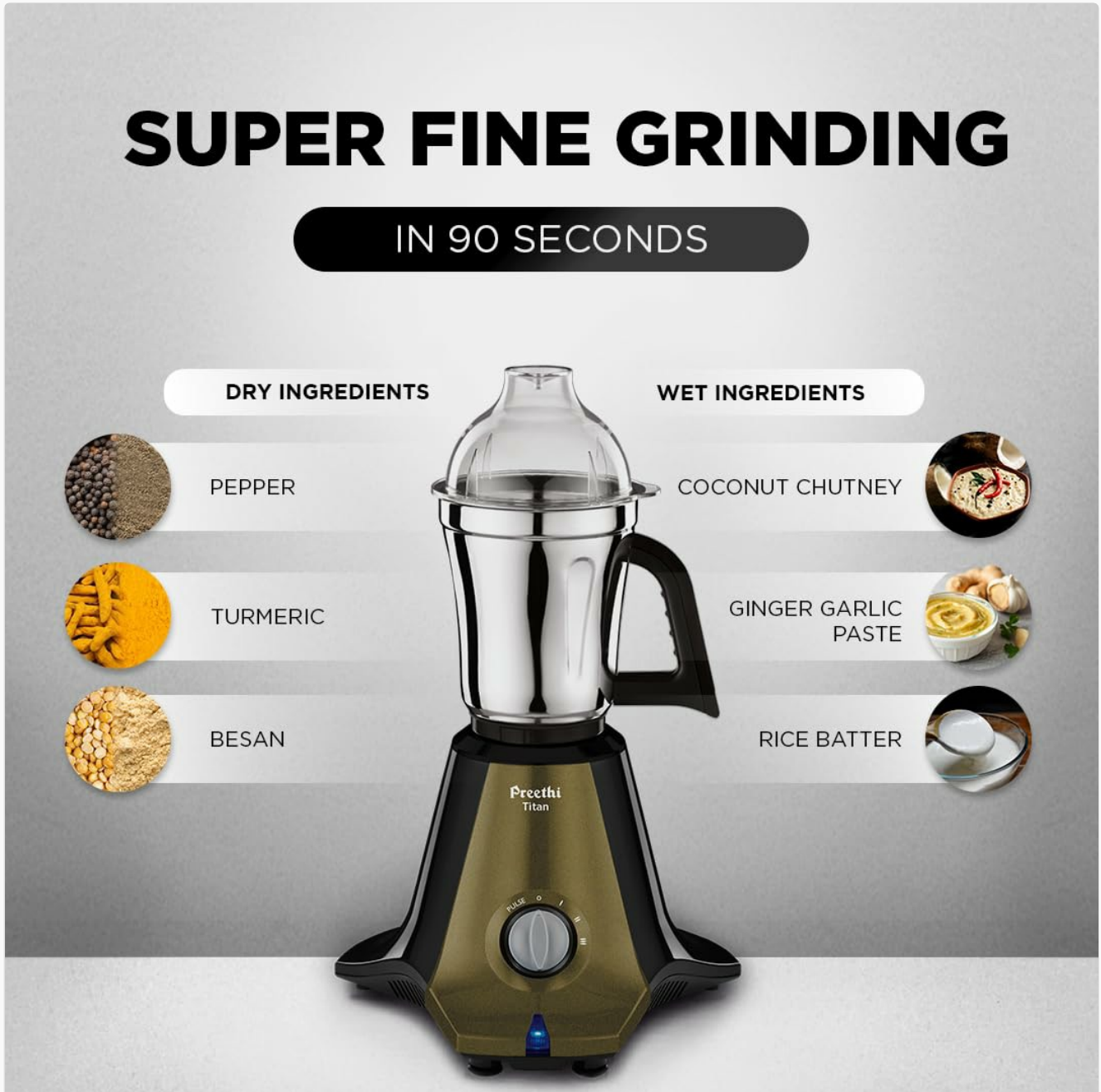
Image: An illustration showing various dry ingredients (pepper, turmeric, besan) and wet ingredients (coconut chutney, ginger garlic paste, rice batter) that can be ground to a superfine consistency in 90 seconds using the mixer grinder.