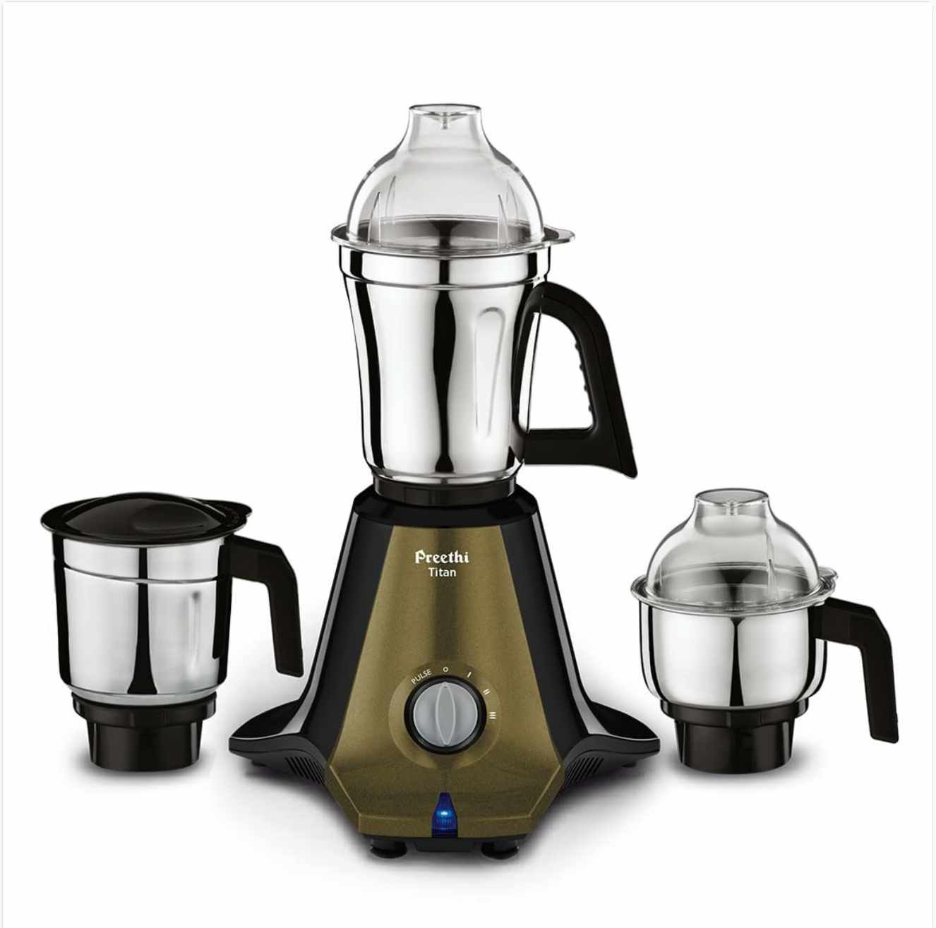
Image: The Preethi Titan Mixer Grinder base unit with three stainless steel jars of varying sizes, each with a clear lid. The base unit is black and gold, featuring a central control knob.

The Preethi Titan Mixer Grinder MG-283 is a 1000W kitchen appliance designed for efficient grinding. It comes with three stainless steel jars for various grinding needs.