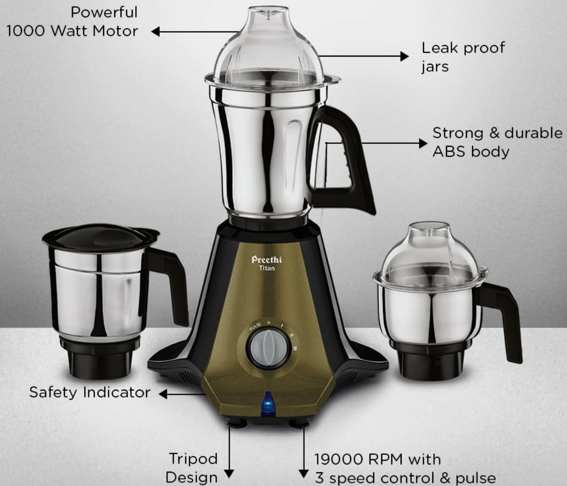
Image: A diagram highlighting key features of the Preethi Titan Mixer Grinder, including the 1000 Watt Motor, leak-proof jars, strong & durable ABS body, safety indicator, tripod design, and 19000 RPM with 3 speed control & pulse.