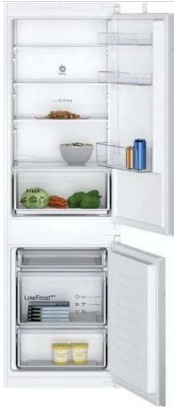
Figure 1: Front view of the BALAY 3KIF711S integrated refrigerator and freezer with both compartments open, showcasing the interior layout including shelves, drawers, and door bins. The upper compartment is the refrigerator, and the lower compartment is the freezer.