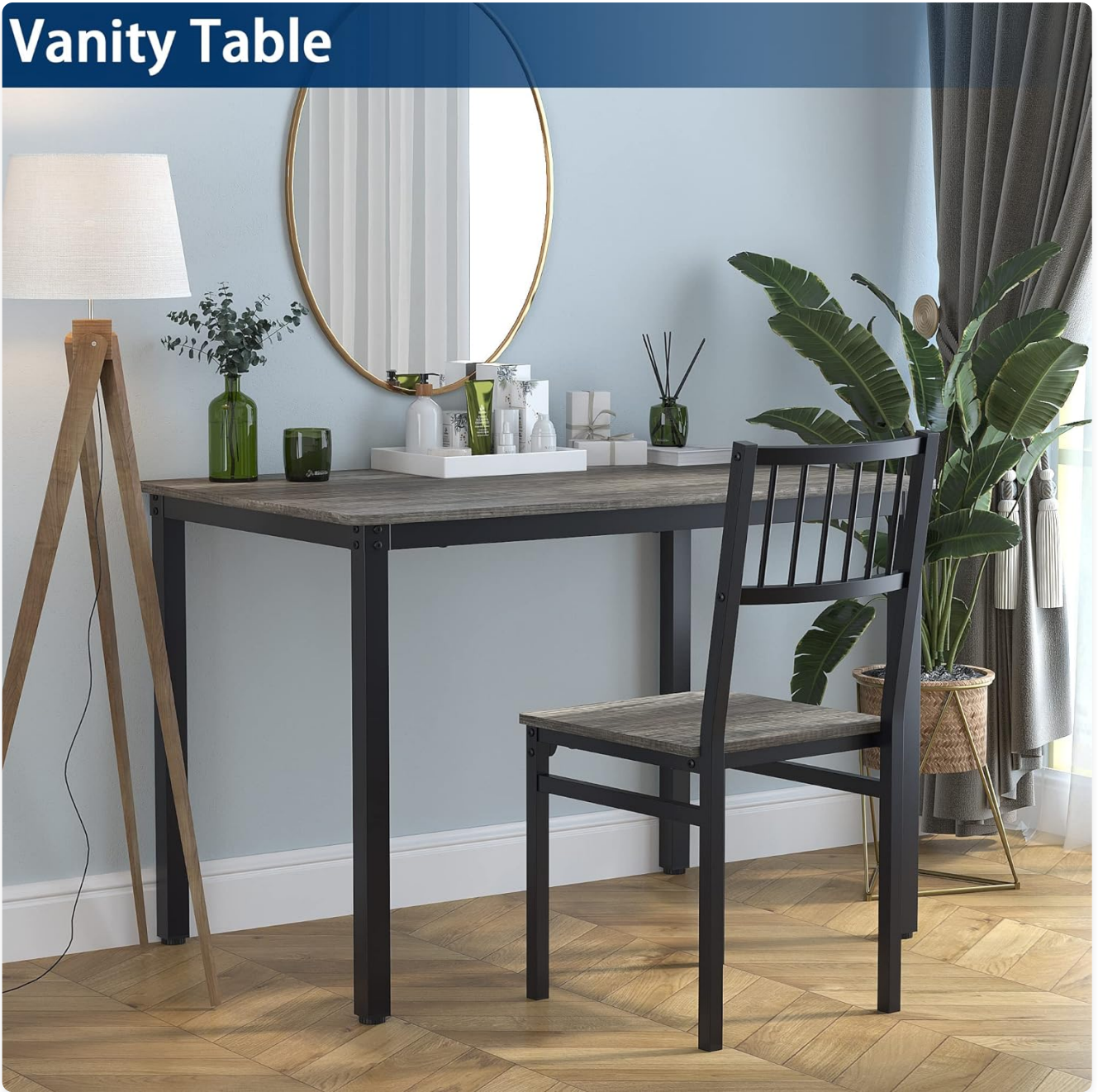
Image: The table functioning as a vanity, showcasing its versatility beyond dining.