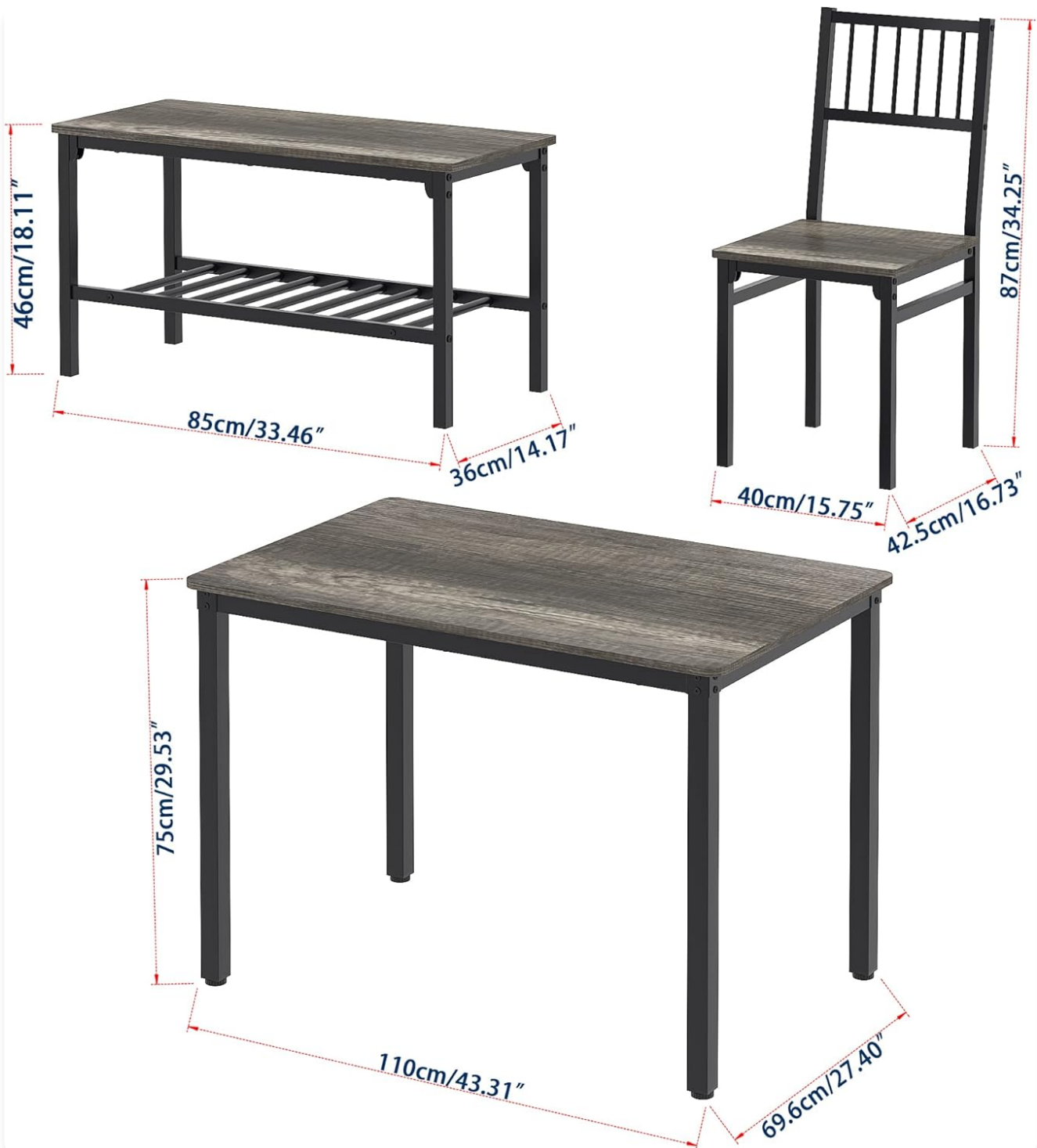
Image: Comprehensive dimension diagram for the table, chairs, and bench.