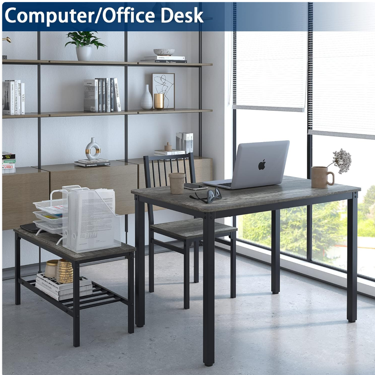
Image: The table serving as a computer desk, demonstrating its adaptability for home office use.