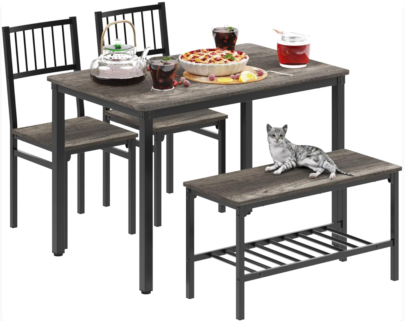
Image: The complete Teraves Dining Table Set, showcasing the table, two chairs, and a bench in a black oak finish with black frames.