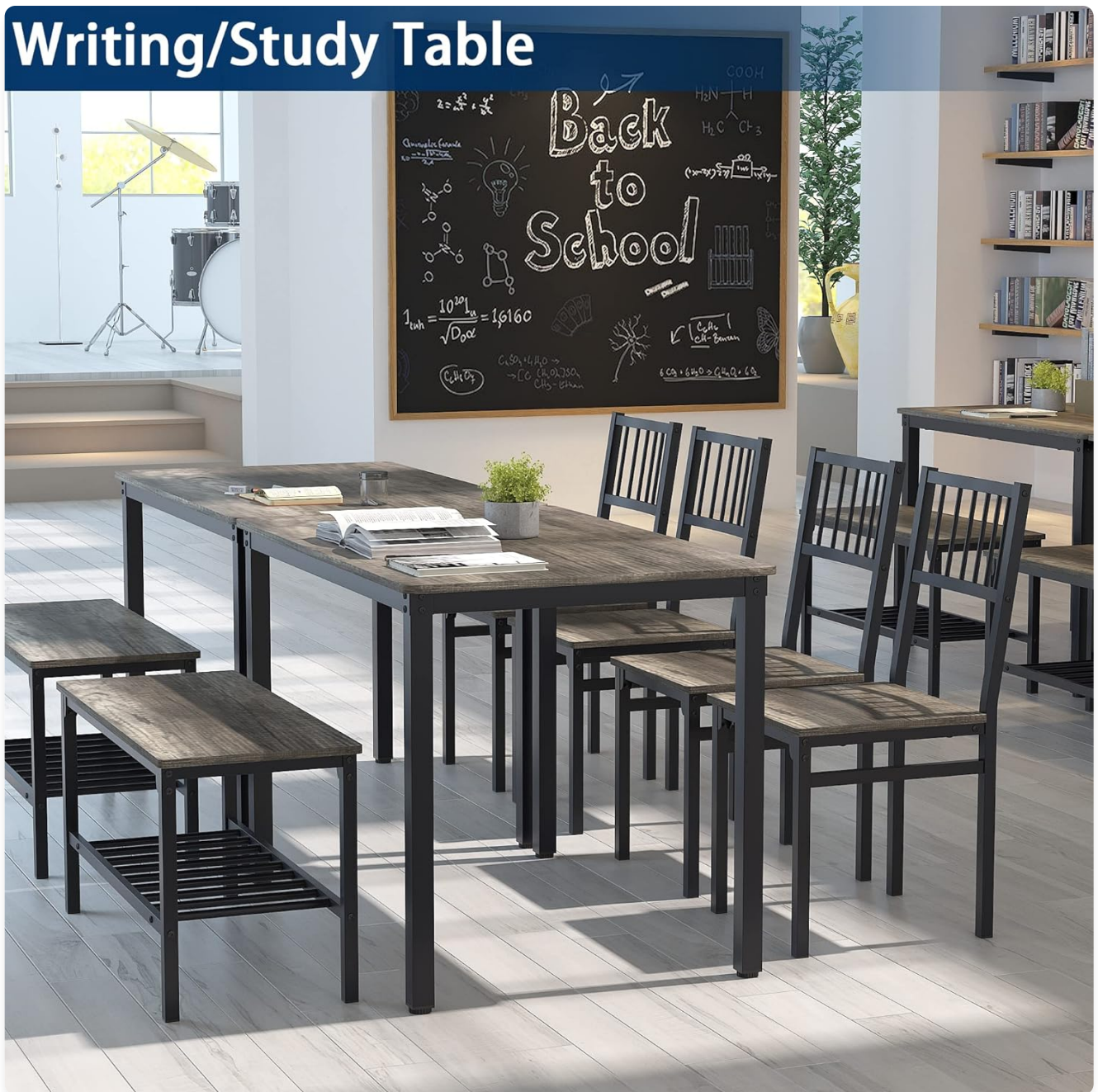
Image: The table set up as a writing or study table, highlighting its utility for educational or creative tasks.