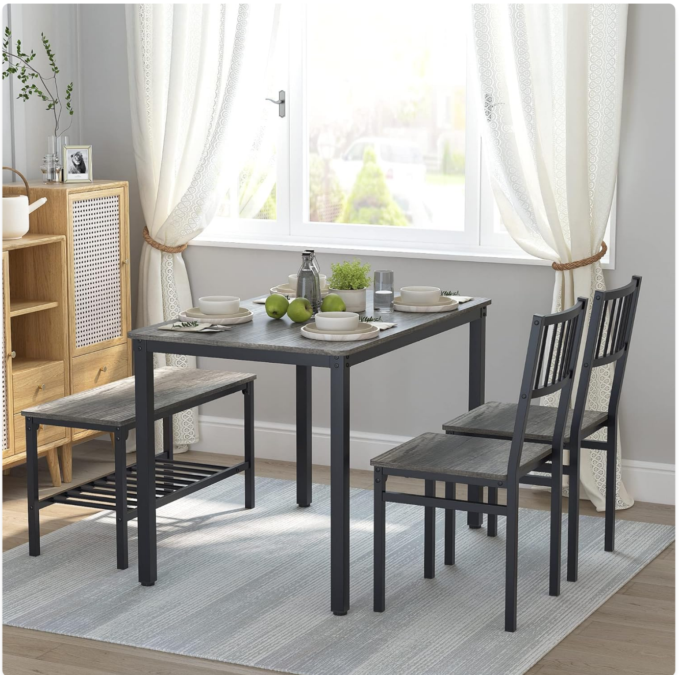
Image: The dining set positioned in a room, highlighting its suitability for smaller spaces and contemporary design.