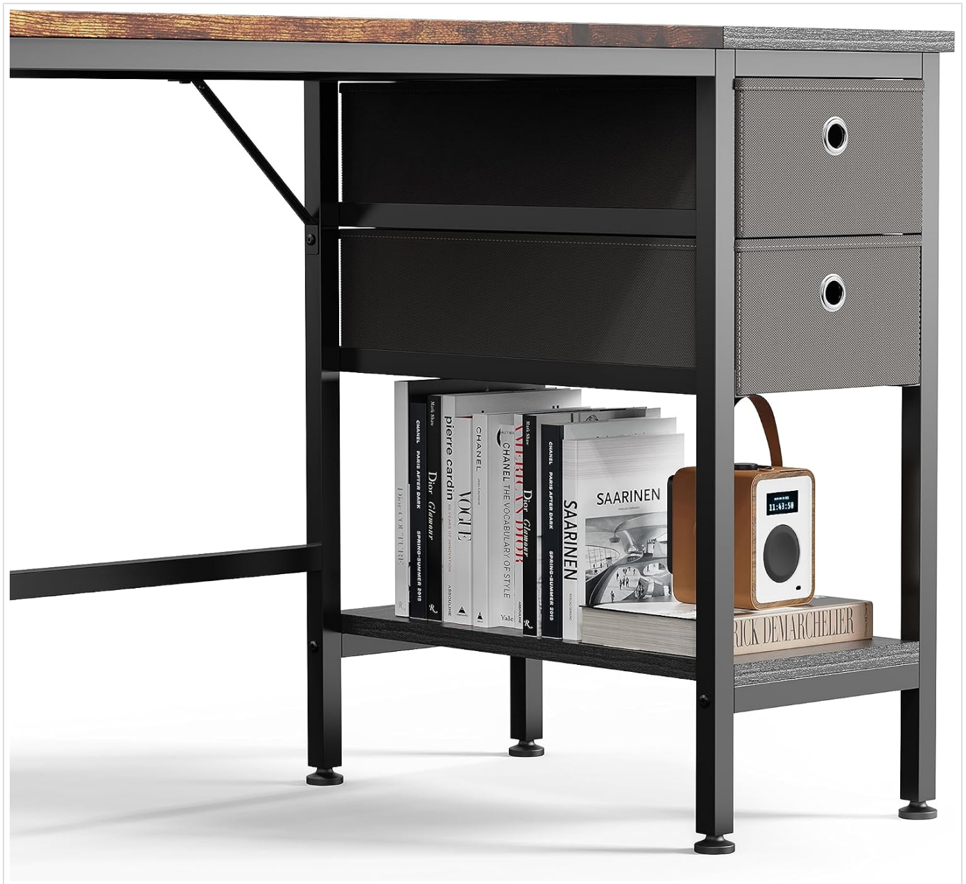
Figure 4.1: The integrated storage unit, demonstrating its capacity for books and other items on the lower shelf, and the fabric drawers for concealed storage.