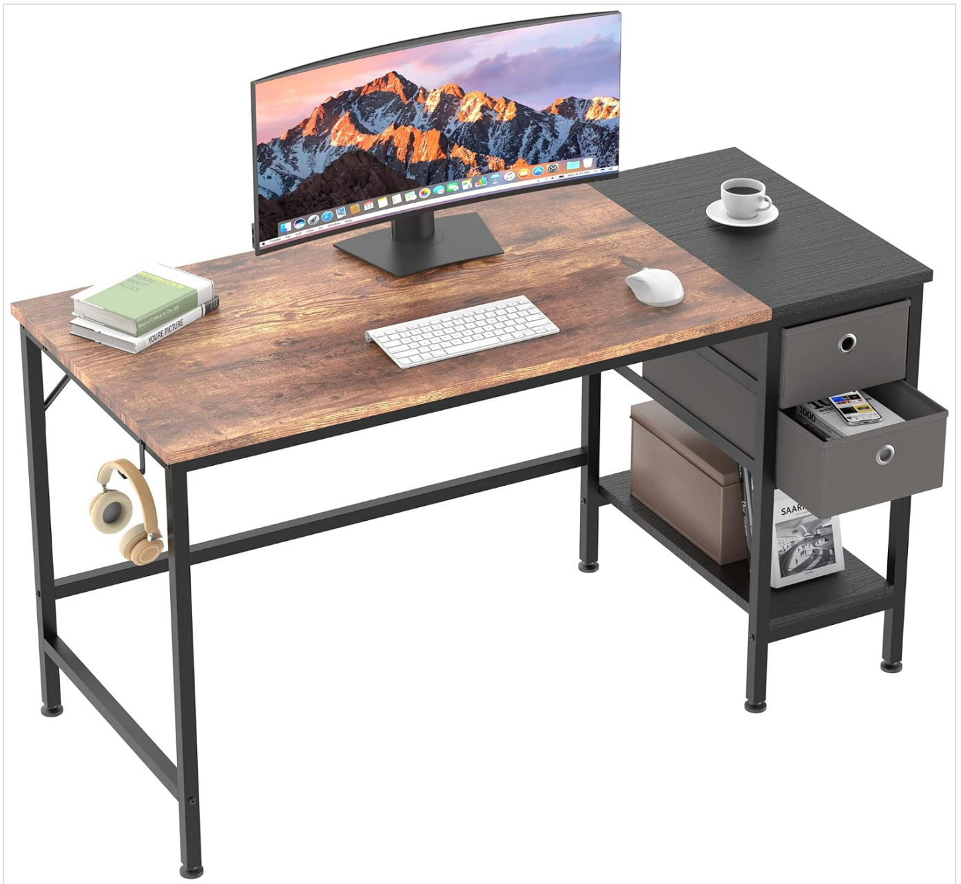
Figure 1.1: The HOMIDEC Computer Desk, showcasing its main features including the spacious desktop, integrated storage, and headphone hook.