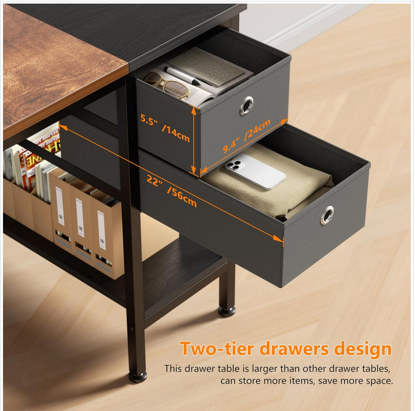
Figure 2.1: Detail of the two-tier fabric drawers, providing ample storage for office supplies and personal items.