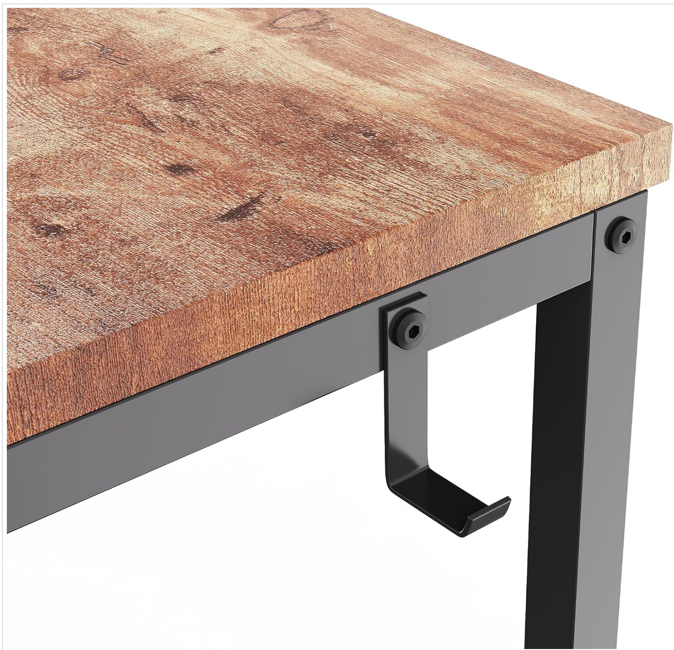
Figure 2.2: The convenient headphone hook, designed for easy access and desktop organization.