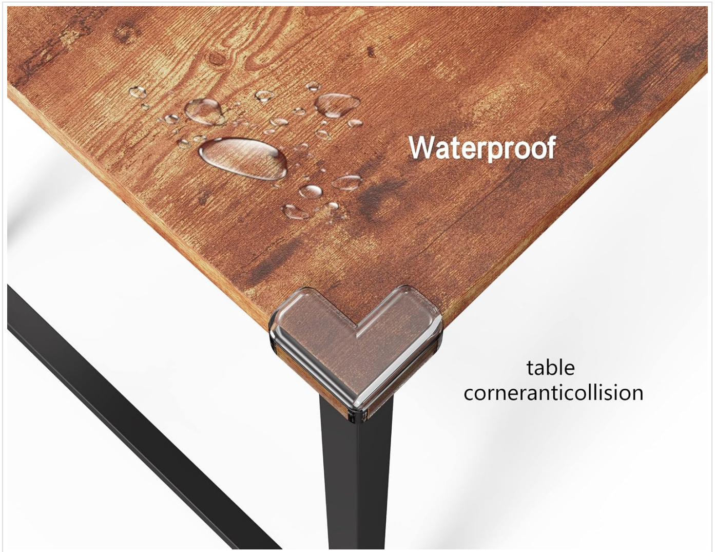
Figure 5.1: The waterproof surface of the desk, designed to protect against spills and moisture.