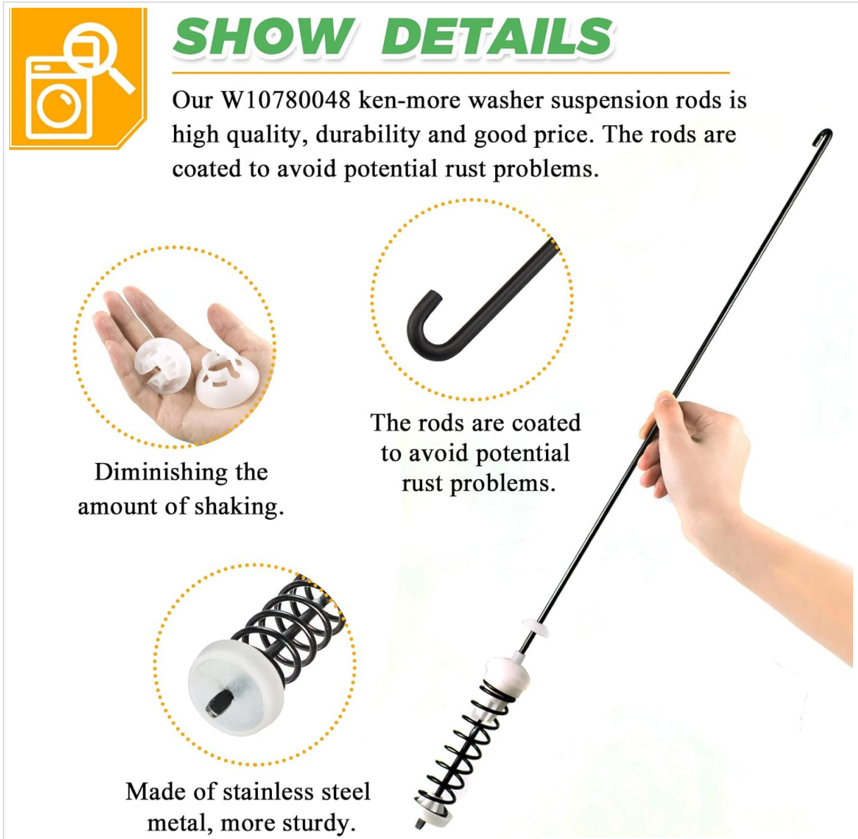
Image 5.1: Detailed view of the suspension rod, highlighting the coated rod, hook design, and suspension ball components.