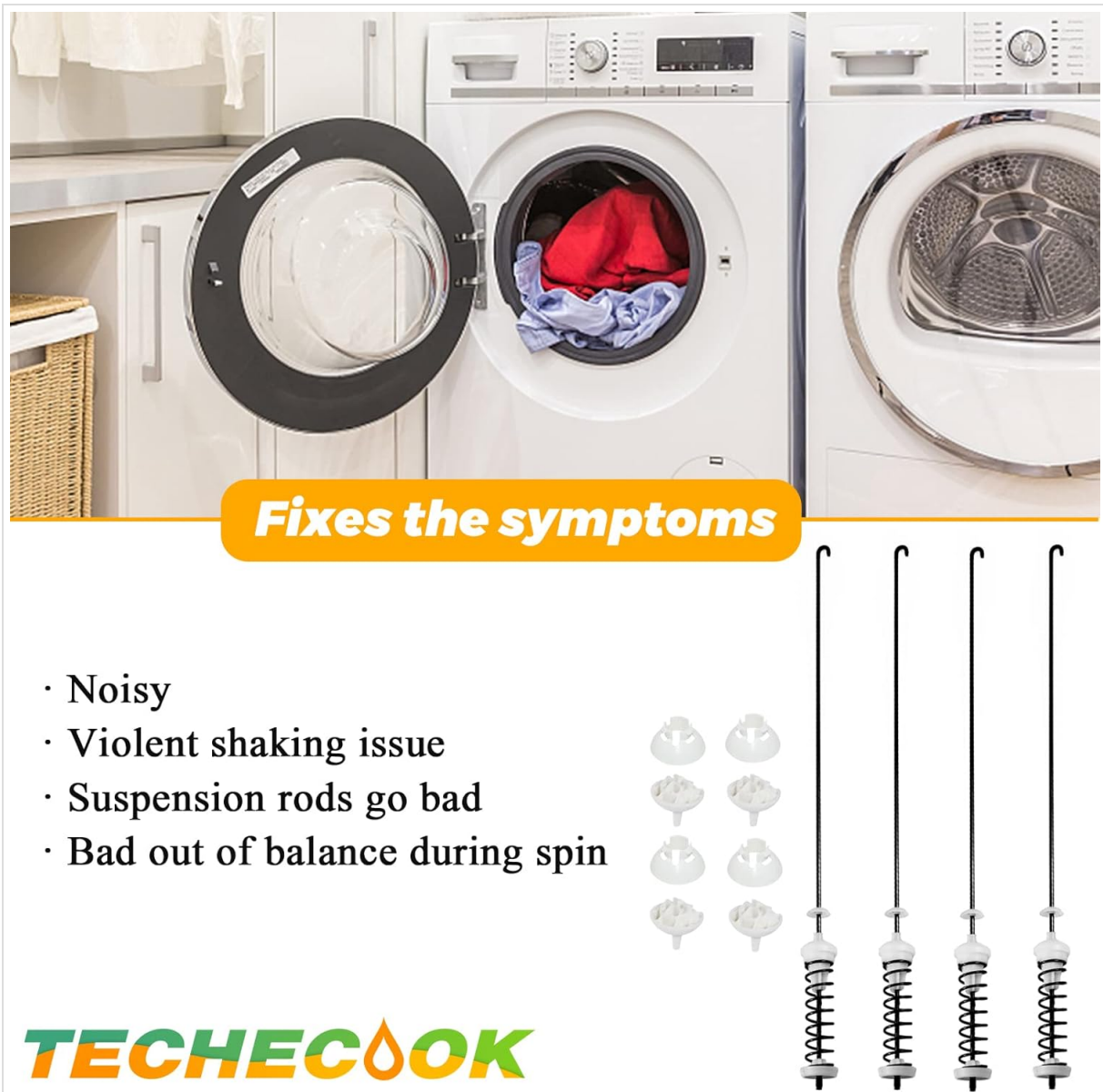
Image 4.1: Illustration of a washing machine and common symptoms like noise and shaking that the suspension rod kit can address.