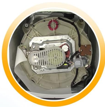
Push up on the spring