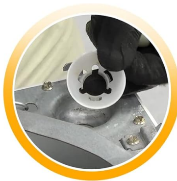
Set it down and snap it in