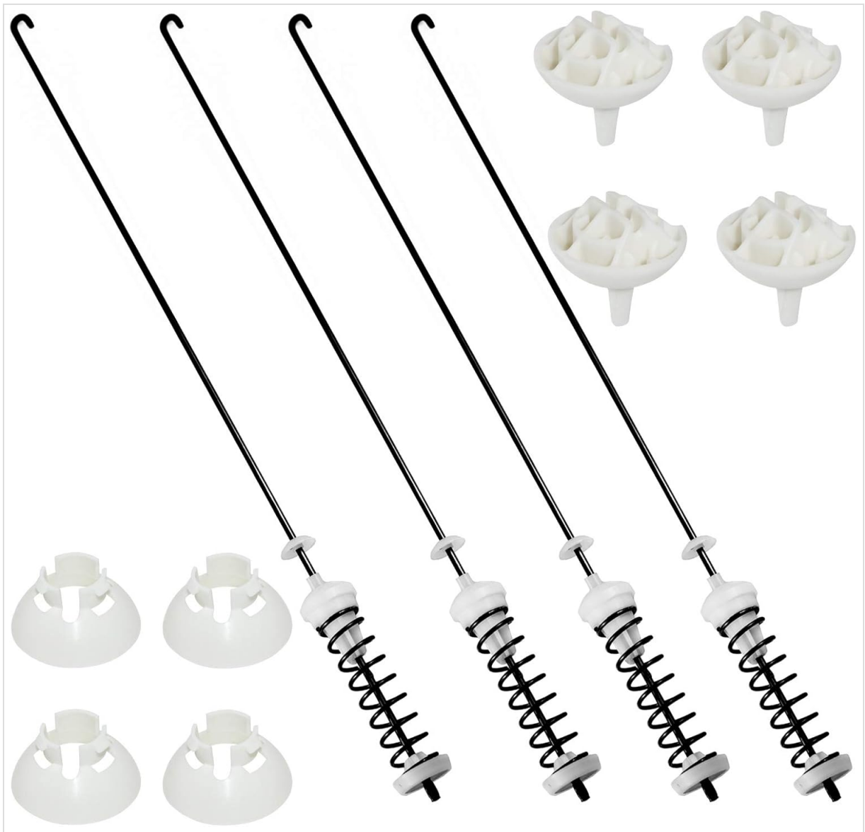
Image 2.1: Overview of the W10780048 Washer Suspension Rod Replacement Kit, showing four rods, four suspension balls, and four ball housings.