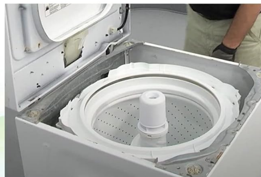
Install the Washing Machine