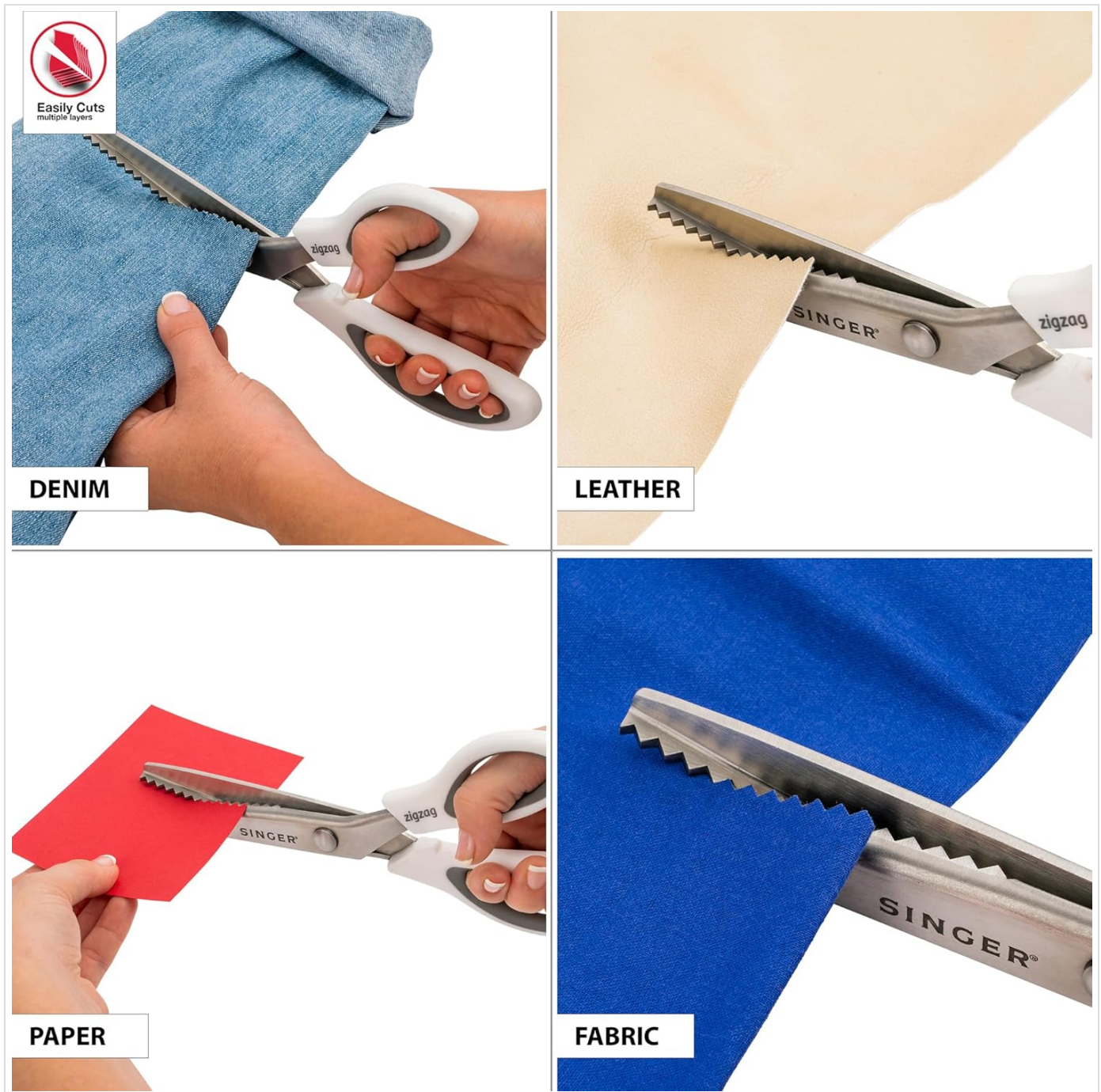
Image: SINGER Pinking Shears demonstrating their ability to cut various materials including denim, leather, paper, and general fabric.

The shears are effective on a variety of materials, including denim, leather, paper, and different types of fabric. The zigzag edge helps prevent fraying, making them ideal for finishing raw edges.