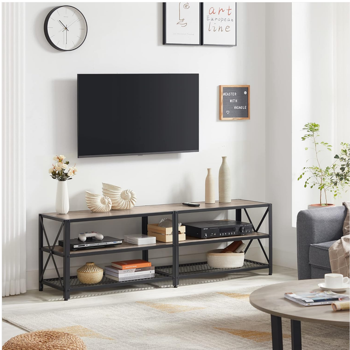
Image 1.1: The VASAGLE TV Stand LTV095B02 in a living room, showcasing its design and functionality.