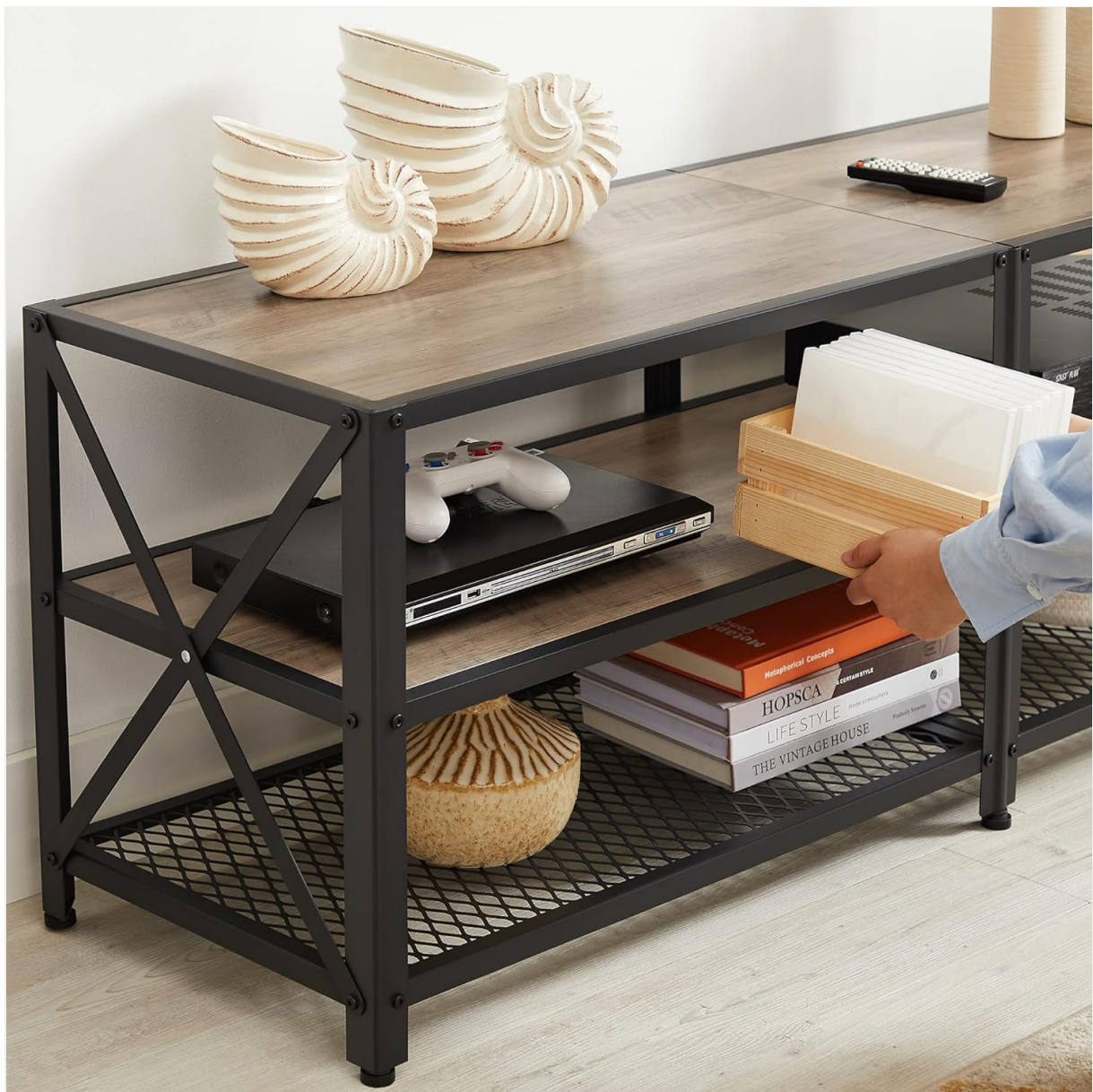
Image 5.2: Example of storage utilization on the TV stand's shelves.