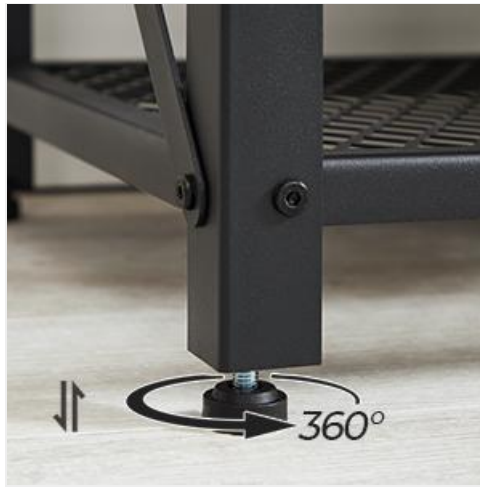
Image 4.2: Detail of the adjustable feet for leveling the TV stand.