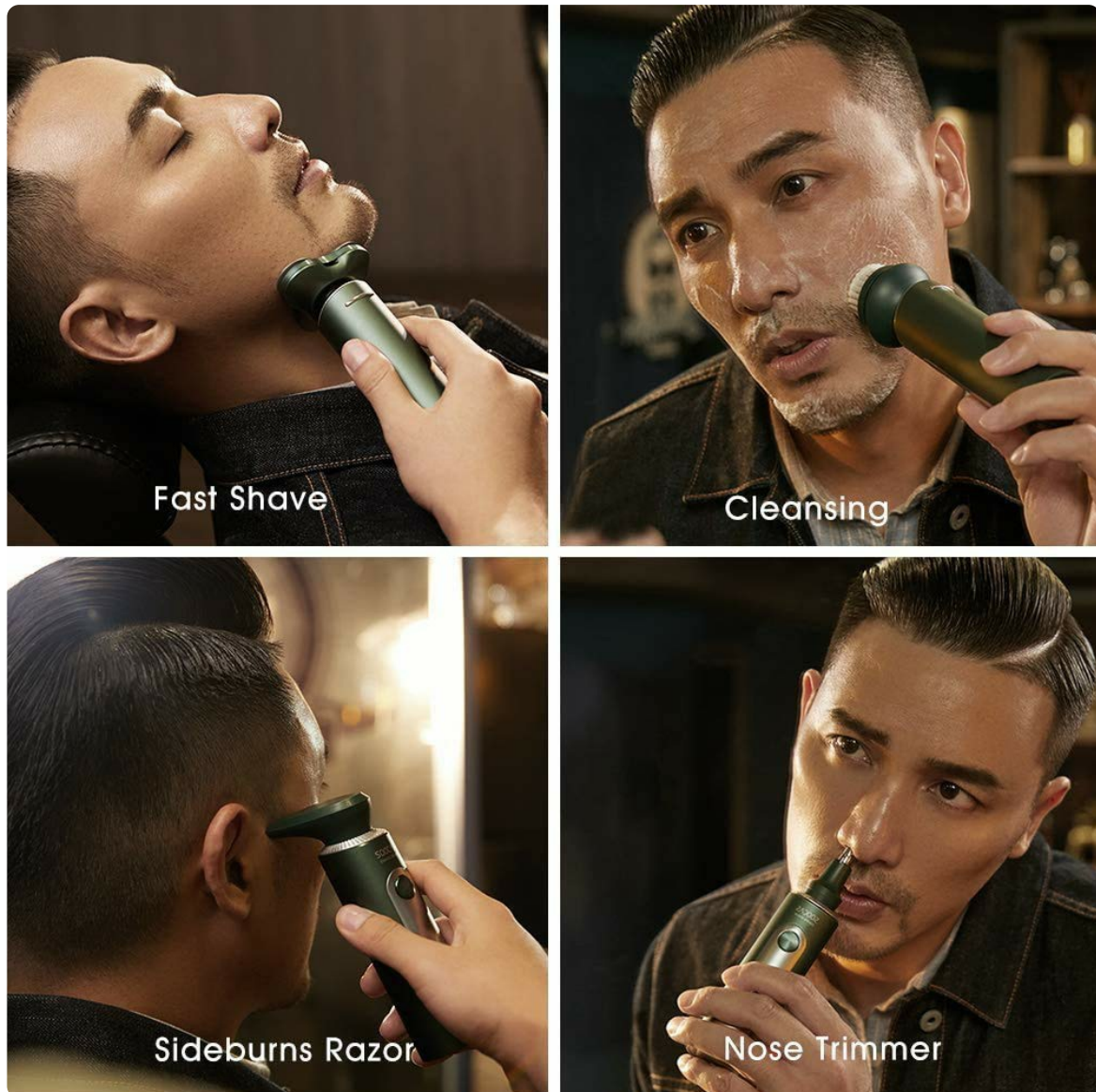
Figure 4.2: 4-in-1 Multifunctional Use