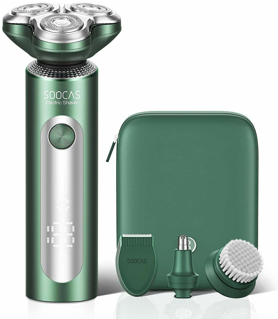
Figure 1.1: SOOCAS S5 Electric Razor and Accessories

Video 1.1: Overview of the SOOCAS 4-in-1 Electric Shaver, highlighting its cordless and wet/dry capabilities.