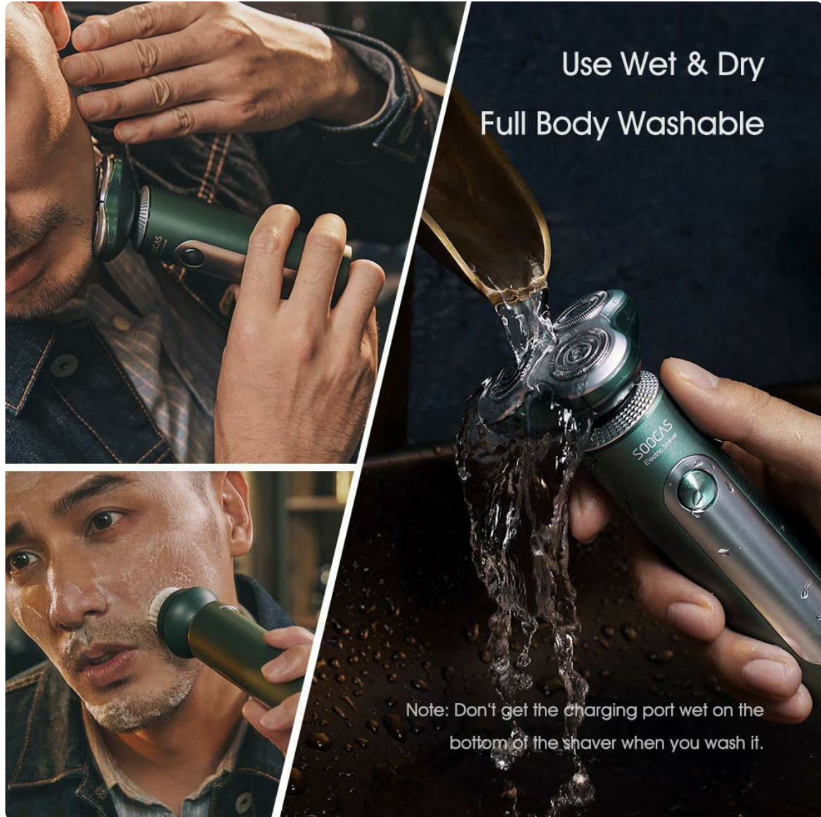
Figure 5.1: Wet & Dry Use and Full Body Washable Feature