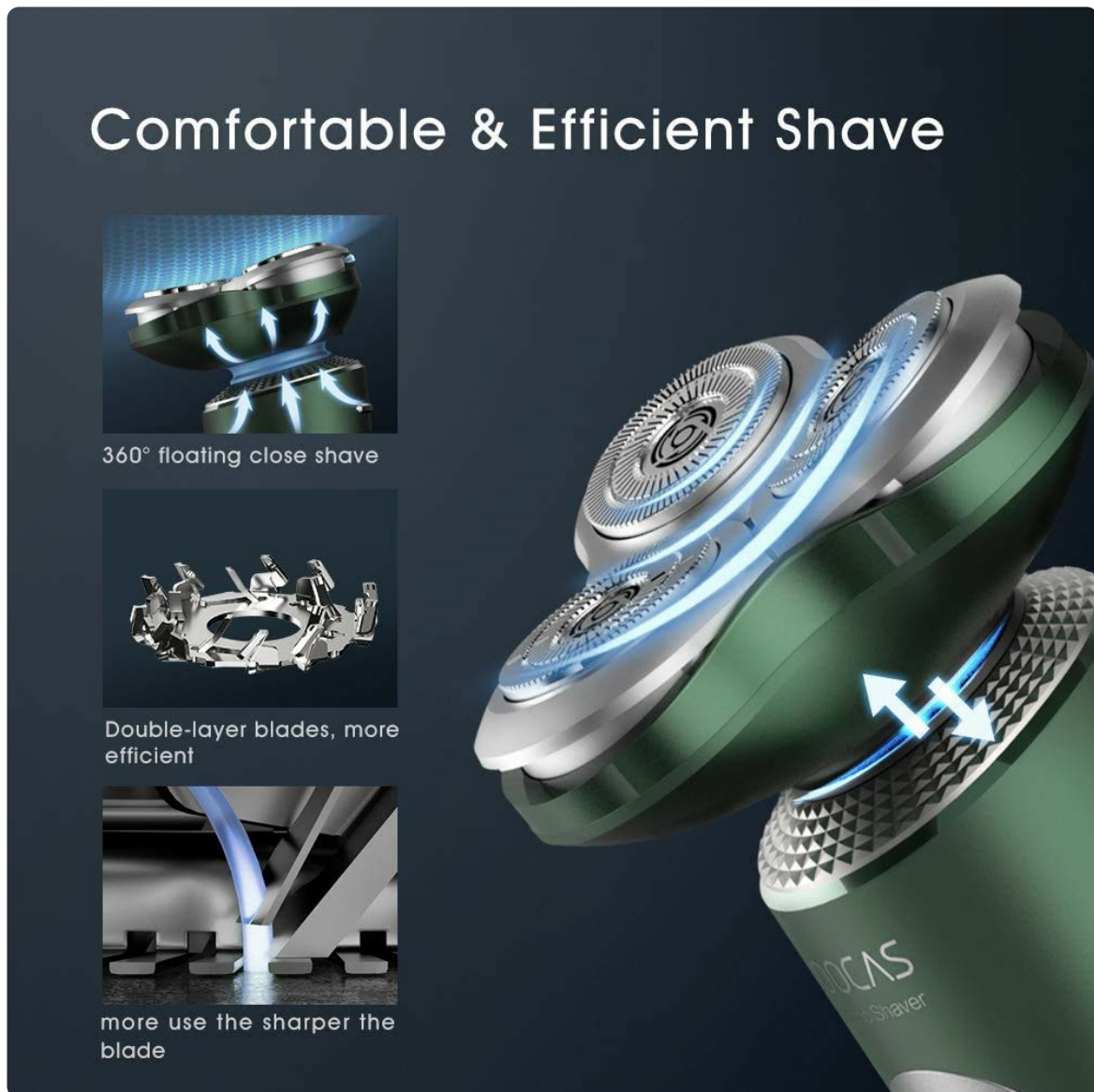
Figure 4.1: Smooth & Efficient Close Shave Technology