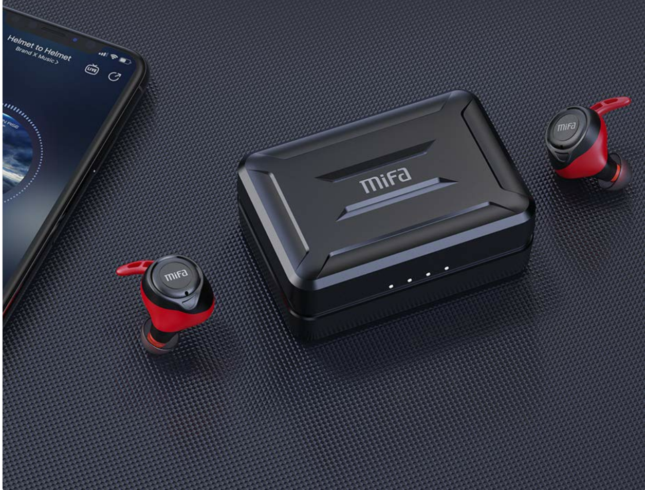
Figure 4.2.1: One-step pairing process with earbuds and charging case.

Pick up 2 headsets from charging box They will connect each other automatically then only one step easily enter mobile phone Bluetooth setting to pair the earbuds.