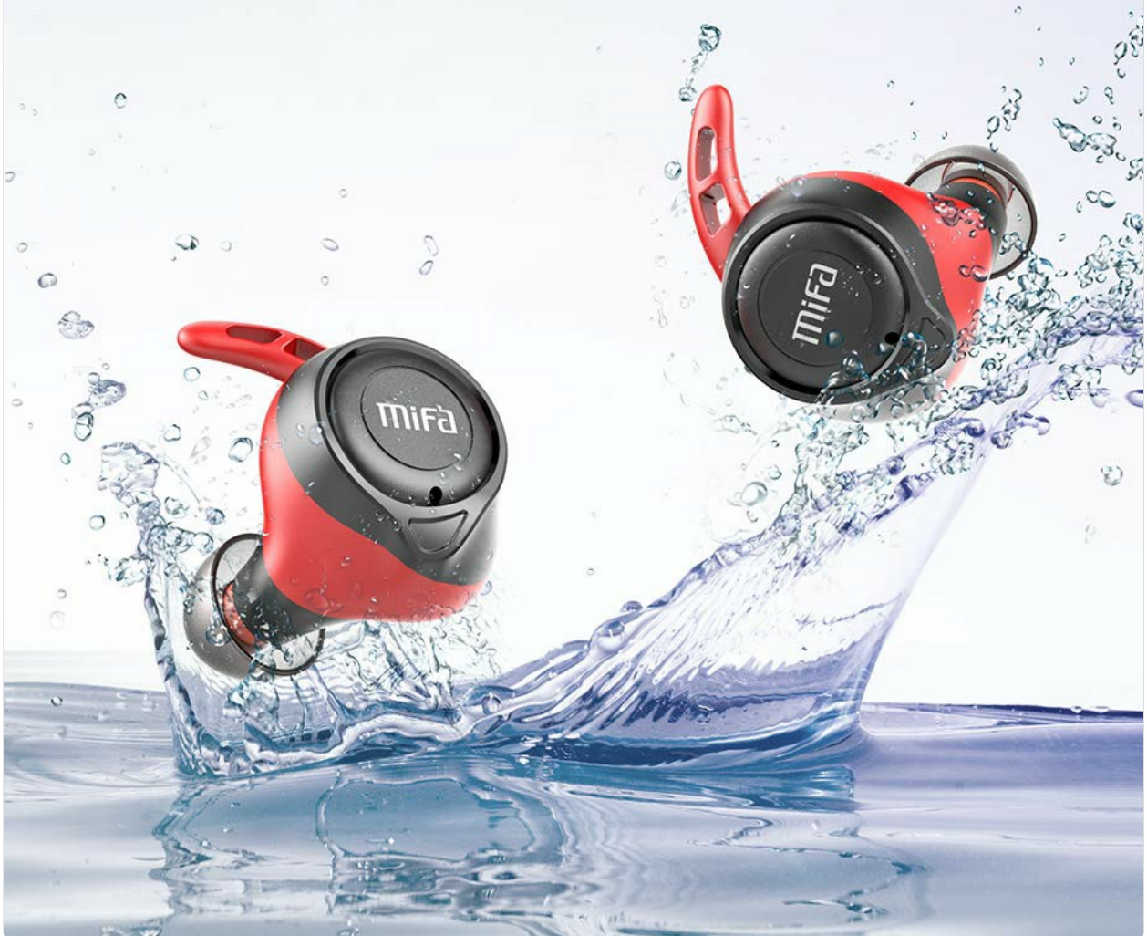
Figure 6.2.1: MIFA X11 earbuds demonstrating IPX7 waterproof capability.

Earbuds inner Nano-coating makes it possible to waterproof for 1 meters deep for 30 minutes. It is suitable for sports to prevent water. Ideal for sweating it out at the gym . Even Wash the earbuds and base