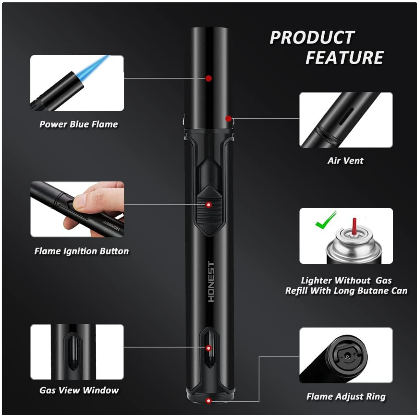
Image 3.1: Detailed diagram highlighting the main components and features of the lighter.