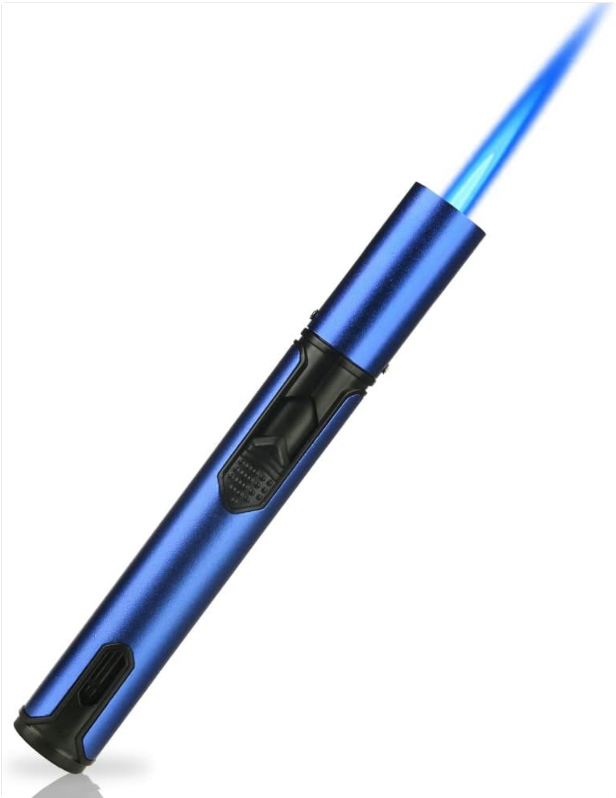
Image 1.1: The PROMISE Jet Torch Lighter in blue, demonstrating its powerful jet flame.

The PROMISE Jet Torch Lighter is a versatile and portable tool designed for various applications, including lighting candles, grills, BBQs, and for camping use. It features a powerful jet flame, adjustable flame height, and a refillable butane gas tank.