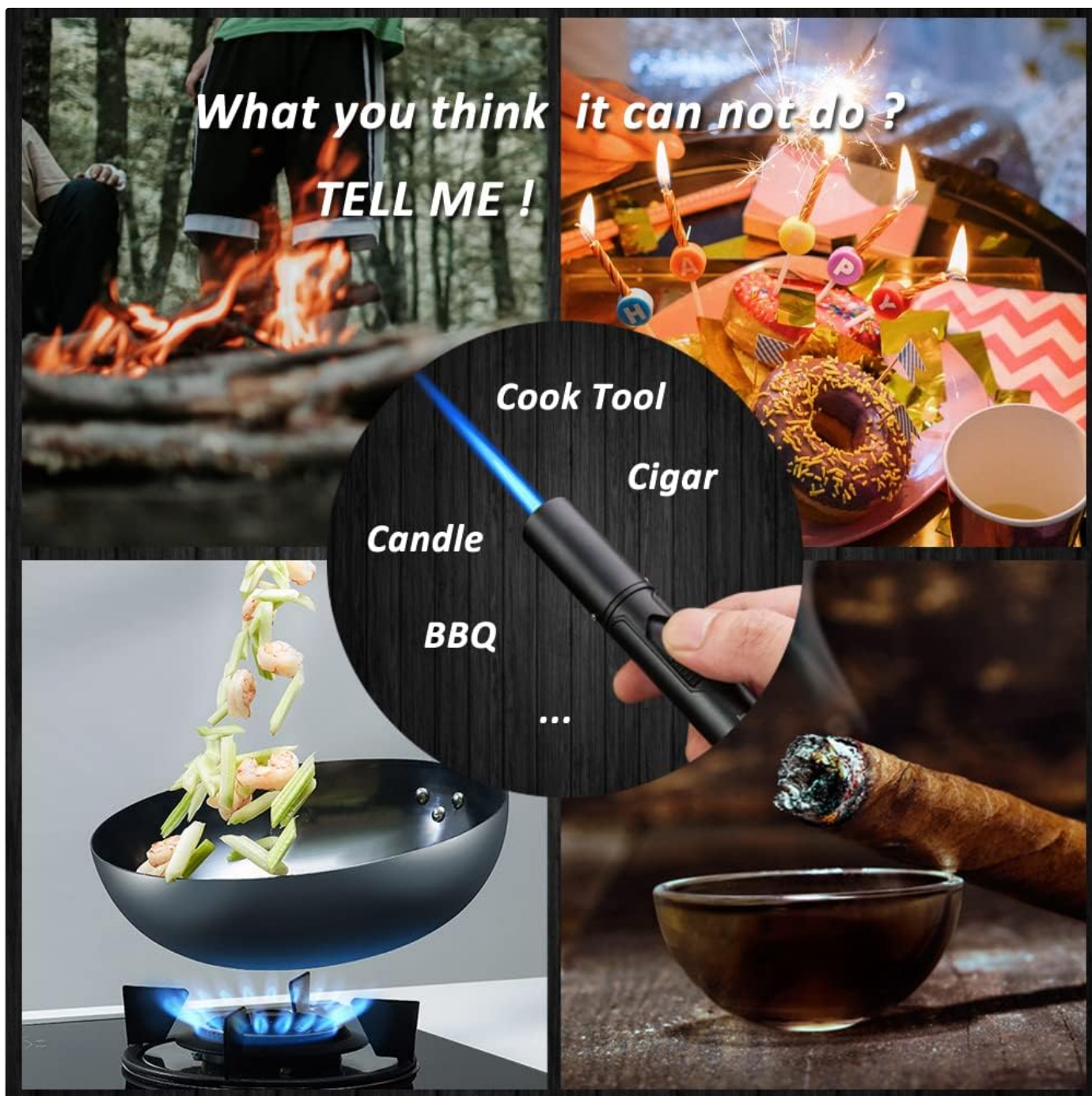
Image 1.2: Examples of the lighter's versatile applications, from outdoor activities to household use.