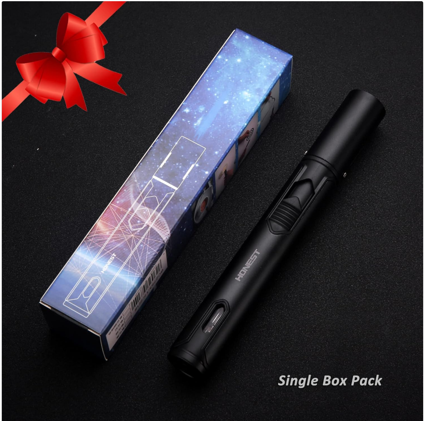
Image 4.1: The lighter and its accompanying gift box as received in the package.