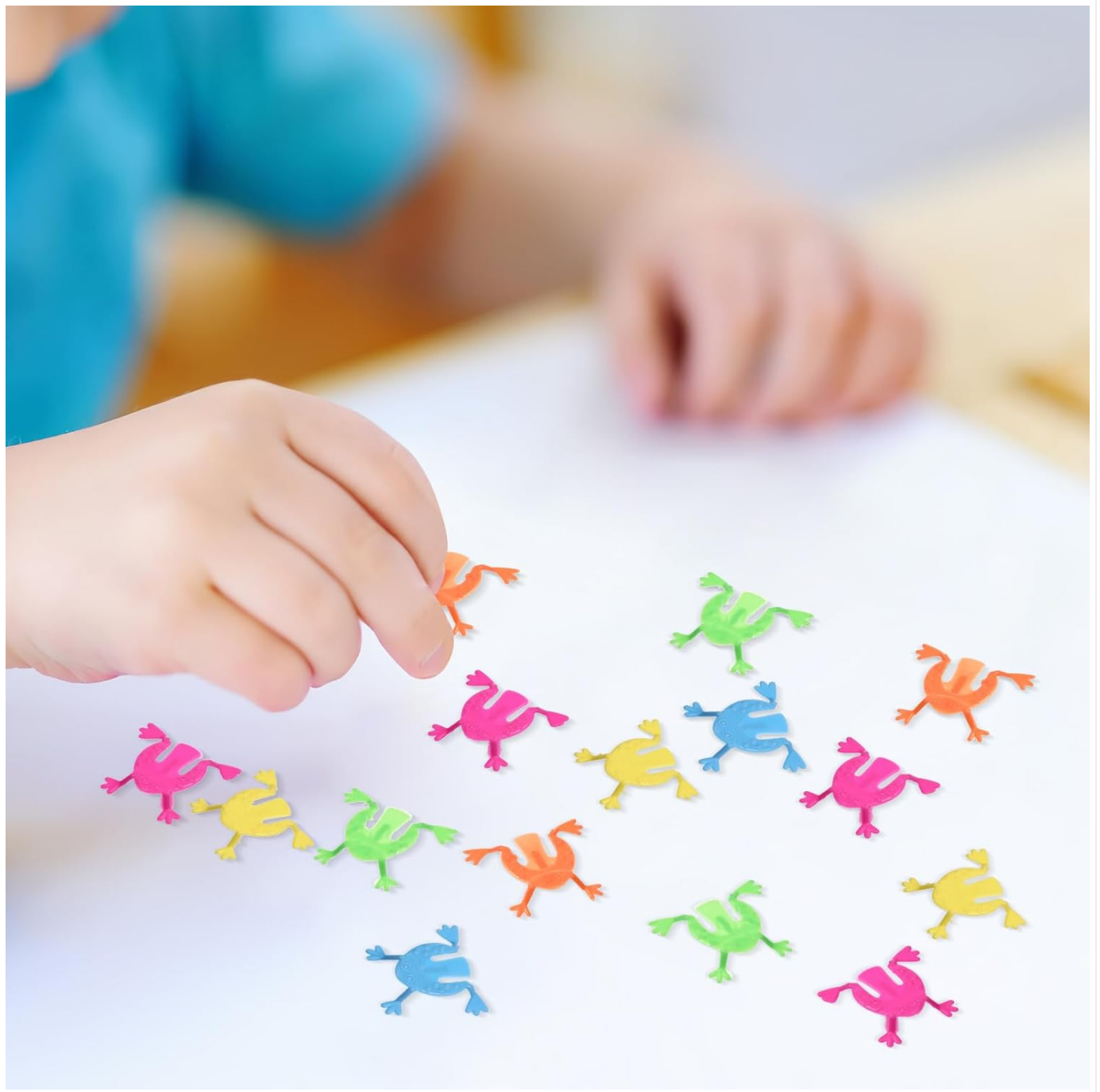
Image: A hand pressing the back of a green jumping frog, illustrating the primary method of operation.