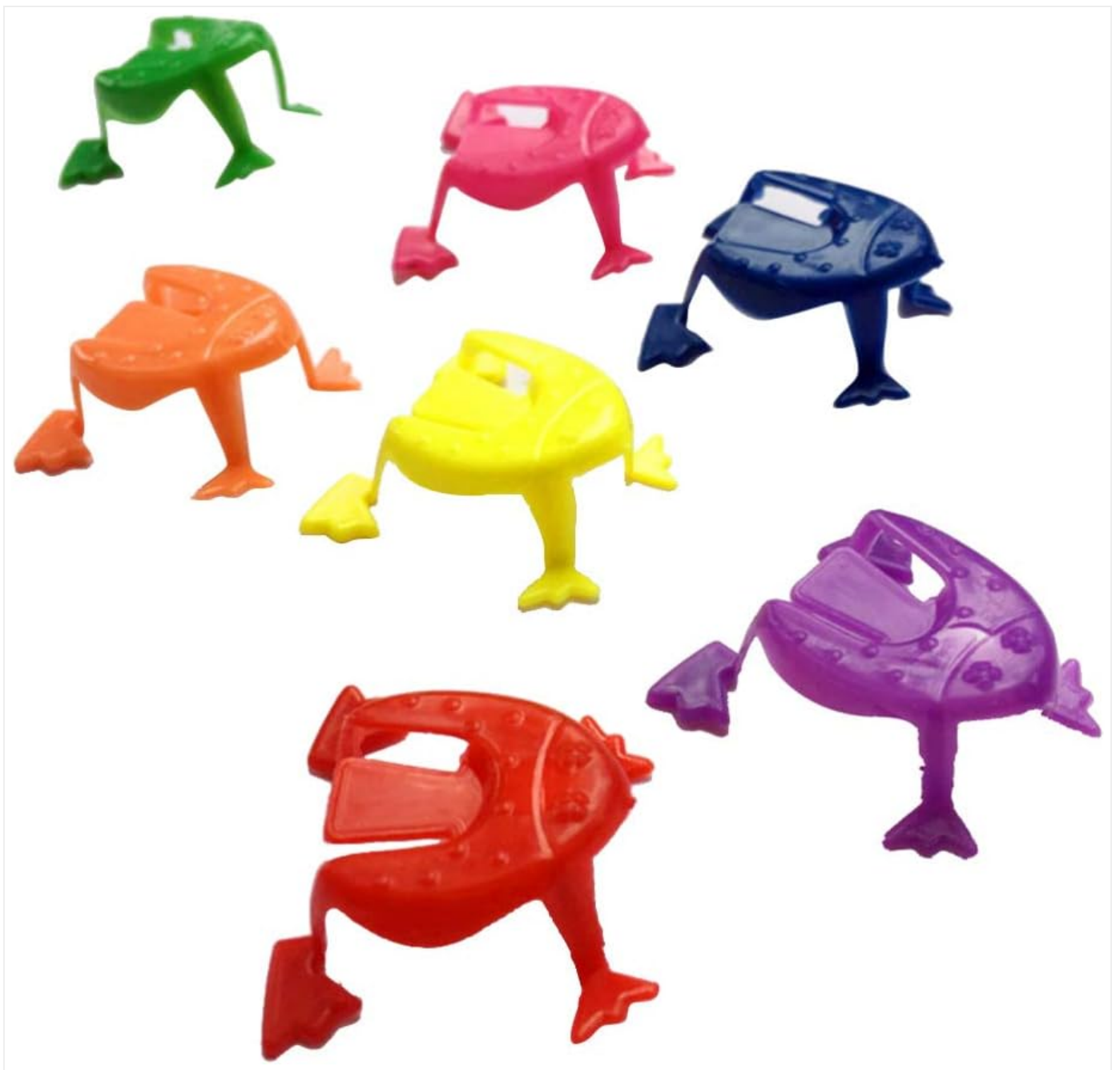
Image: Assortment of TOYANDONA jumping frogs in green, pink, blue, orange, yellow, purple, and red. These small plastic toys are designed to jump when pressed.