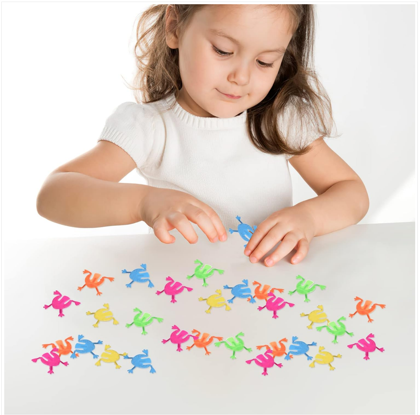
Image: A child interacting with several jumping frogs spread across a table, showing typical play scenario.