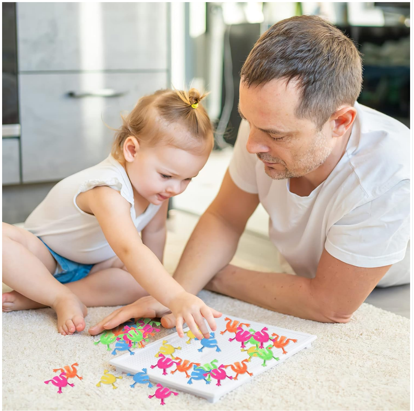
Image: An adult and child playing together with the jumping frogs on a mat, suggesting cooperative play.