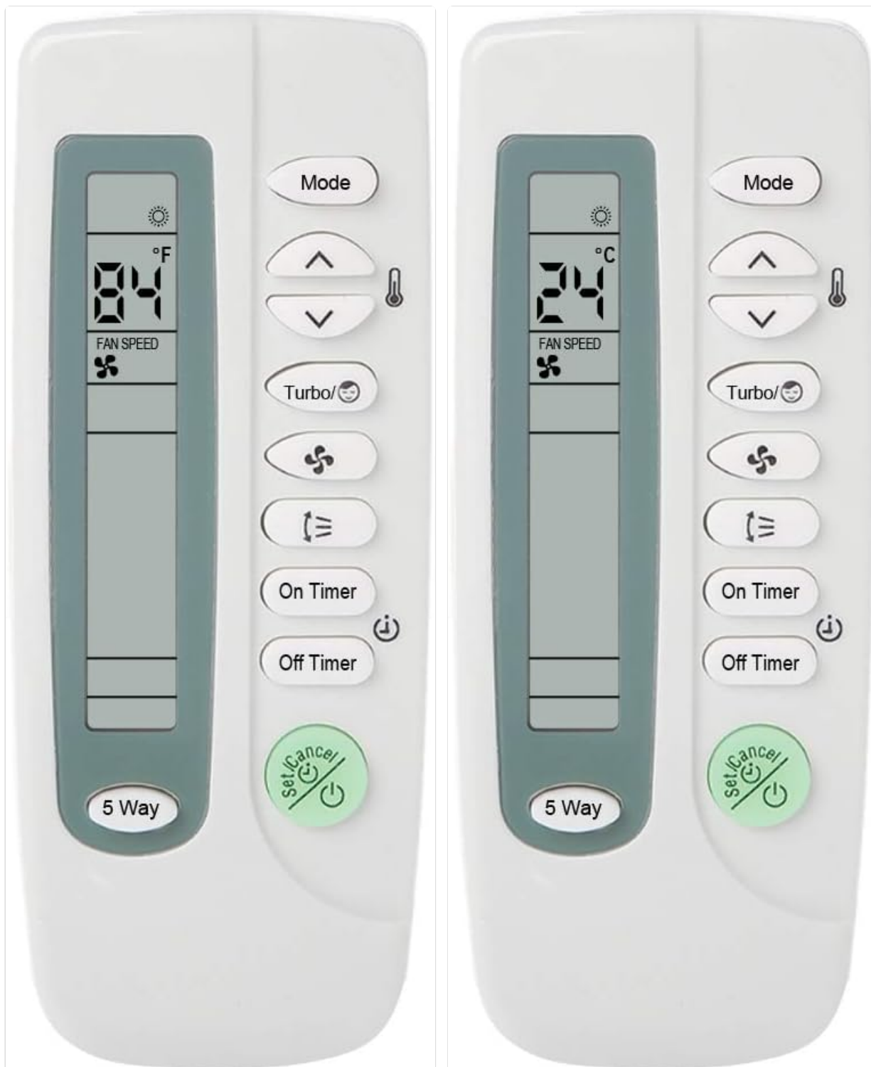
Figure 4: Examples of Fahrenheit (left) and Celsius (right) temperature displays.