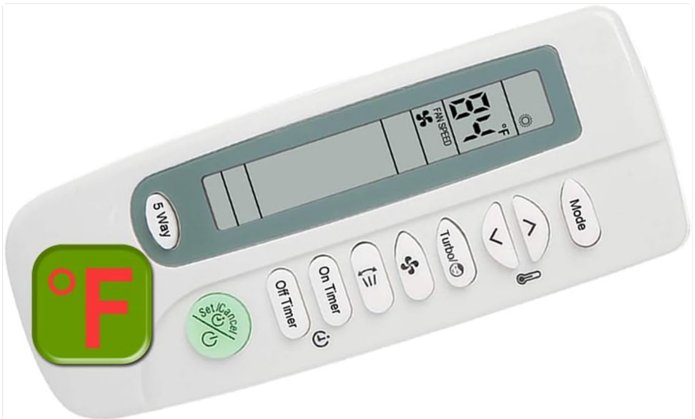
Figure 2: Overview of the remote control with its display and buttons.