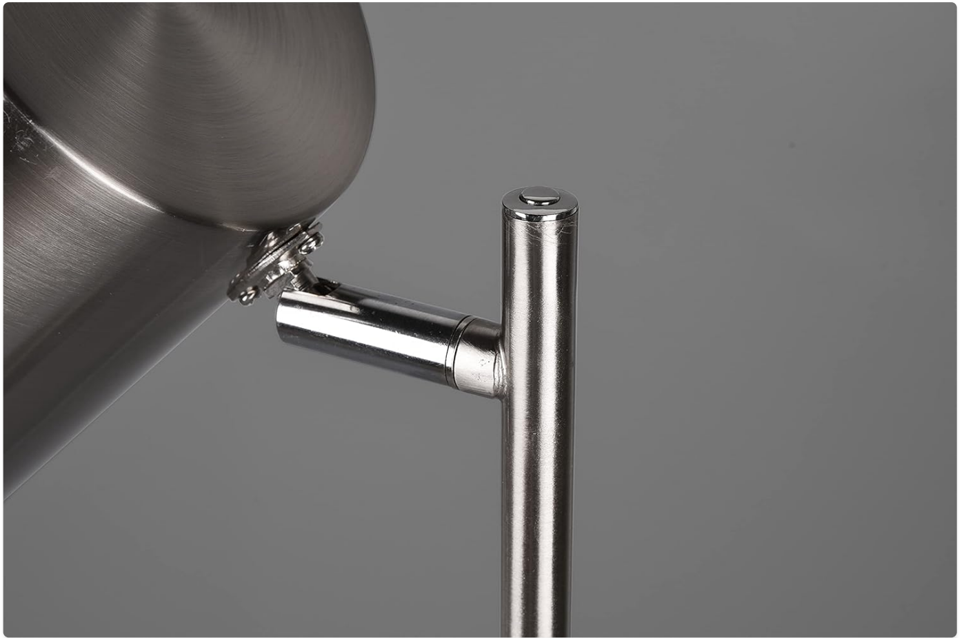
Image 5.2: The adjustable joint connecting the lamp head to the main pole, enabling flexible light direction.