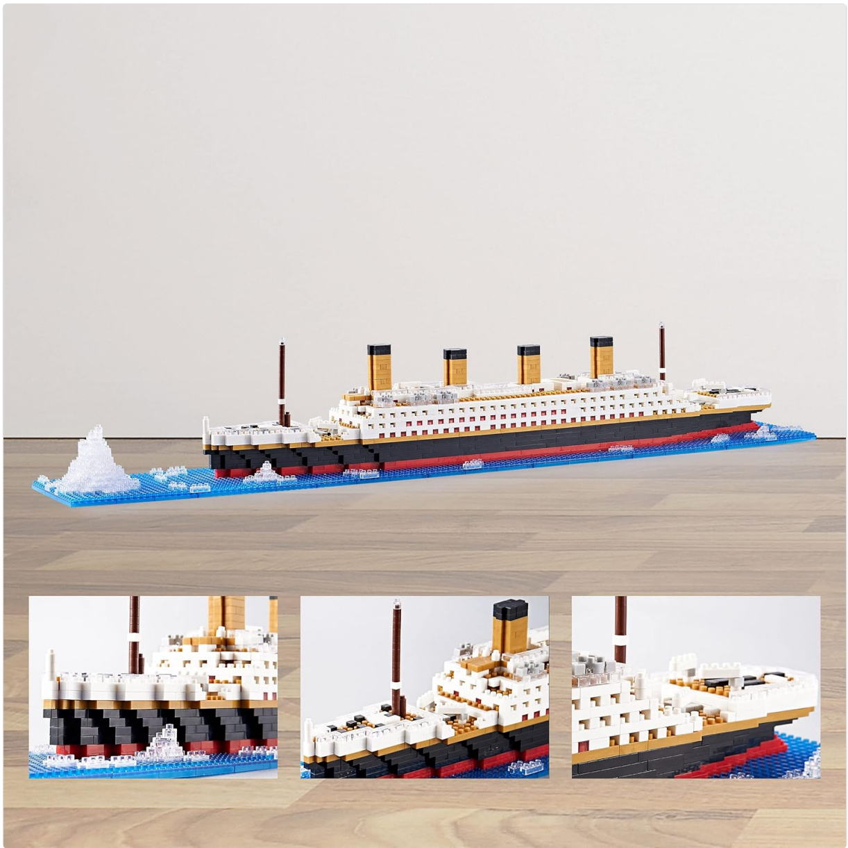
Figure 1: Fully assembled KLMEi Micro Mini Blocks Titanic Model Kit.

The kit includes a detailed instruction booklet. Familiarize yourself with the symbols and step-by-step diagrams before starting. Due to the micro size of the blocks, a pair of tweezers (not included) may be helpful for precise placement.