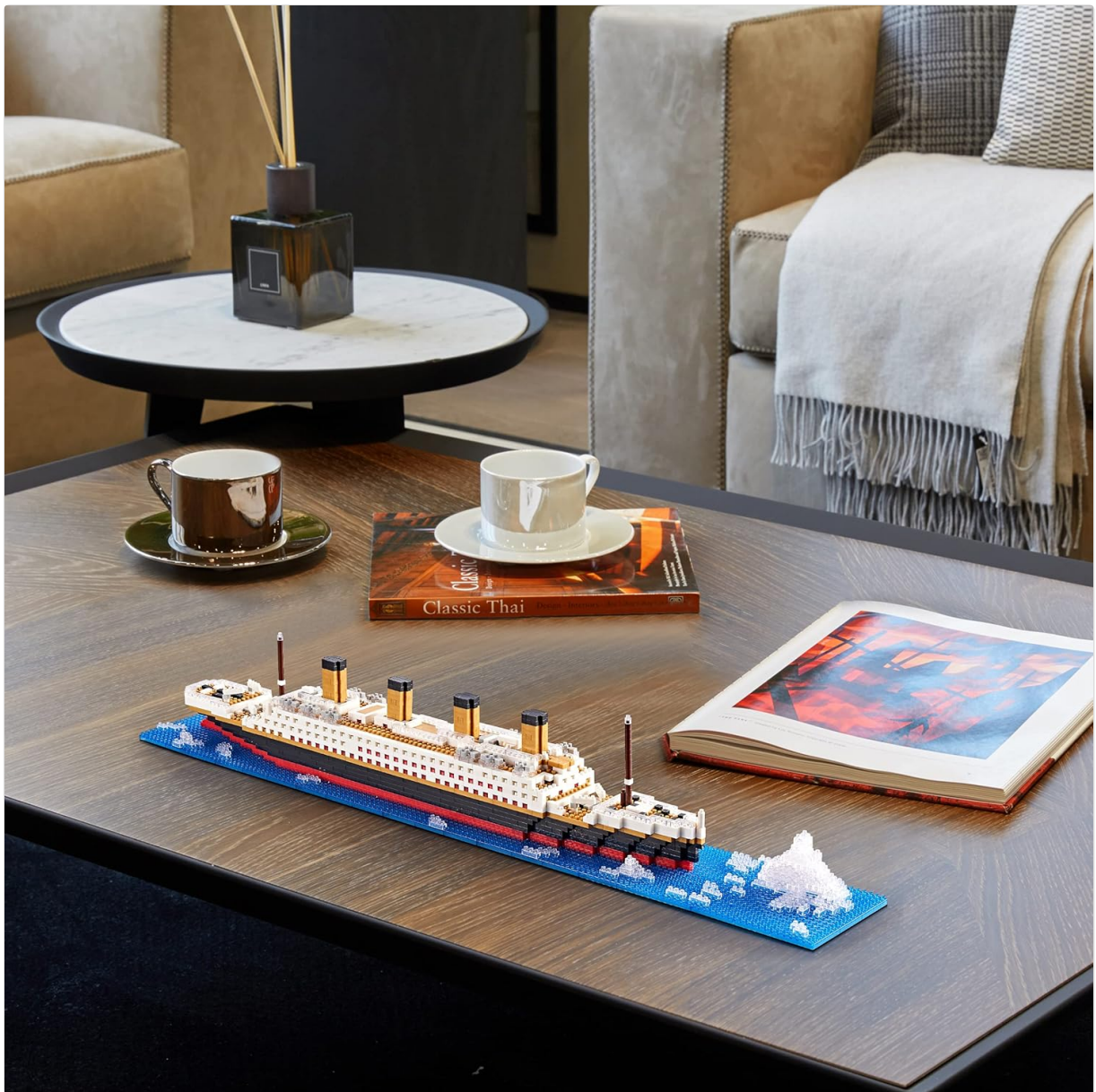
Figure 4: The Titanic model as a decorative display piece.