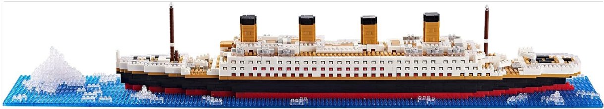
Figure 3: Detailed side view of the Titanic model.

Your browser does not support the video tag.