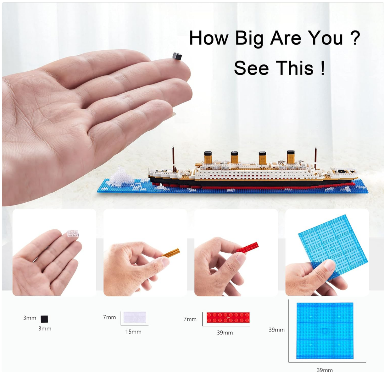
Figure 2: Size comparison of micro blocks to standard building blocks.