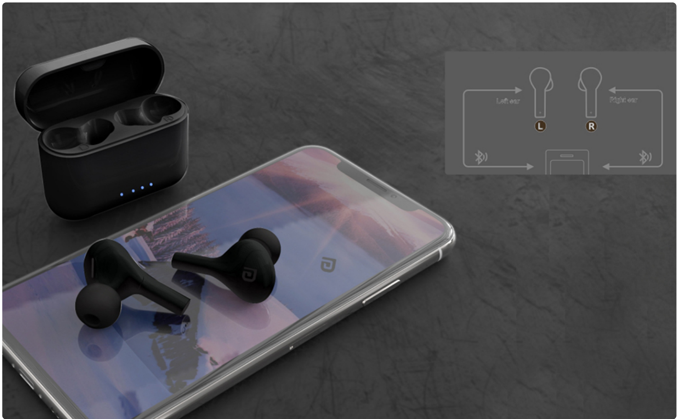
Image: A diagram illustrating the Bluetooth pairing process for the earbuds with a mobile device.