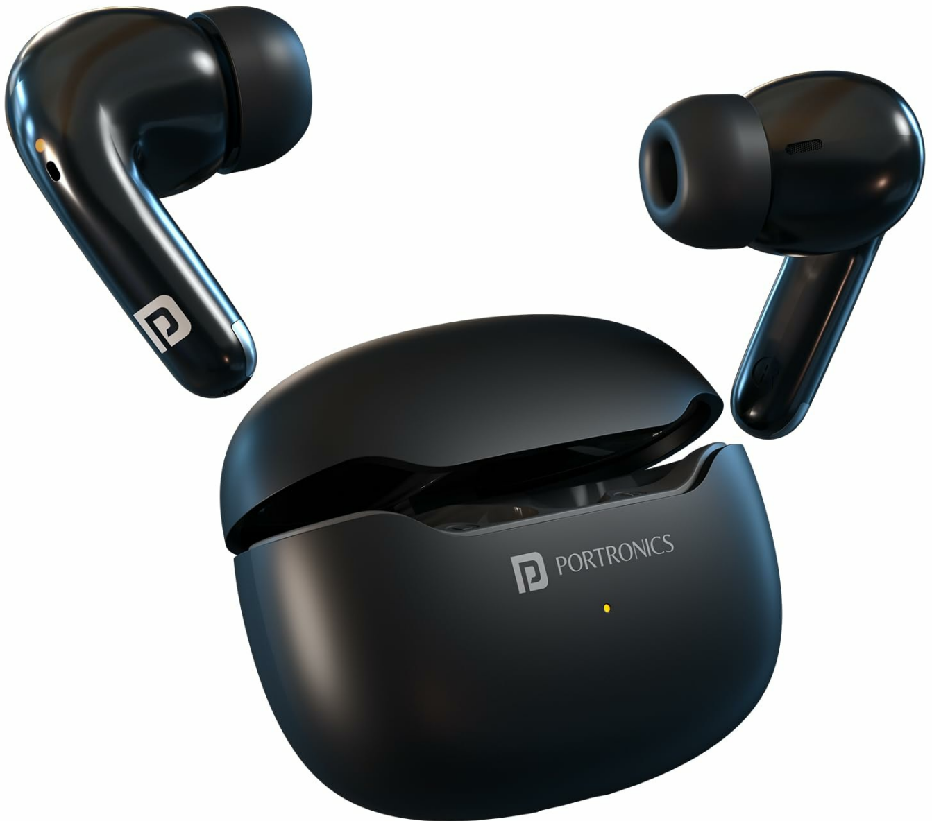
Image: Portronics Harmonics Twins 33 ANC Earbuds in their charging case.