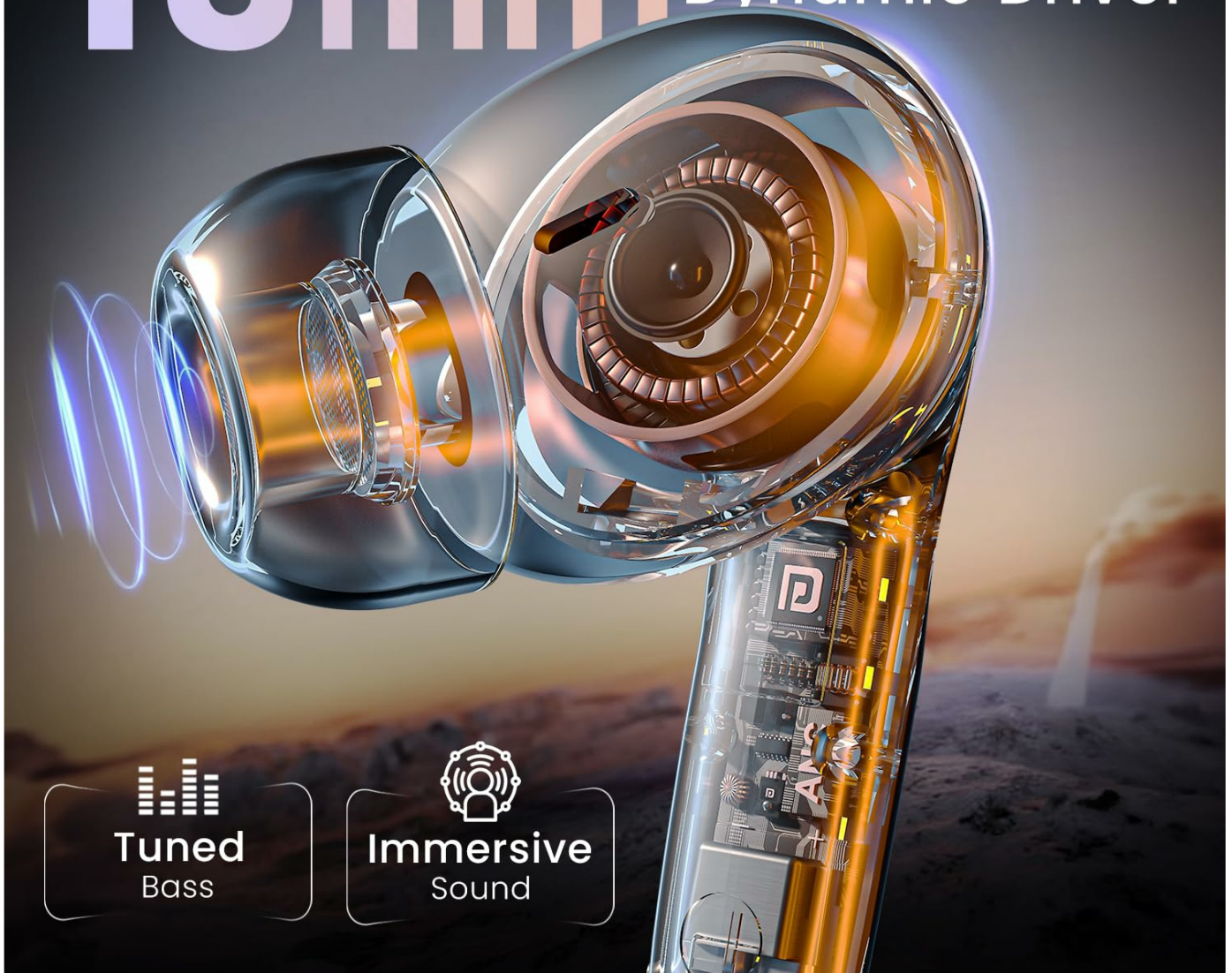
Image: Close-up view of the earbuds, highlighting their design.